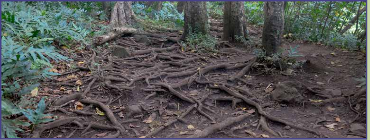
Pīpīwaī Trail exposed roots