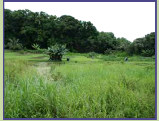
Kapahu Living Farm