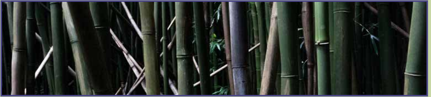
Pīpīwaī Trail bamboo forest