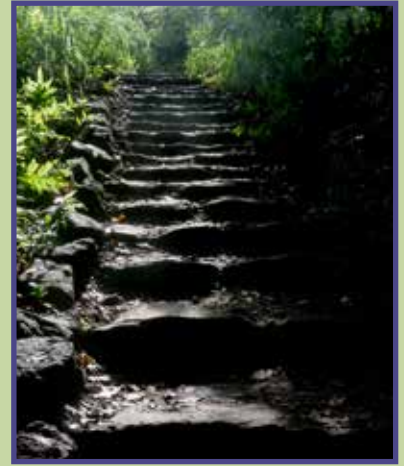
Pipīwai Trail steps