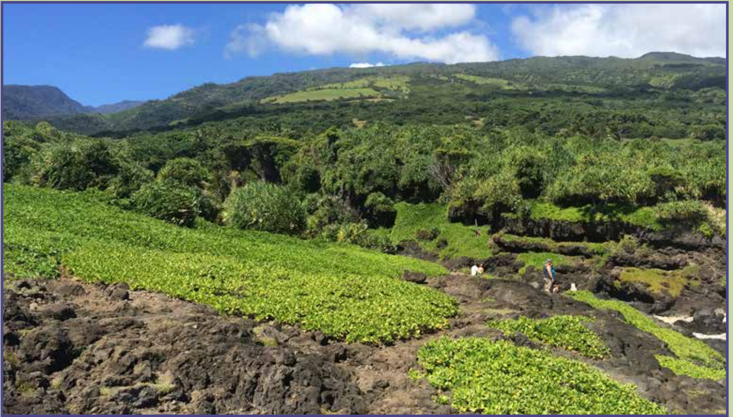
View mauka (inland) towards 'Ohe'o Gulch and Kīpahulu Valley from Kūloa Point Trail