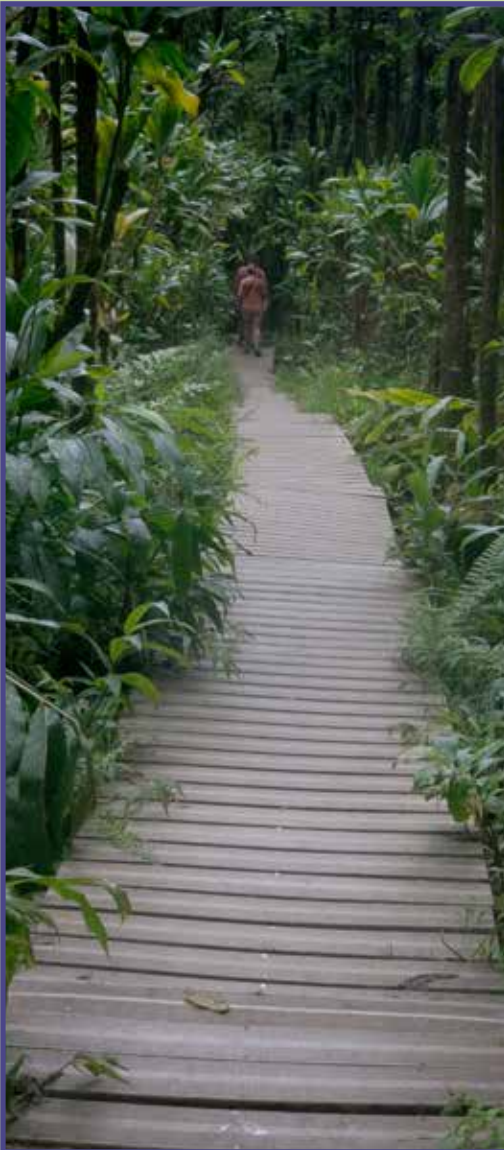
Pīpīwaī Trail boardwalk

Project Purpose: The purpose of the Kīpahulu Comprehensive Plan is to provide park management with direction on protecting natural and cultural resources, while providing valuable visitor experiences, maintaining efficient park operations, and creating partnerships.