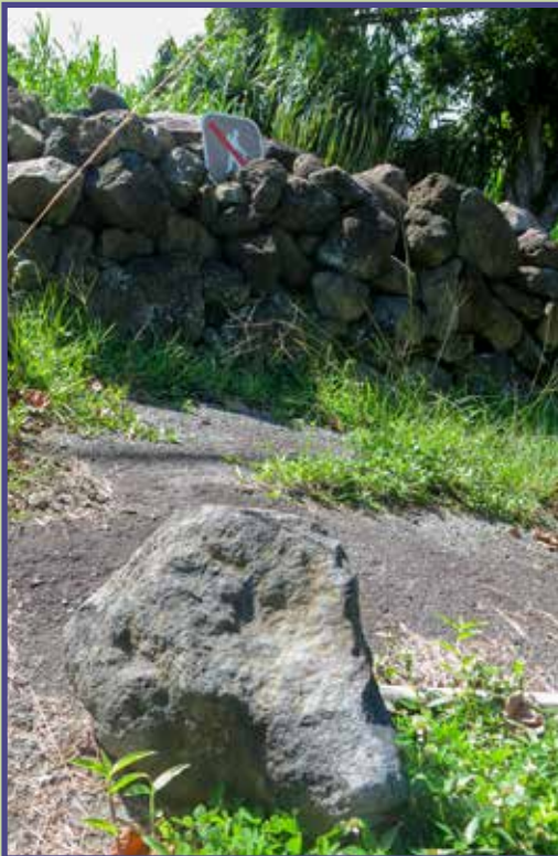
Historic wall near parking

Haleakalā National Park is asking for public feedback on the overall vision for the plan from November 10, 2016, to December 15, 2016. During this period, the public is encouraged to comment on the public scoping questions above and share any additional thoughts on your vision for the Lower Kīpahulu Valley. Please keep in mind when commenting that the unique content of comments received, rather than the number of times a similar comment was heard, is what will help refine the management alternatives. Bulk comments in any format (hard copy or electronic) submitted on behalf of others will not be accepted.