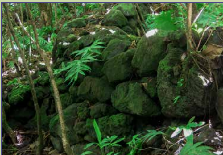
Close up of historic wall

The project team will accept comments through December 15, 2016.