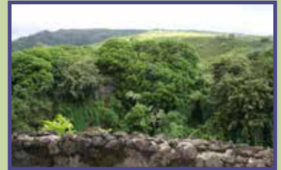
Pipīwai Trail Overlook