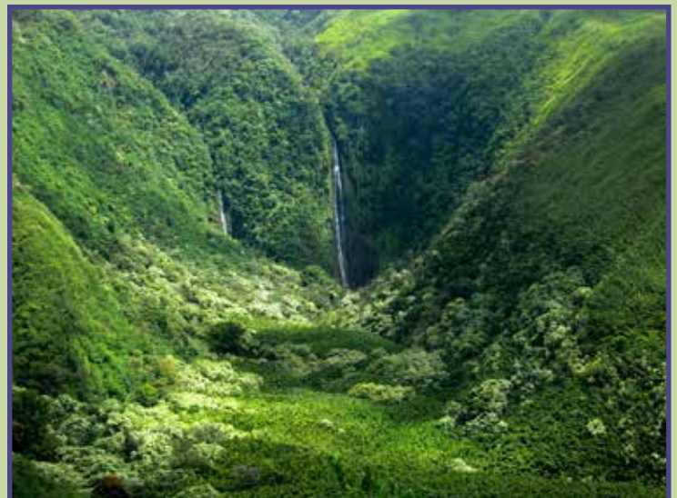
Horse Trail overlook