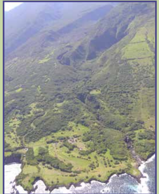
Kīpahulu aerial view