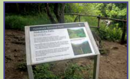
Pipīwai Trail wayside sign