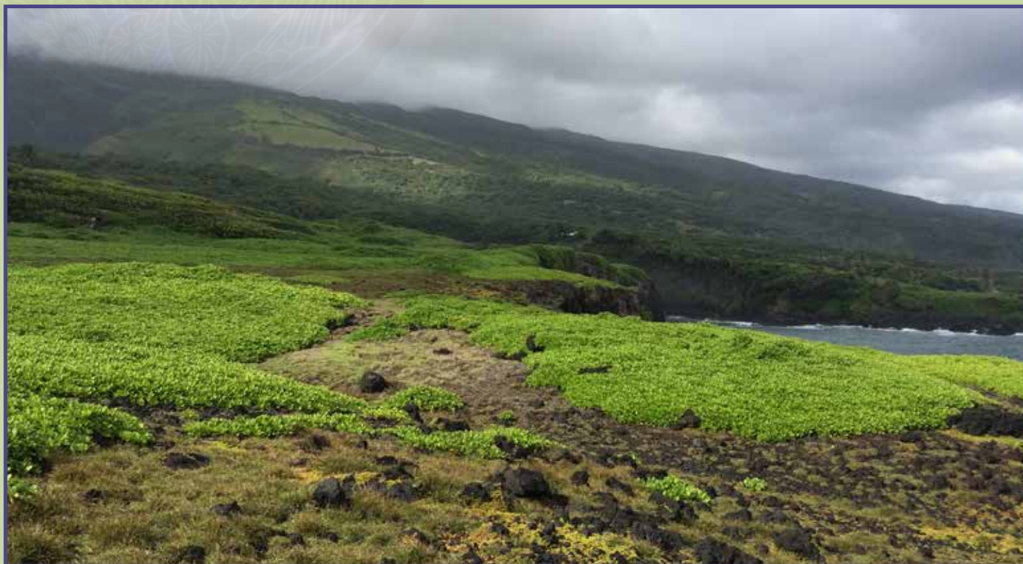
View of Kīpahulu coastline

Mahalo for your continued interest in the Haleakalā National Park Kīpahulu Comprehensive Plan!