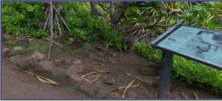
Wayside at Kūloa loop