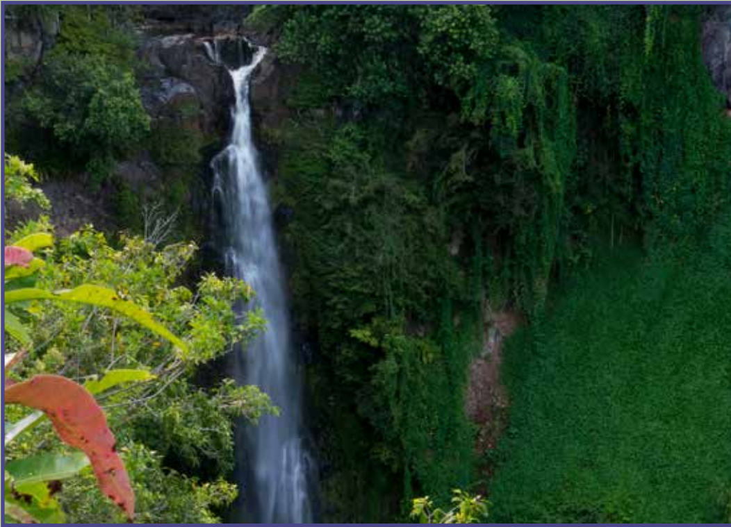
Makahiku Falls Overlook