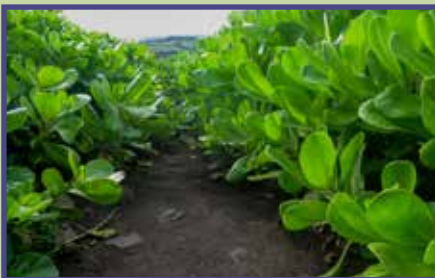
Social trail impacting vegetation