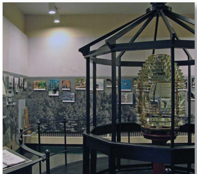
Exhibits at Bayfield Visitor Center

Option 4: The two visitor centers would be consolidated into one site outside of Bayfield, such as at Little Sand Bay or on other lands not currently within NPS ownership near Bayfield. If the site were on the waterfront, a launch site for boats and kayaks could be provided. The facility could be leased or owned by the National Park Service.