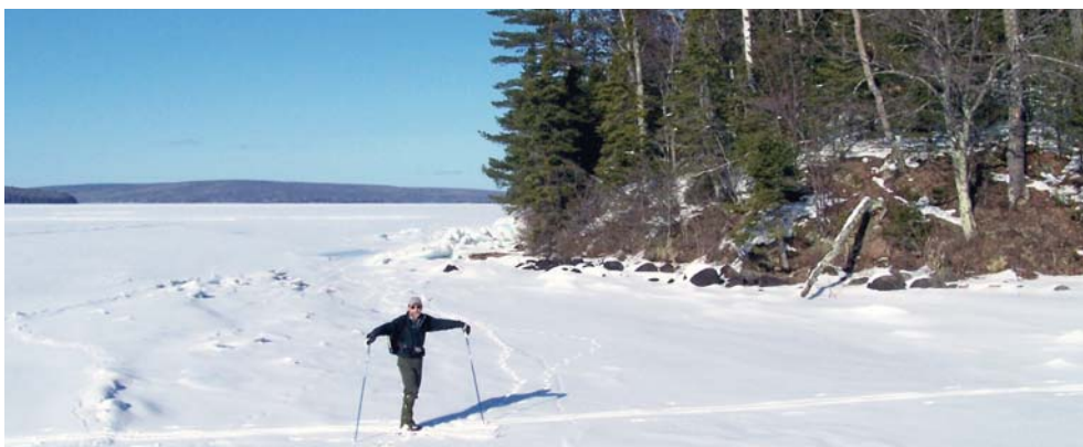
Crosscountry skier at Basswood Island

To assist you in understanding all the issues that begin on page 6, we first describe the background of the challenges facing the park.