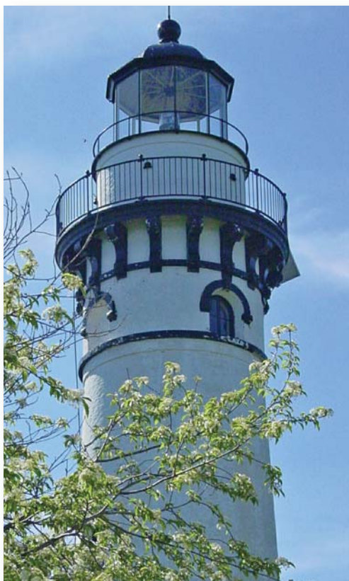
Outer Island Lighthouse

Option 3: Based on historic significance, cost-efficiency, and other criteria, park managers would prioritize (1) the light stations and then (2) for each light station prioritize the contributing structures and cultural landscapes. Based on the assigned priorities, the National Park Service would determine the level of treatment to give each resource. Light stations and/or contributing structures and landscapes at the low end of the priority list would receive less attention compared to the high priority light stations, contributing structures, and landscapes. If a light station structure were rehabilitated, the interior of the structure would be open for public use.