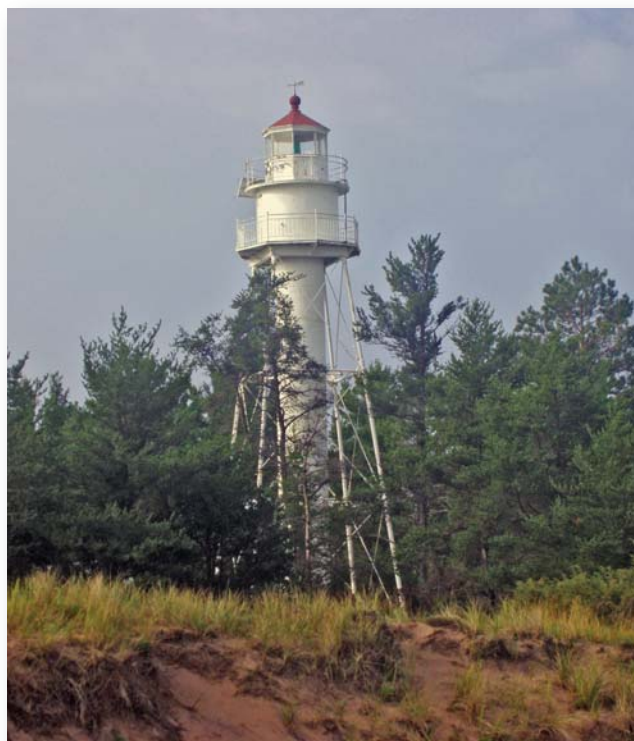
LaPointe Lighthouse, Long Island

Vegetation is encroaching into formerly cleared areas around many of the light stations, contributing to the loss of some