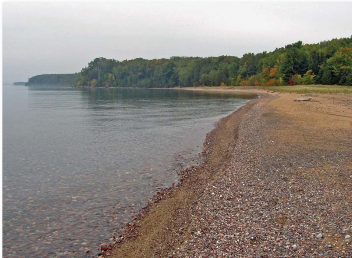
Cat Island sandspit panorama

Option 9: NPS managers would stabilize, and potentially rehabilitate, and interpret cultural resources that are not primary visitor attractions (e.g., farmsteads, logging camps).