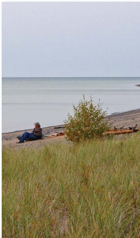
Relaxing on Outer Island

Option 1: NPS managers would continue existing management priorities, striving to maintain current resource conditions and visitor experience opportunities to the extent possible. Assuming funding levels are maintained, there would be no significant changes in visitor uses or facilities. There would continue to be a mixture of scattered and clustered designated campsites and zoned (undesignated) camping.