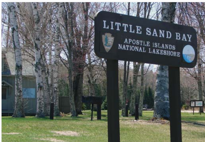
Little Sand Bay

The Little Sand Bay administrative facilities consist of seasonal dormitories, docks, fuel facilities, artifact storage space, offices for several rangers, and a fire cache. All of the structures were designed as seasonal facilities and are of marginal quality and construction.