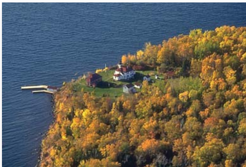
Raspberry Island Light Station from above

Option 2: Park managers would focus on maintaining the Raspberry Island Light Station and its cultural landscape, both for cultural resource protection and for visitor use. Visitor experience opportunities would continue or expand there. Only the most important elements of the other light stations would be stabilized. There could be some deterioration of some facilities in the five other light stations.