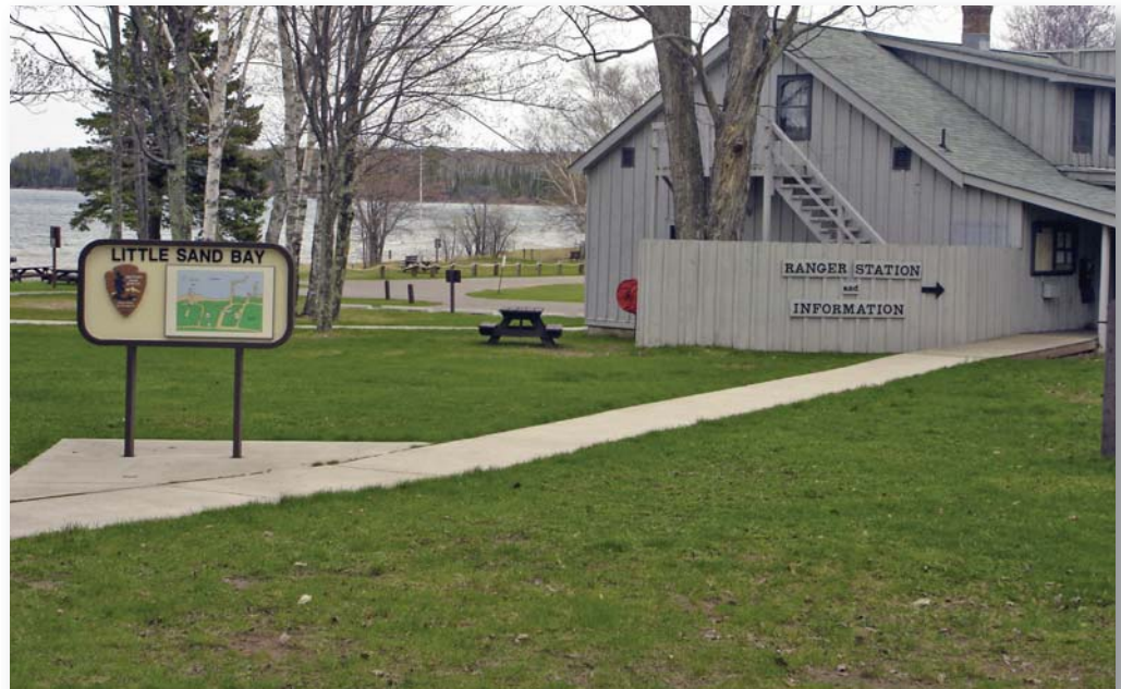
Little Sand Bay Visitor Center