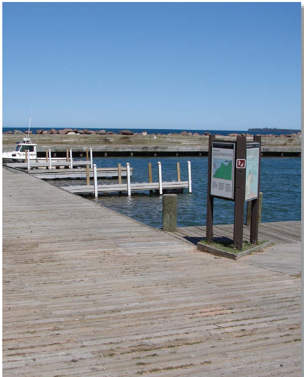
West end of Little Sand Bay Harbor

Option 3: Administrative facilities would be consolidated elsewhere on the mainland, either on NPS or non NPS lands. The new site would include a marina for NPS boats. If it were built on non-NPS lands, the site either would be leased or bought by the National Park Service.