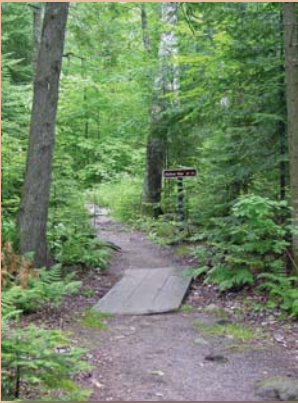
Julian Bay trail

"Some nonwilderness areas have sensitive resources and are vulnerable to damage from visitors, such as on Stockton-Presque Isle and Long Island. An extensive network of social trails (i.e., those created by visitors) has formed on the Stockton-Presque Isle tombolo, affecting the fragile dune vegetation that grows there."