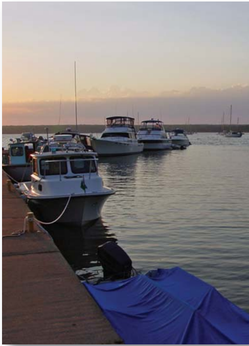
Stockton Presque Isle dock

Several factors affect this issue. The overall number of visitors going to the nonwilderness areas on the islands has remained relatively steady over the past 10 years. Campsites are sometimes full on the weekends during the peak season. Visitors often cannot get the campsites they want when they want them, such as on Sand, York, and Oak islands. Some people would like the National Park Service to provide more visitor facilities and/or opportunities for visitors on the islands, while others believe no changes should occur. Kayak outfitters are interested in additional group campsites, such as on Sand, Oak, and Basswood islands. There are only a few such sites, which limits where large kayak groups can go. Desires have also been expressed for more day use picnic areas, such as on Raspberry, Stockton and Sand islands.