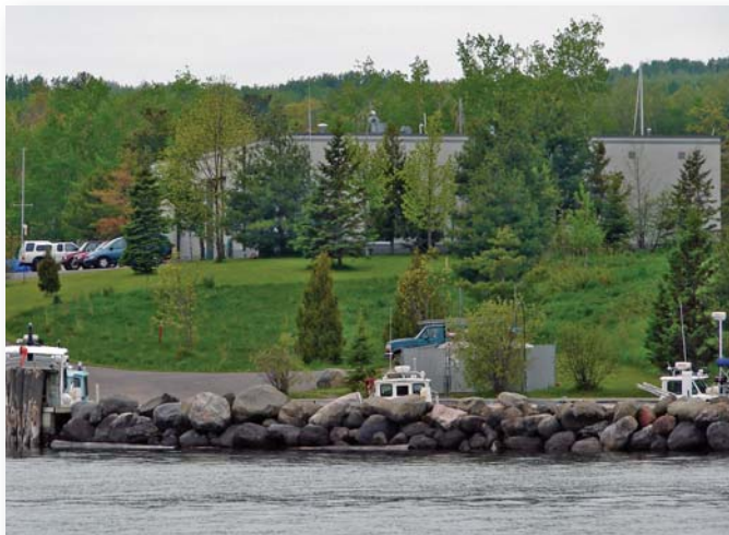
Roys Point facilities

Issue 7 focuses on whether or not the existing administrative facilities are functioning effectively and efficiently, meeting the needs of both park staff and visitors. With the facilities being in the three locations mentioned above, the park staff is fragmented. The lack of a central facility means that critical tools, equipment, and supplies must be stored in several