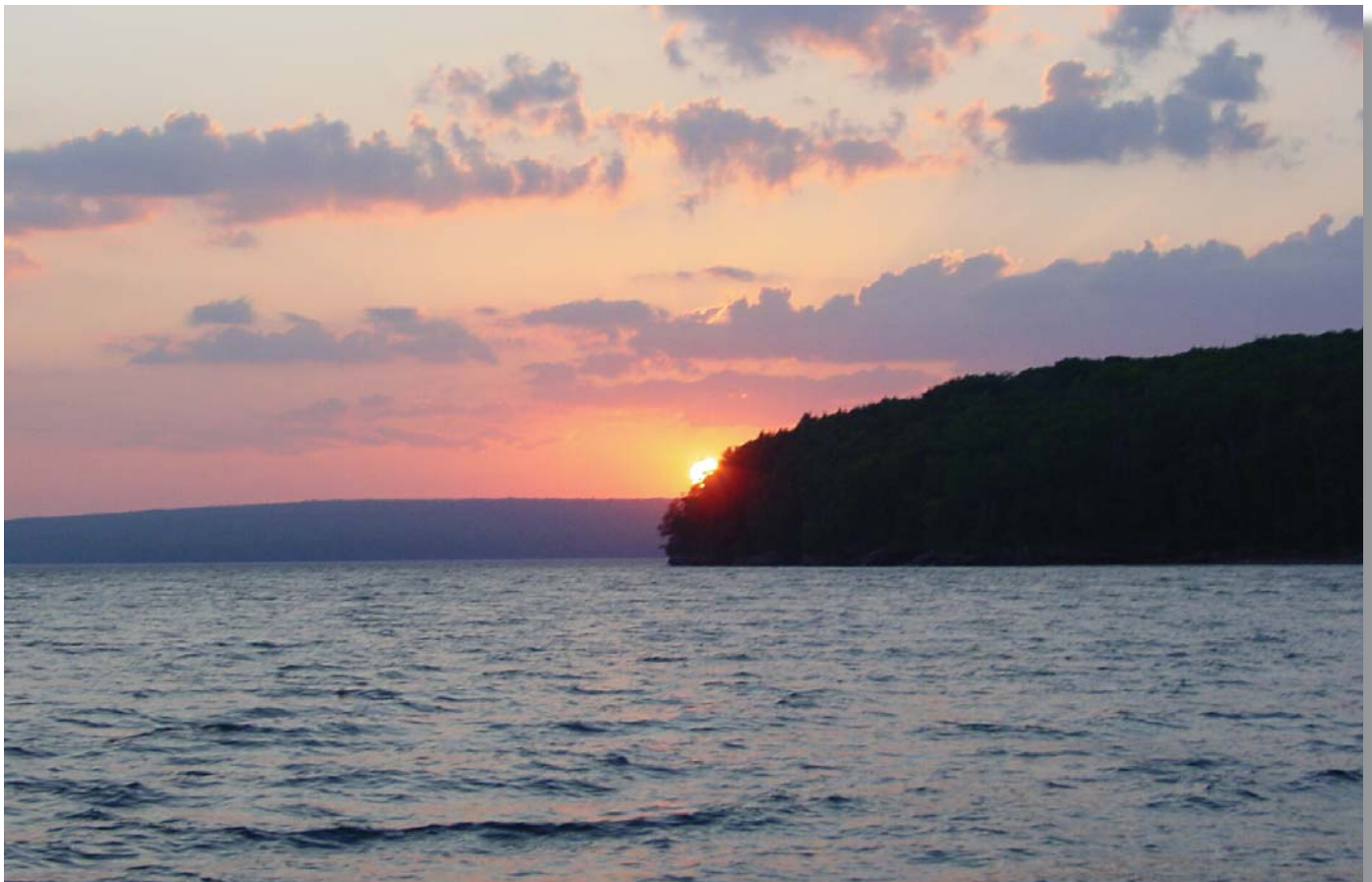
Sunset from Quarry Bay