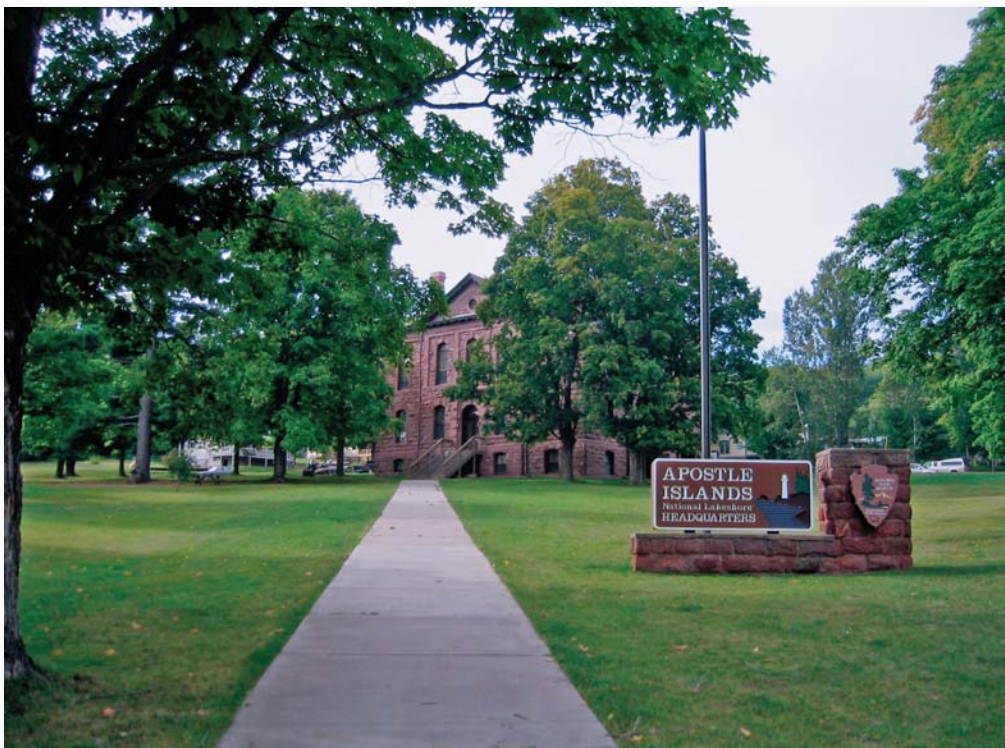
Apostle Islands Visitor Center in Bayfield