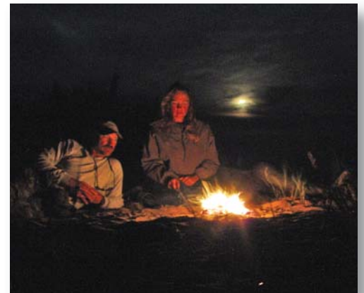
Campfire in the moonlight on Outer Island

Option 2: New designated campsites would be established, based on such criteria as interest/demand for new campsites, resource sensitivity of sites, and signs of previous human disturbance. The emphasis would be on sites being clustered to minimize resource impacts, keep maintenance costs as low as possible, and minimize fragmentation of the wilderness resource. The designated campsites would have the same amenities as the existing designated campsites in the wilderness area. (The implication of option 2 is that there would be more opportunity for people to camp in the wilderness area but possibly less solitude for those seeking to camp away from other people. The