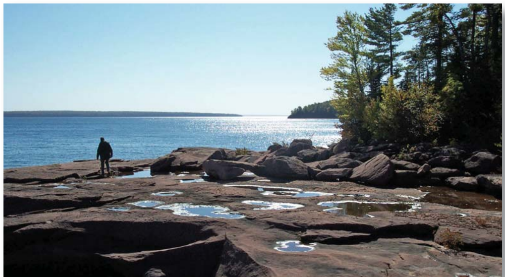
Bear Island shoreline

When these properties come under NPS management, maintenance tasks will place a new burden on the park staff. Priorities need to be set regarding the uses and level of preservation set for each property, structure, and landscape. Decisions also have to be made on the future of the docks associated with the properties — should they be maintained or removed?