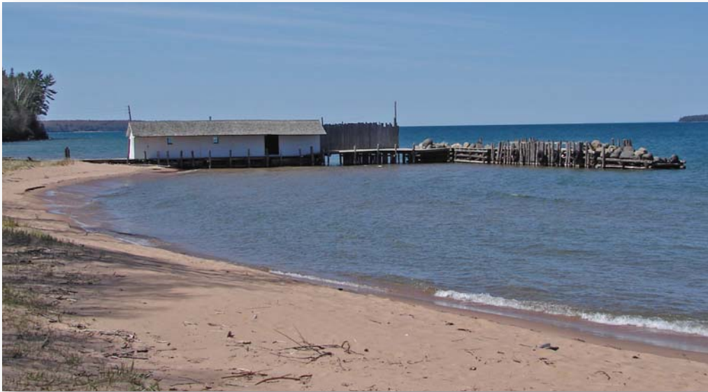
Hokenson dock at Little Sand Bay