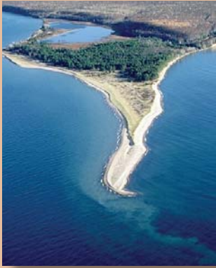
Outer Island sandspit

Wild landscapes in the greatest of lakes.