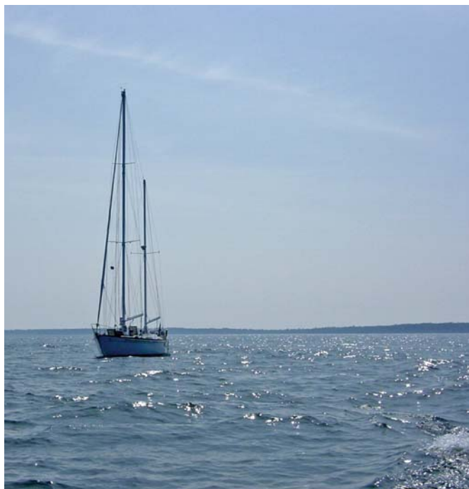
Lone sailboat on Lake Superior

resources; and provide formal recognition for patrols and emergency response activities park staff already perform. Some do not want to see an increase in NPS jurisdiction in this area: they believe it could increase government regulation between islands or they feel the NPS can't do an adequate job of patrolling or protecting the waters they already have. In any case, only a few people seemed to think the issue was worth discussing during the public scoping period, so it will not be addressed further in the GMP.