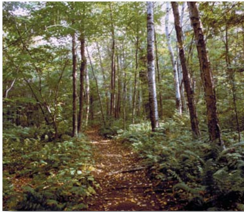
Apostle Islands trail

About 40 people attended the public meetings, and 40 written responses (nine from organizations) were received in response to the October 2004 scoping newsletter. A variety of issues and concerns were identified, with no one issue standing out. People who wrote comments most frequently mentioned they don't want to see the park built up with new developments or other human intrusions. The two greatest concerns for the park's future were overcrowding/overuse and pressure to develop more facilities. Some people were concerned about noise within and outside the park, and the need to maintain opportunities for quiet and solitude on the islands. A number of comments focused on facilities, including the need to maintain outhouses, develop/improve facilities (e.g., campgrounds, docks), and complete the Lakeshore Trail. Some questioned how much effort was being devoted to maintaining the lighthouses and other historic properties on Sand Island, such as the West Bay Club. Several people brought up natural