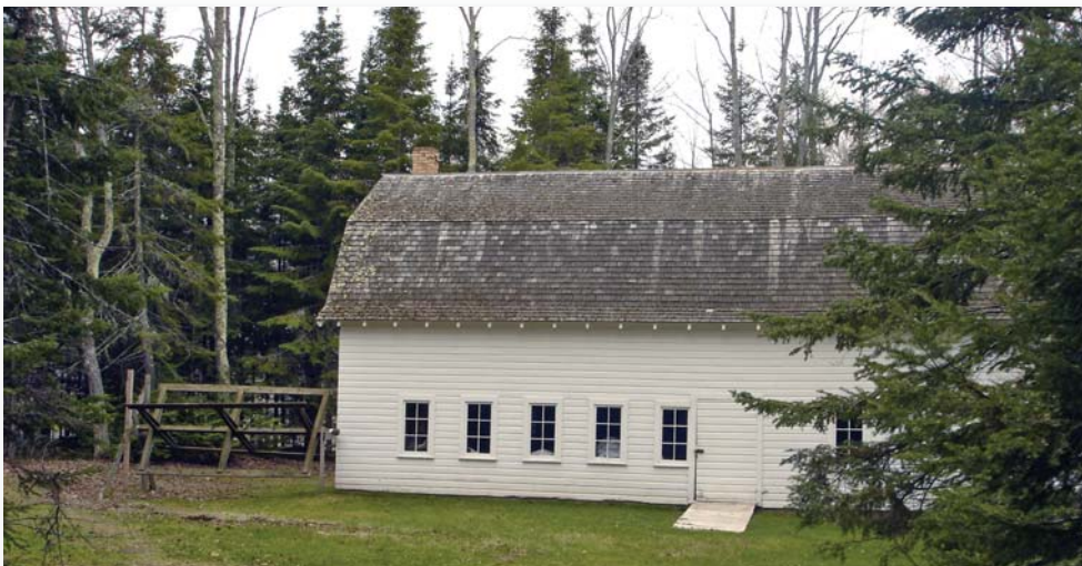
Hokenson Brothers Fishery

Meyers Beach has recently become a popular day use area. In the summer visitors walk along the beach, picnic, swim, and launch kayaks.