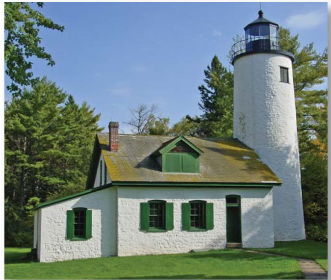
Old Michigan Lighthouse

Apostle Island National Lakeshore's six light stations were established between 1856 and 1891 to aid navigation through this portion of Lake Superior. They represent the largest and most diverse collection of light stations in the United States and are collectively listed in the National Register of Historic Places. The light stations are the most visible historic resources in the park, and they are viewed by many as icons inextricably linked to the region's cultural history. Cultural landscape features associated with the light stations (e.g., keeper's quarters, outbuildings, walkways, gardens, and historic archaeological remains) contribute to the overall understanding and appreciation of light station activities and operations during the latter half of the 19th century and the first half of the 20th century. The light stations continue to function as vital navigational aids, demonstrat-