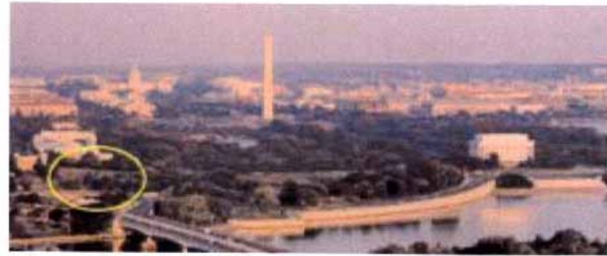
Location of USIP headquarter's site.