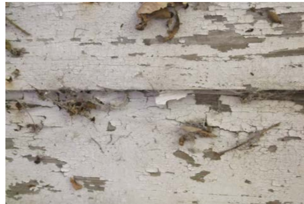
Caretaker's Cottage Exterior White Paint