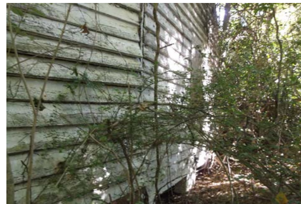
Caretaker's Cottage East Wall