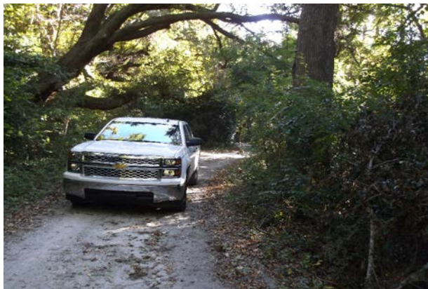
Access to Caretaker's Cottage (looking West)