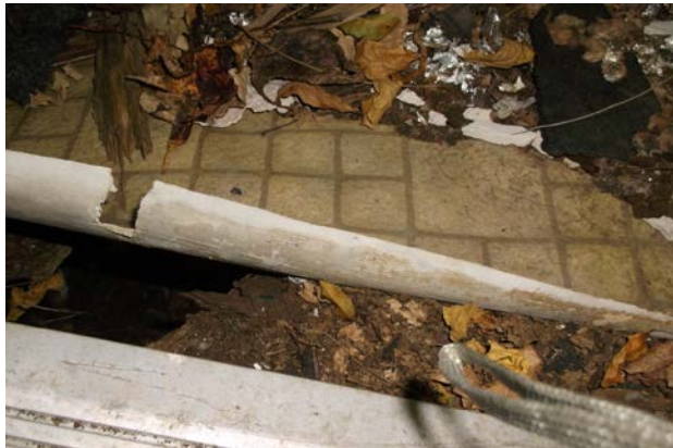
Caretaker's Cottage Sheet Flooring in Kitchen