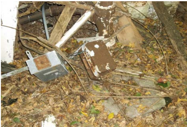
Caretaker's Cottage Sewer Pipe