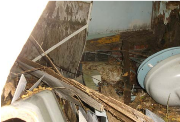
Caretaker's Cottage Bathroom - Toilet