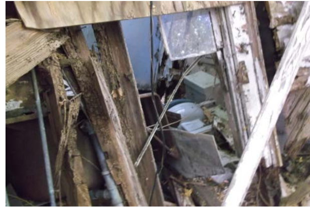
Caretaker's Cottage Bathroom