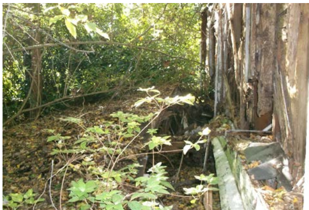
Caretaker's Cottage North Wall