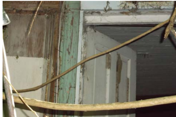
Caretaker's Cottage Interior Green Trim