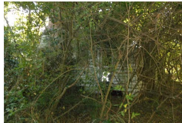
Caretaker's Cottage looking Southeast