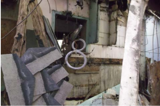
Caretaker's Cottage Kitchen Lamps