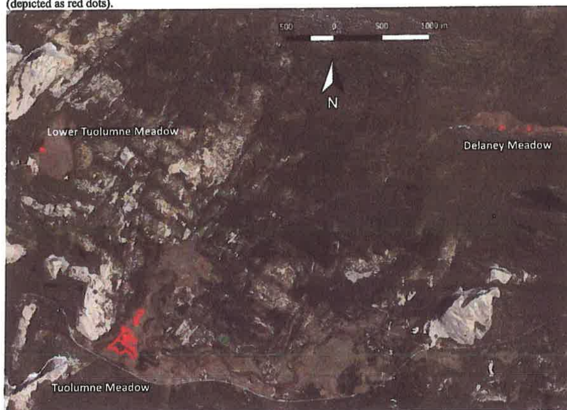
Figure 1. Overview map of proposed study area (polygons delineated by red lines) and reference meadow plots (depicted as red dots).