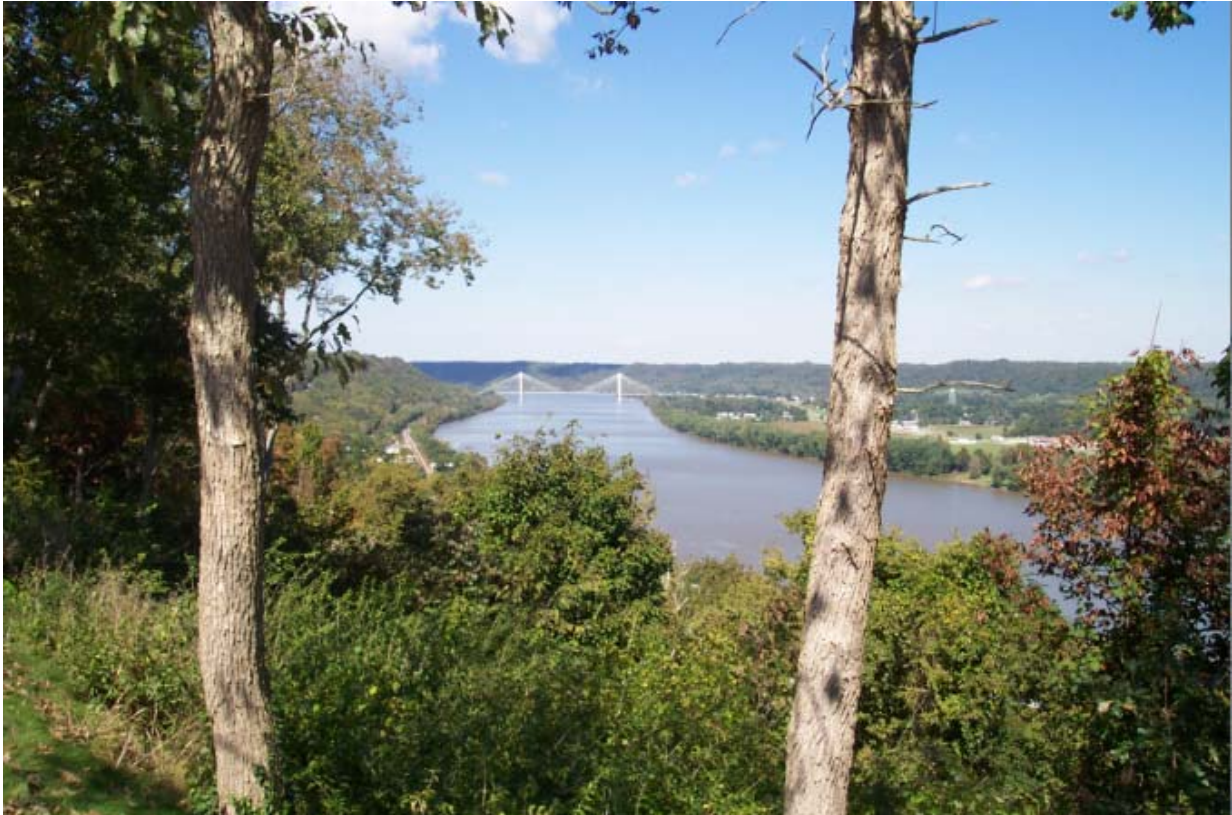
Photo of Ohio River from Maysville, Kentucky

presented by the NPS Midwest Region and Washington Office Park Planning and Special Studies Division to the National Park System Advisory Board Landmarks Committee, November 2015, and National Park System Advisory Board, June 2016