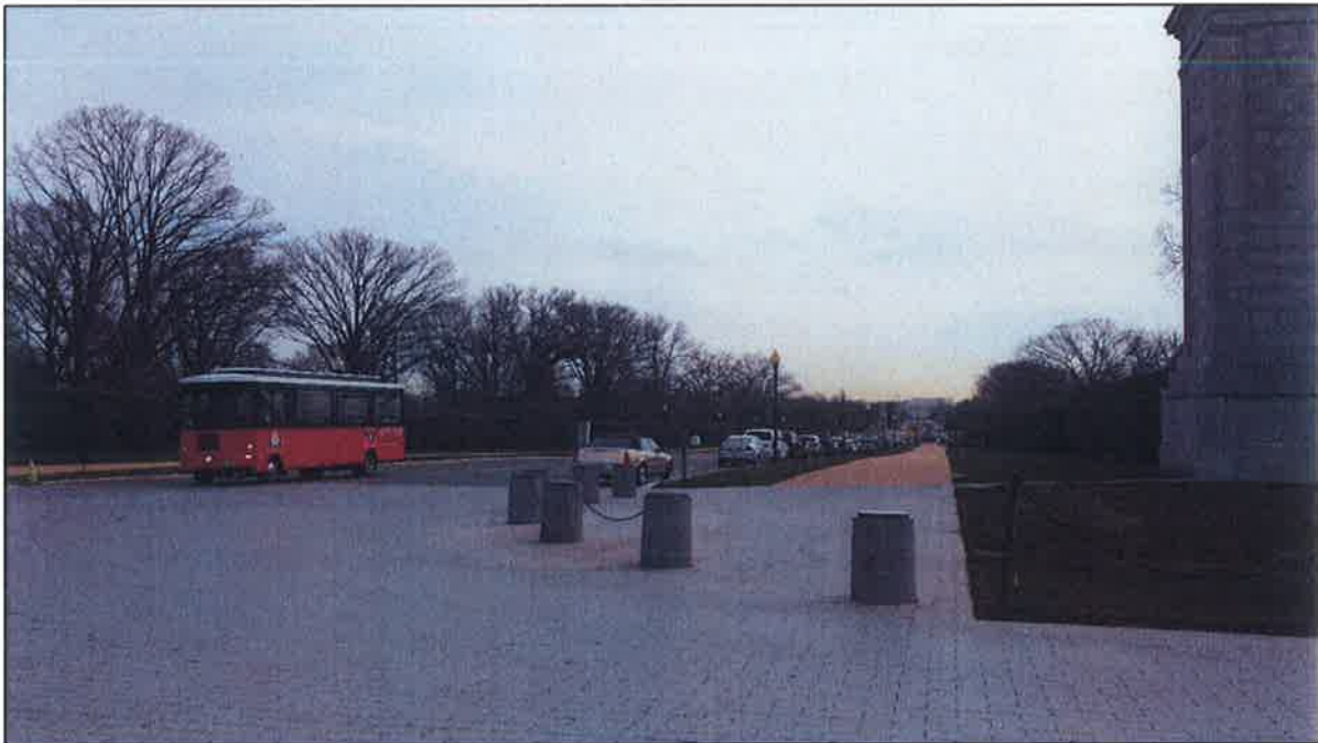
Figure 3: View towards the Kennedy Center looking northeast from the Arlington Memorial Cemetery Hemicycle within the Arlington National Cemetery Historic District. The proposed project area would not be visible from the hemicycle.