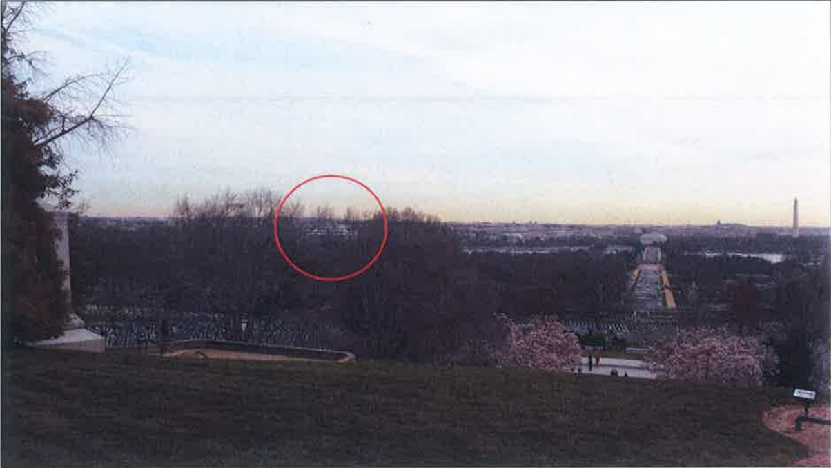
Figure 2: View towards the Kennedy Center (circled in red) looking northeast from the Arlington House, The Robert E. Lee Monument, within the Arlington National Cemetery Historic District. Due to sightlines and distances, the proposed project area along the Rock Creek and Potomac Parkway would not be visible from the Arlington House.