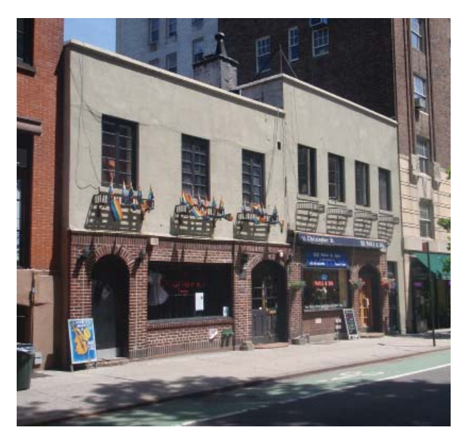
The Stonewall Inn

The structures known as the Stonewall Inn were constructed in 1843 (51 Christopher Street) and 1846 (53 Christopher Street) as two separate stable buildings. In 1914, 53 Christopher Street was rehabilitated for use as a bakery on the first floor and apartment space on the second floor. Then, in 1930, 51 Christopher Street was rehabilitated in the same manner and the first floor was connected to 53 Christopher Street to create one large commercial space. The structures were also given a unifying façade consisting of a brick-clad ground level and stucco second level. In 1934, the ground level of the structures was leased