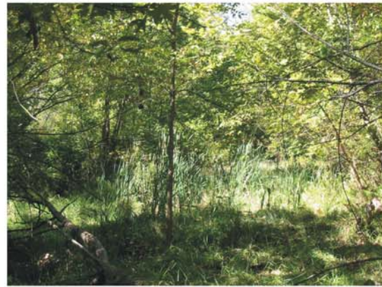
Project Site (Tract 102-114)