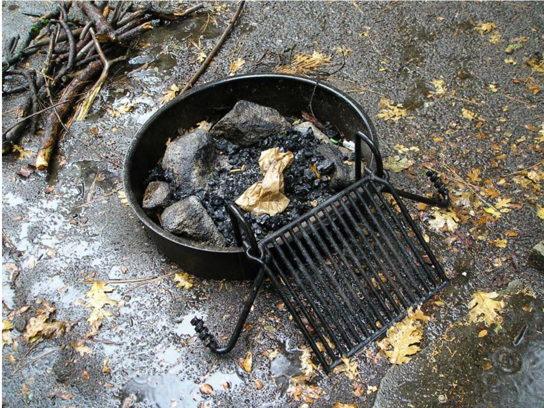
Photo 2 Existing Metal type Fire-Ring with grill