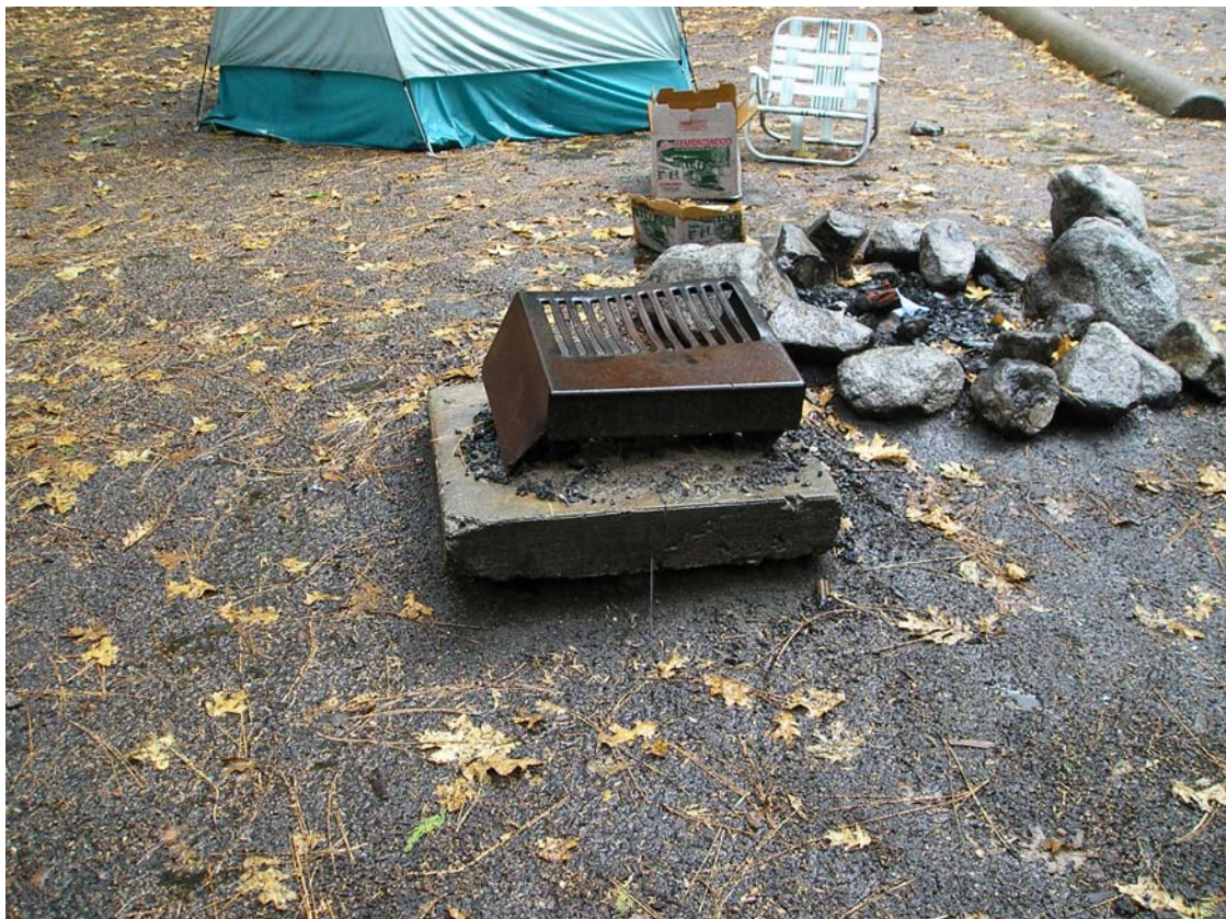
Photo 3 Old Metal and Native Rock Type Fire-Rings