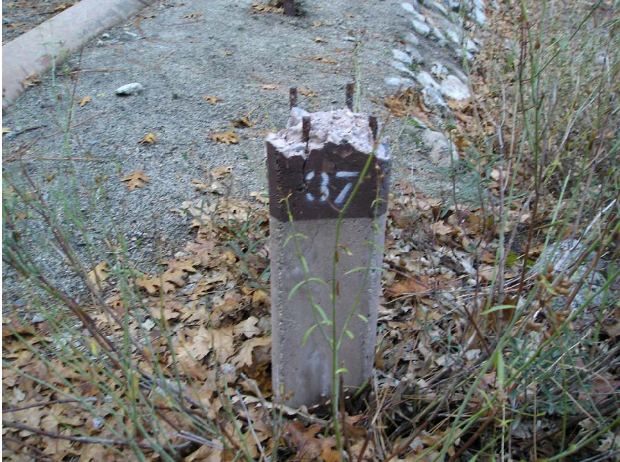
Photo 1 Damaged Site Marker