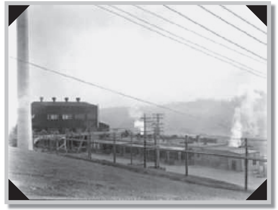
X-10 reactor building in Oak Ridge, Tennessee

examine various means of ensuring long term preservation and public appreciation of theses sites. The study will result in final recommendations to Congress concerning the future preservation of the sites and opportunities for public understanding.