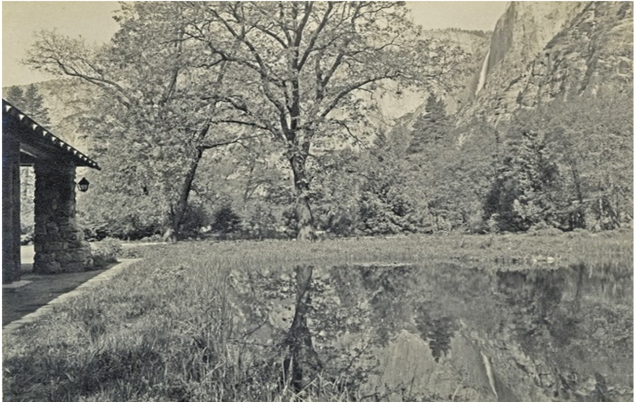
Historic Photo of the Ahwahnee Pond