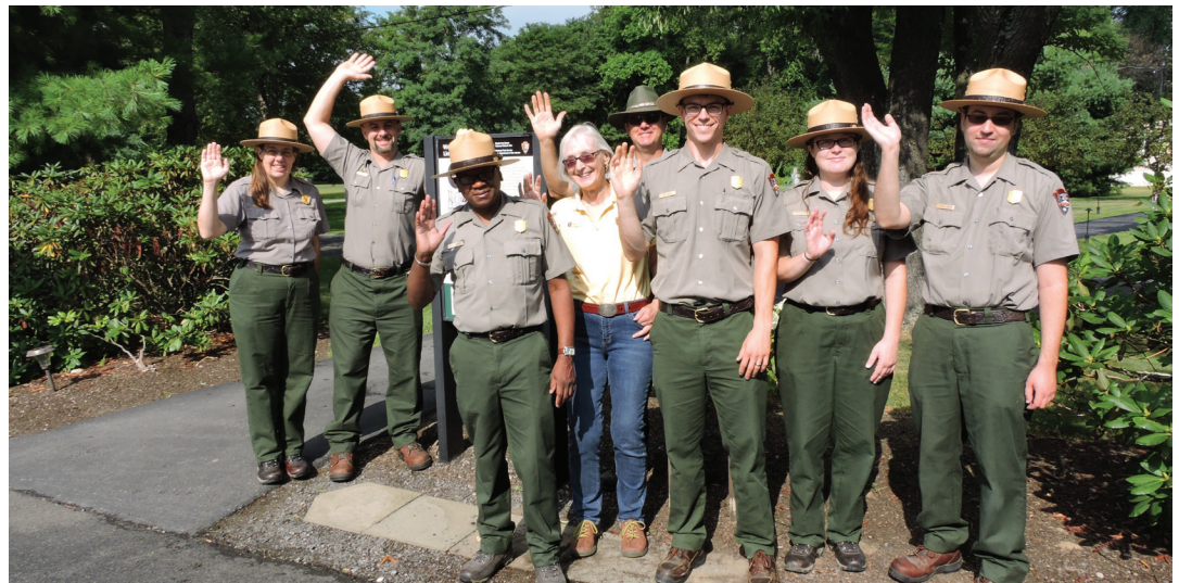
The dedicated staff at Martin Van Buren National Historic Site.

at 1 North Front Street in Hudson, NY and the second on August 27th, from 6-7:30 pm at the Martin H. Glynn Municipal Building at 3203 Church Street in Valatie, NY. A presentation on the contents of the General Management Plan will be made, and comments and questions from the public will be solicited.