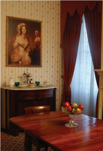
Breakfast Room in the Lindenwald Mansion.

The Martin Van Buren GMP/EA will be available for public review and comment online at the National Park Service's Planning, Environment, and Public Comment website, which is at http://parkplanning.nps.gov . The final day to provide your input is October 5, 2015.