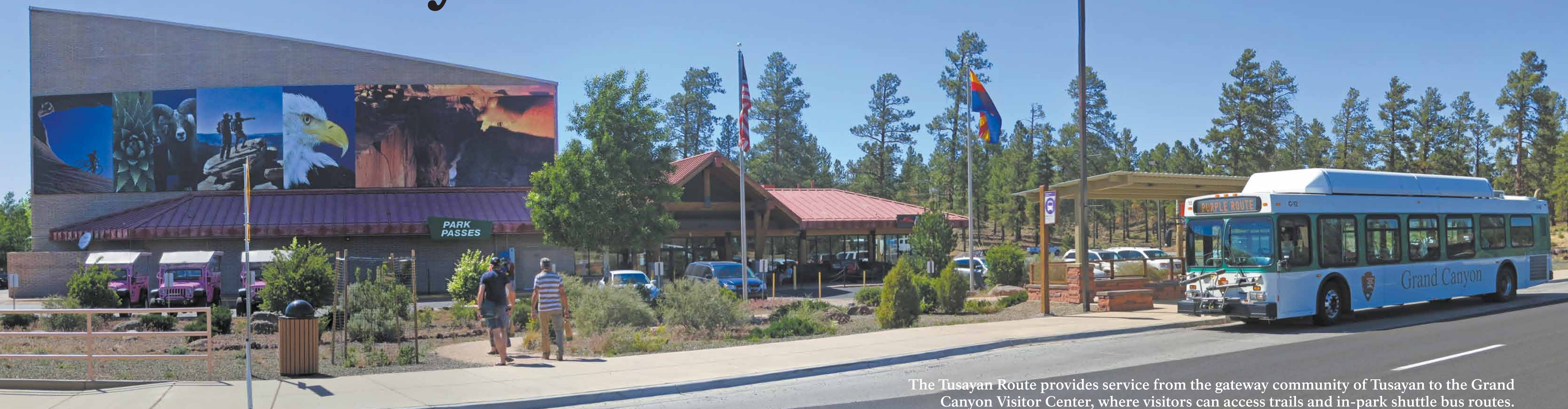
The Tusayan Route provides service from the gateway community of Tusayan to the Grand Canyon Visitor Center, where visitors can access trails and in-park shuttle bus routes.

Grand Canyon National Park's transit system provides a critical component for an enjoyable visitor experience. Completion of the Greenway and Rim trails in recent years make it possible to walk or bicycle 13 miles (21 km) between the South Kaibab Trailhead and Hermit's Rest. Visitors encounter a shuttle bus stop every one-half to one mile (0.8–1.6 km). This enables them to walk or bicycle one way and ride the shuttle bus back to their point of origin.