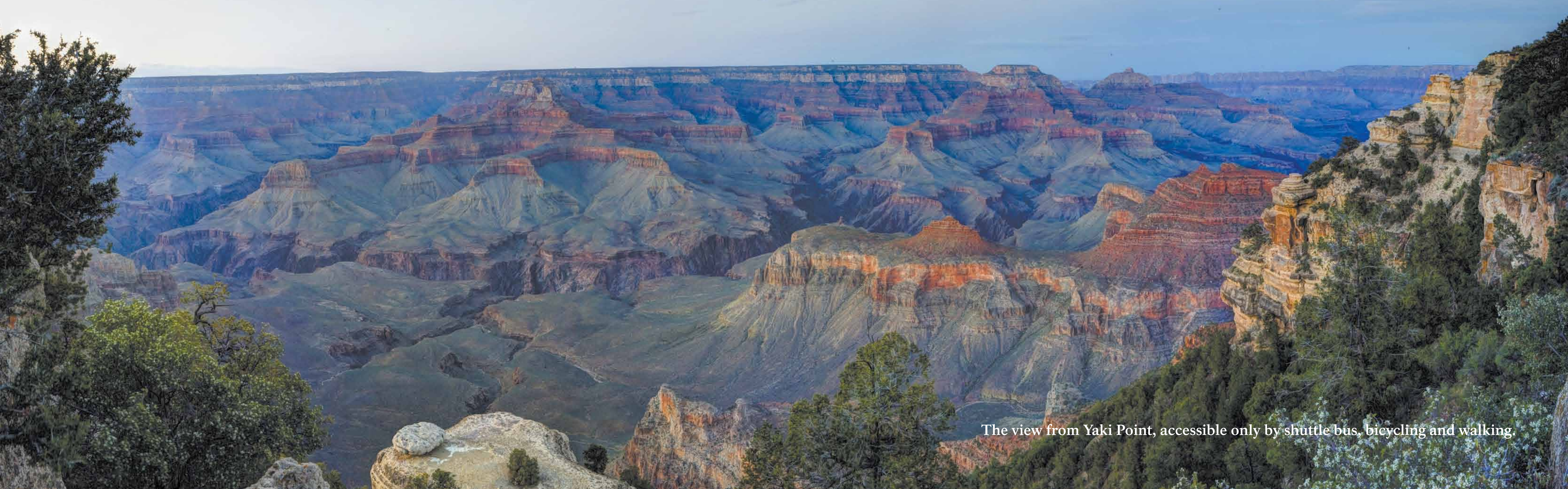
The view from Yaki Point, accessible only by shuttle bus, bicycling and walking.