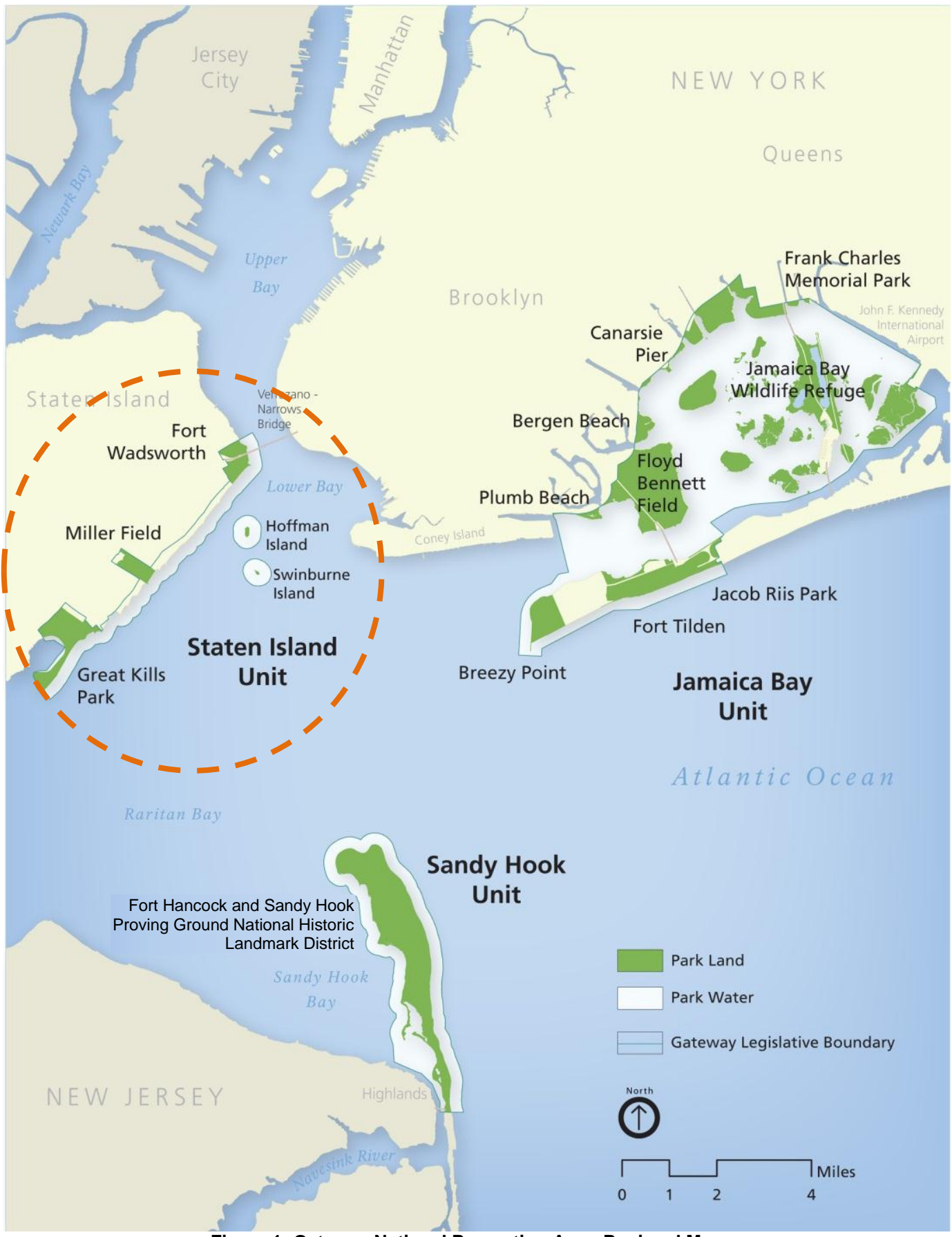
Figure 1: Gateway National Recreation Area, Regional Map