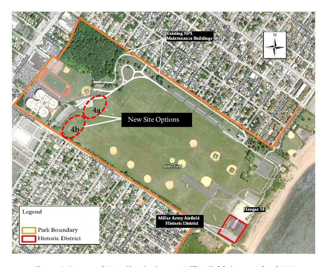
Figure 4: Proposed New Site Options at Miller Field, Staten Island, NY