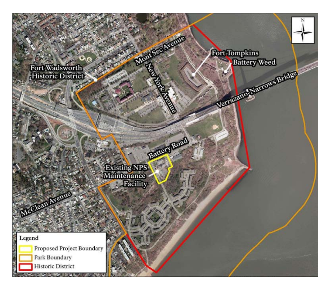
Figure 3: Proposed Project Boundaries at Fort Wadsworth, Staten Island, NY