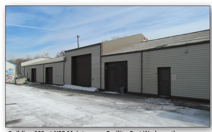
Building 303 at NPS Maintenance Facility, Fort Wadsworth