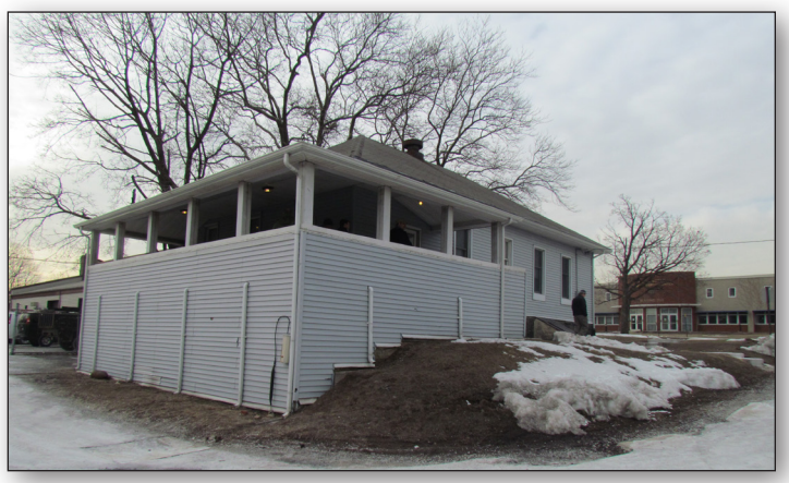
Building 305 at NPS Maintenance Facility, Fort Wadsworth