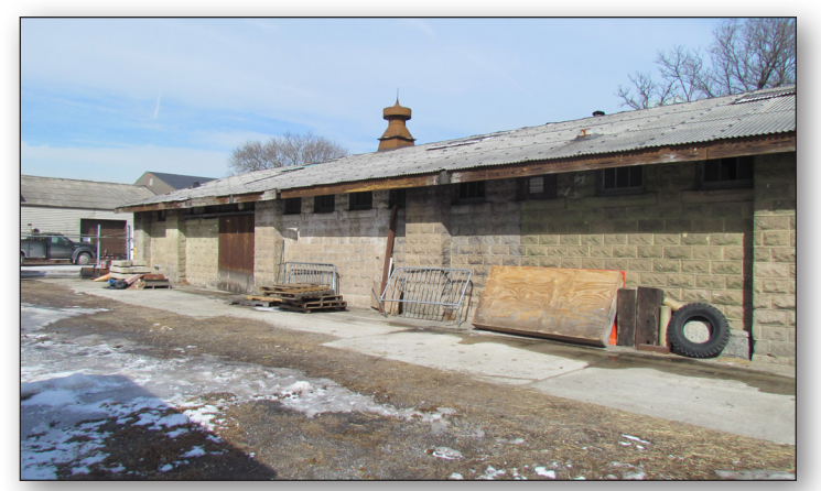
Building 309 at NPS Maintenance Facility, Fort Wadsworth