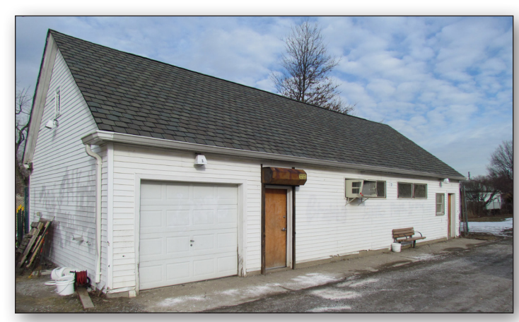
Building 3 at Miller Field