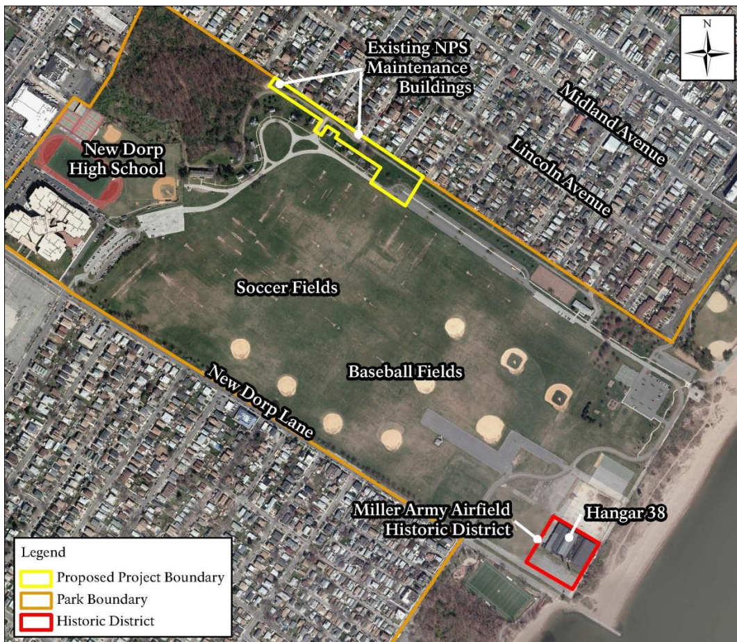
Figure 4: Proposed project boundaries (outlined in yellow) at Miller Field, Staten Island, NY