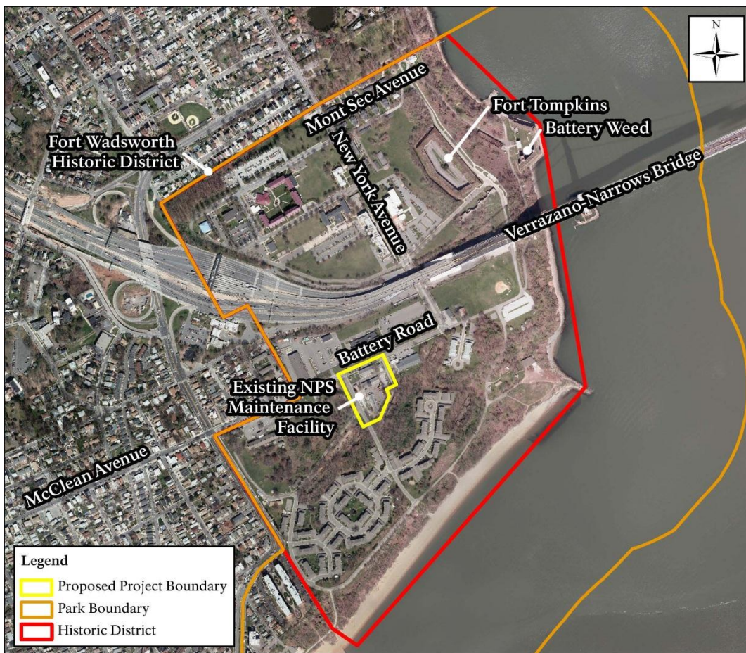
Figure 3: Proposed project boundaries (outlined in yellow) at Fort Wadsworth, Staten Island, NY