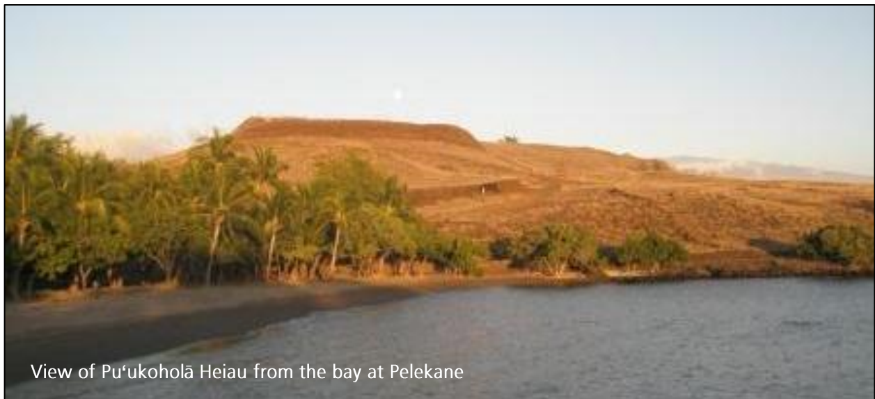
View of Pu'ukoholā Heiau from the bay at Pelekane

In addition to preserving the remains of Pu'ukoholā Heiau, the park protects other sites of historic significance, including Mailekini Heiau, a luakini and/or an agricultural Heiau which was eventually converted to a military fort; the ruins of Hale o Kapuni Heiau, a temple dedicated to sharks which are believed to be ancestral 'aumakua (family guardians); the Royal Court, or Pelekane, site of numerous diplomatic meetings between Kamehameha and foreign visitors; and John Young's homestead, believed to contain the remains of the first Western-style house in Hawai'i.