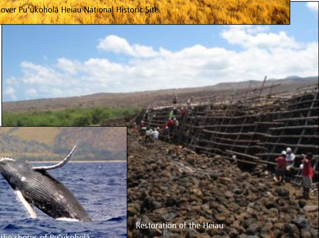
Restoration of the Heiau