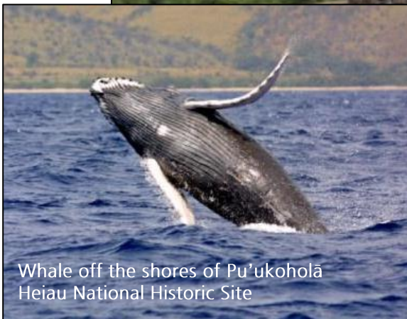
Whale off the shores of Pu'ukoholā Heiau National Historic Site