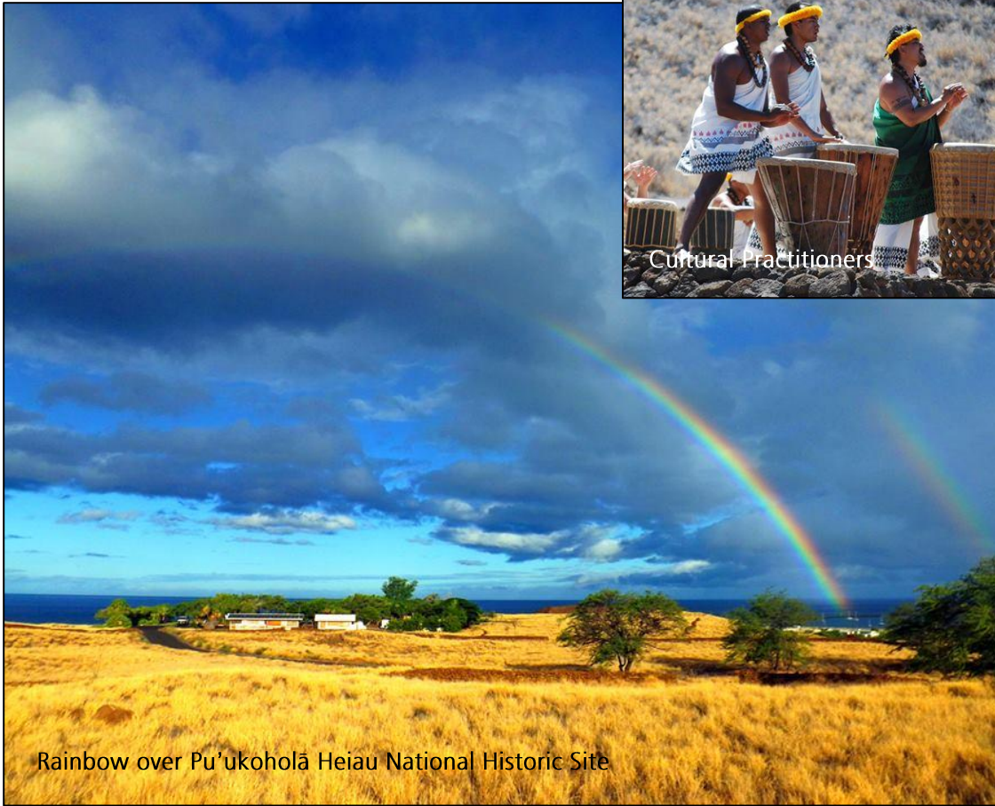
Rainbow over Pu'ukoholā Heiau National Historic Site