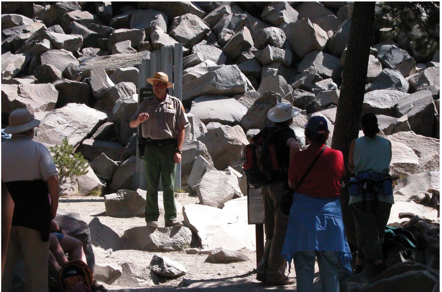
Ranger talk at the Postpile

Alternative A is the “no action” alternative and assumes that existing management, programming, facilities, staffing, and funding would generally continue at their current levels. A no action alternative is required by the National Environmental Policy Act and serves as a baseline for comparison in evaluating the changes and