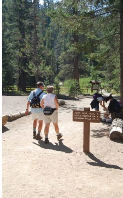
Trailhead at the Ranger Station, NPS Photo

The recommendations were formulated to complement proposed actions in the monument, provide an integrated valley-wide visitor experience, and increase efficiencies between the two agencies. Under the MOU, the recommendations are not part of the GMP alternatives