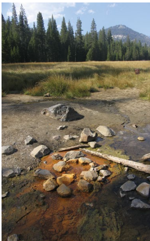
Soda Springs

The potential effects of the three alternatives are analyzed for impacts in accordance with the National Environmental Policy Act. This analysis is the basis for comparing the advantages and disadvantages of the alternatives. Chapter Five: Environmental Consequences of the Draft GMP/EA provides detailed analysis of impacts related to natural and cultural resources, wilderness character, visitor opportunities, the socioeconomic environment, and monument operations.