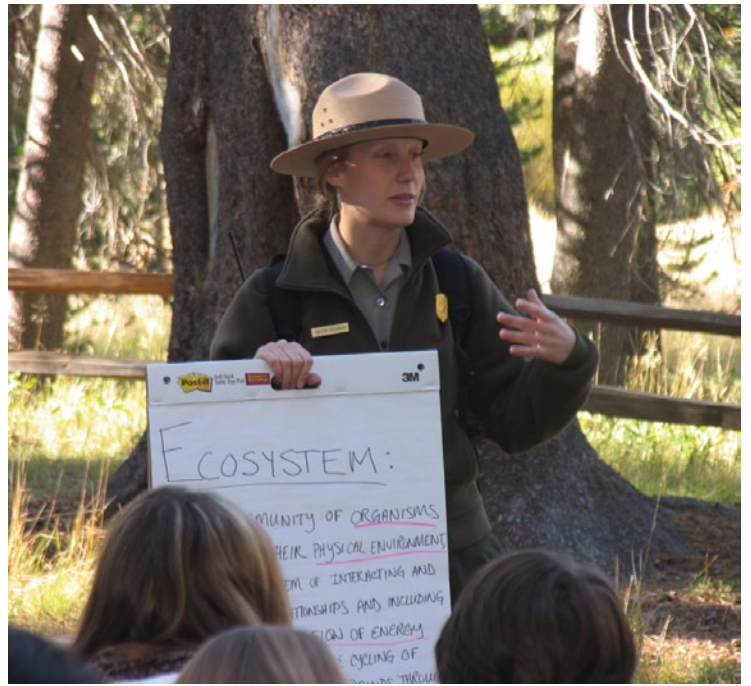
Ranger program