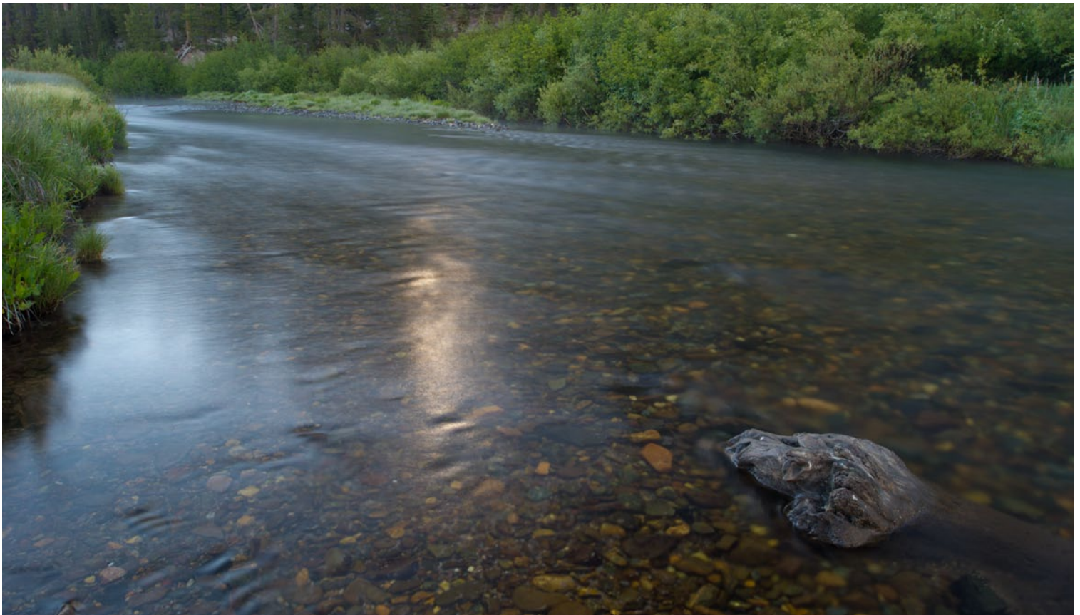
Middle Fork of the San Joaquin River, © Rod Planck

The GMP will be a National Park Service decision document. Its management guidance will only govern future actions taken by the NPS. However, through this planning process additional recommendations were developed by the GMP team, with participation by USFS staff, for the surrounding watershed within the Inyo National Forest. The USFS could undertake any or all of the recommendations individually or by integration into planning on the Inyo National Forest. These recommendations were provided in an effort to identify opportunities for interagency efficiency, improve visitor services, and establish a vision for collaborative management of