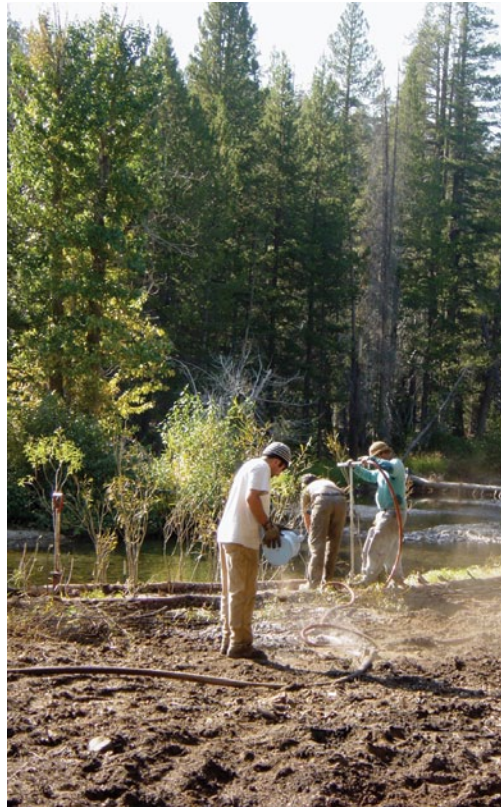
Restoration work

The monument would continue to co-locate administrative offices in their current location at the USFS