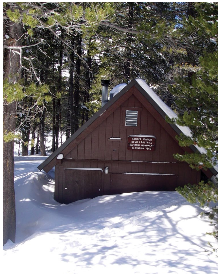
Ranger Station in winter

The monument operations area would provide staff housing, administrative space, and other essential operational functions with an overall goal of minimizing visual and audible impacts associated with park operations. To the extent possible, staff housing would be provided in the Town of Mammoth Lakes; however, a minimum overnight staff presence would still be maintained in the operations area. Maintenance functions would be moved to a different location to reduce the impacts on visitor experience and resident staff. With a goal of increasing operational efficiency and collaboration between the agencies, the NPS would partner with the USFS to explore replacement of the monument's current deficient maintenance shop with a small interagency, multi-purpose facility outside of the monument, potentially in the vicinity of the Pumice Flat or other locations provided those areas are relatively level, outside of the