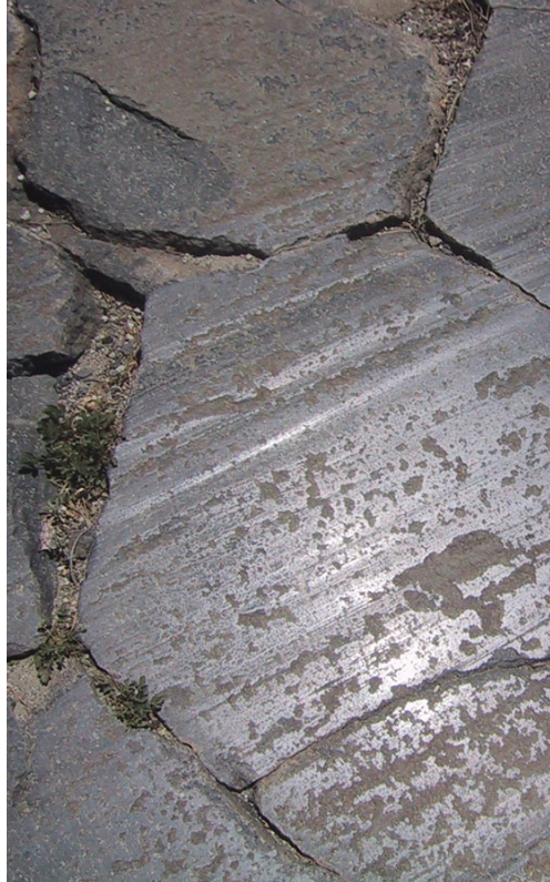
Glacial polish on Postpile columns

The monument operations area would provide staff housing, administrative space, and other essential operational functions with an overall goal of minimizing visual and audible impacts associated with park operations. Buildings near the edge of the meadow would be removed to protect the meadow within the riparian area and reduce visual impacts from the Devils Postpile trail. Other cabins would be converted from housing to operational functions, replacing the operational functions once located in the ranger station.