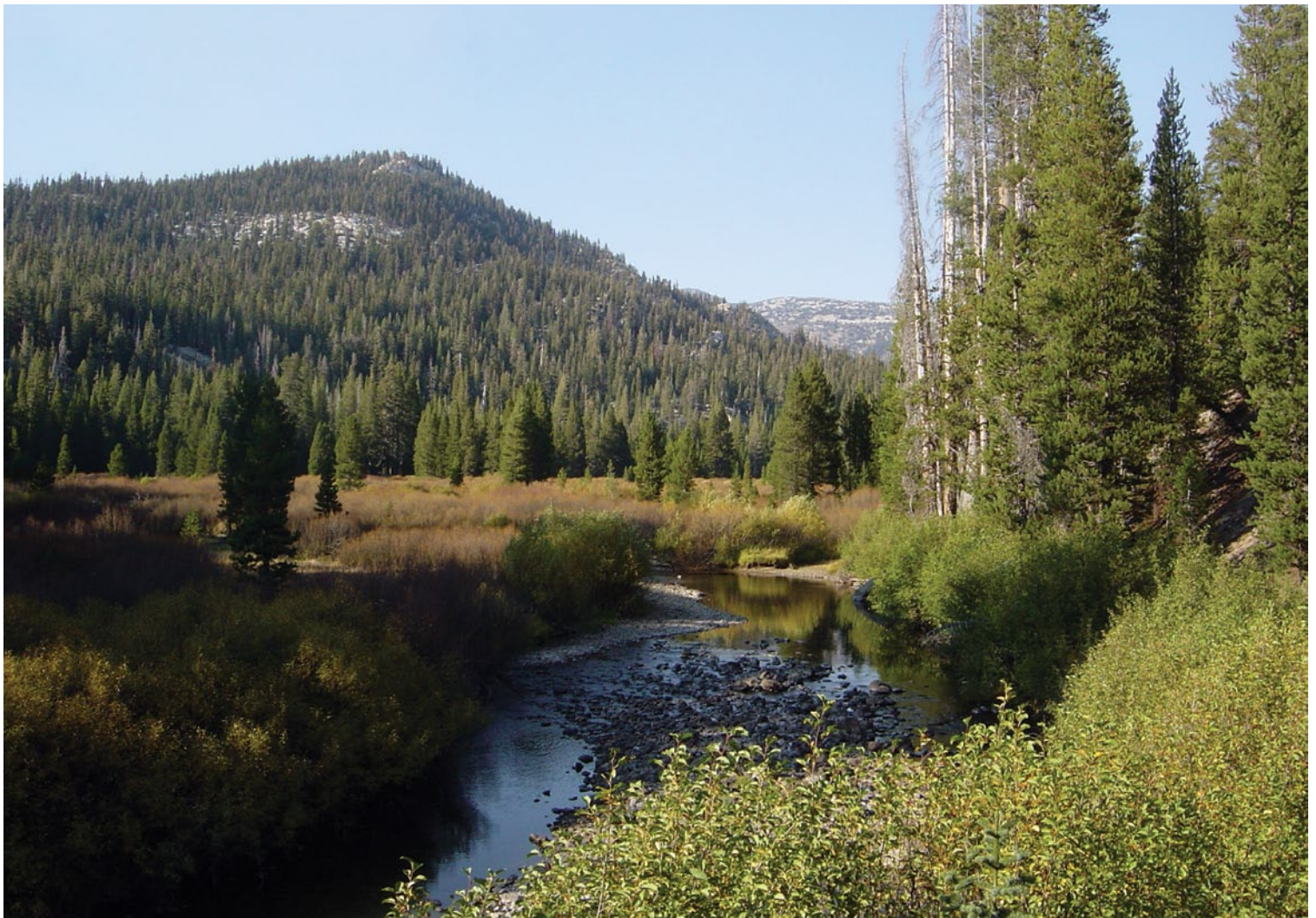
Middle Fork of the San Joaquin River in the fall