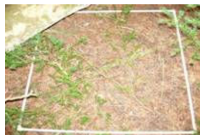
Heavily browsed Canada yew

Canada yew ( Taxus canadensis ) is an evergreen shrub that is highly preferred by deer for food. This “deer candy” will be eaten before such other deer favorites as cedar and hemlock. Yew is nearly impossible to find on the mainland where deer have eaten virtually every plant. Rocky Island, and several other Apostle Islands, quickly lost their stands of Canada yew when deer numbers exploded in the 1950's. Even though deer numbers on these islands have dramatically declined, recovery of the yew has been very limited and slow.