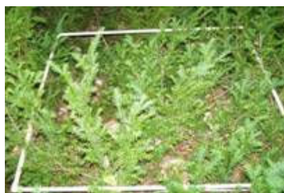
Healthy Canada yew