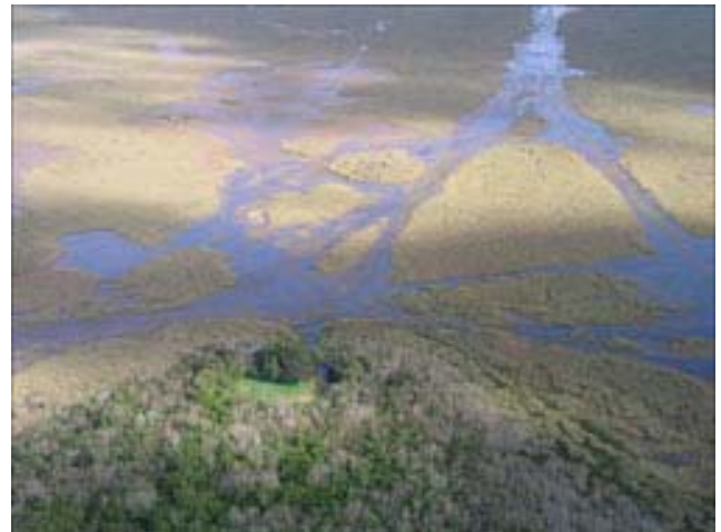
Airboat trails and an often-visited tree island in the East Everglades Expansion Area

If public or agency concerns arise, additional resources may be evaluated.