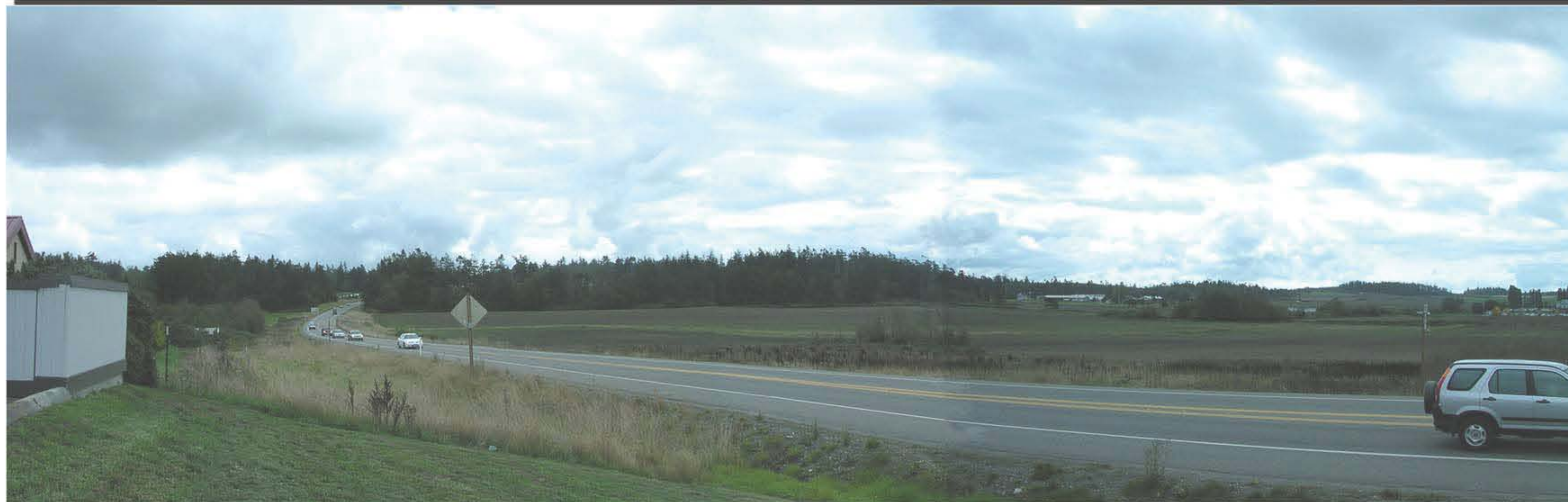
Existing views over agricultural field within the Reserve.