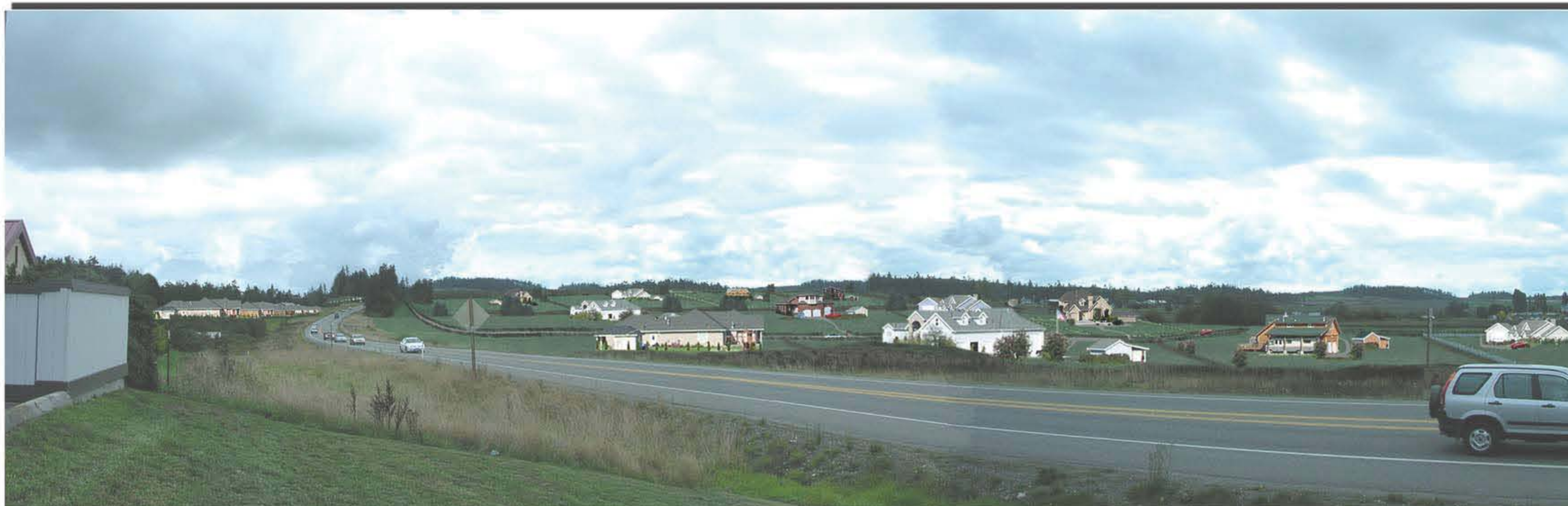
Photo of the same area within the Reserve, but illustrating an example of potential building development in Rural (5-acre) Zoning District, using existing county regulations.