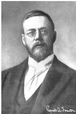
Reginald Fessenden, pioneer of wireless communication.

Roanoke Island. The natural systems and processes of Roanoke Island, such as the “mother vine” from which the island’s culture and stories grew, greatly impacted human success or failure here.