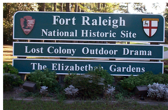
Secretarial Order of April 5, 1941, established Fort Raleigh National Historic Site to preserve land declared to be of national significance.

The State of North Carolina deeded Fort Raleigh State Park on the north end of Roanoke Island to the United States on July 14, 1939, contingent upon its approval by Assistant Secretary of the Interior Oscar L. Chapman. The Secretarial Order of April 5, 1941, established Fort Raleigh National Historic Site to preserve land declared to be of national significance as a portion of the colonial settlement or settlements established in America by Sir Walter Raleigh between 1587 and 1591. The Order also recognized the agreement made between the Roanoke Island Historical Association and the United States for the annual presentation of Paul Green’s symphonic drama, The Lost Colony , in the open-air amphitheater at the national historic site.