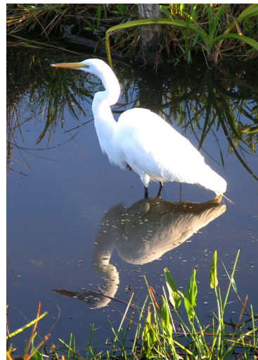
Great Egret ( Casmerodius albus )