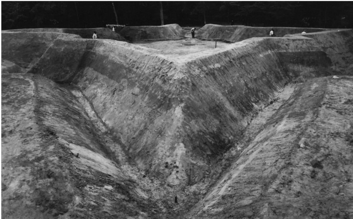
Archeological excavation at the earthwork fort (1950)