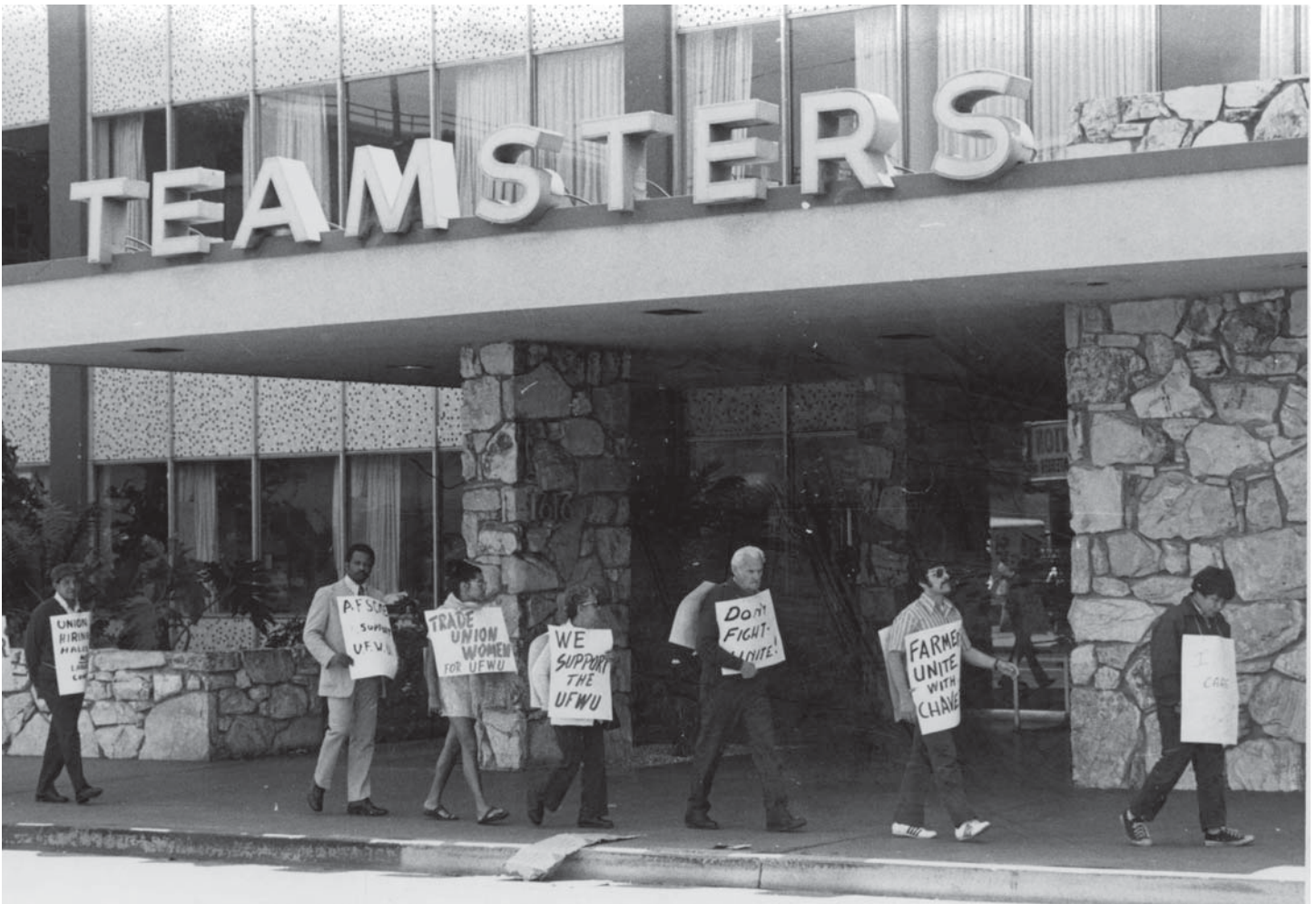
A demonstration against Teamster involvement with farm workers in front of Teamster headquarters, Los Angeles, California. Picketers carry signs that read "Don't Fight Unite" and "We Support the UFWU."