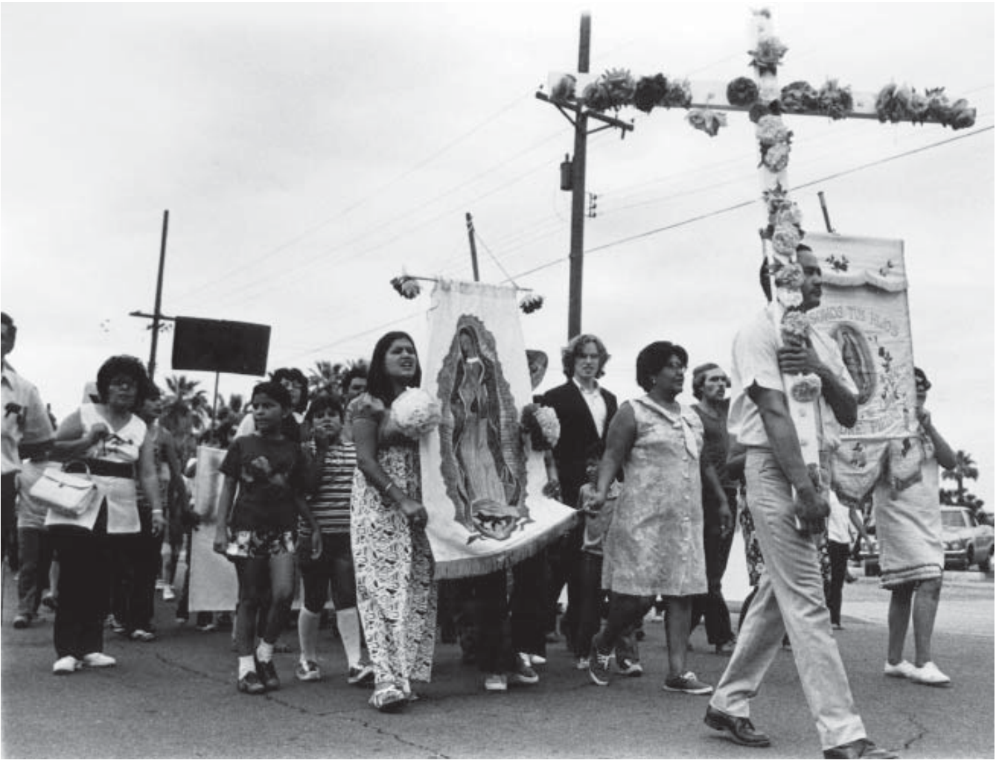
Supporters of the UFW march through the streets of Phoenix carrying signs, crucifixes, and banners with Our Lady of Guadalupe on them to the mass that ended Cesar Chavez's 24-day "Fast for Justice", which took place at the Santa Rita Center. Joseph Kennedy III is shown in center, next to the banner of Our Lady of Guadalupe. Chavez decided to end the fast on June 4, the two-year anniversary of Robert Kennedy's assassination. As many as five thousand farm workers arrived at a Phoenix hotel for a memorial Mass in Kennedy's honor, a brief statement from Chavez, and a rally.