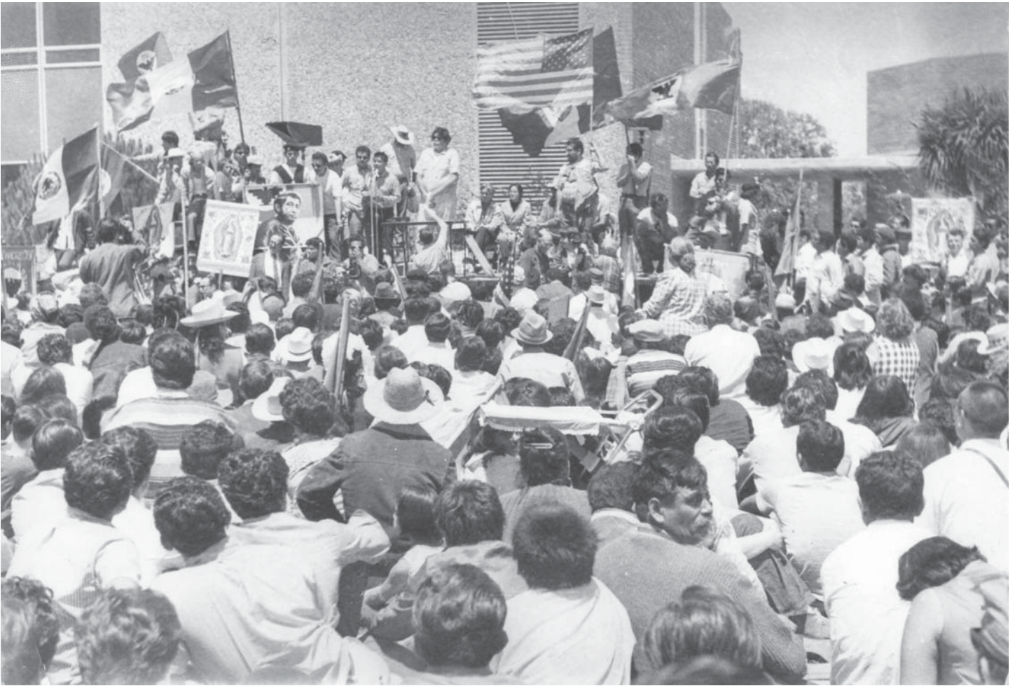
Cesar Chavez speaks to striking United Farm Workers (UFW) members, Salinas, California.