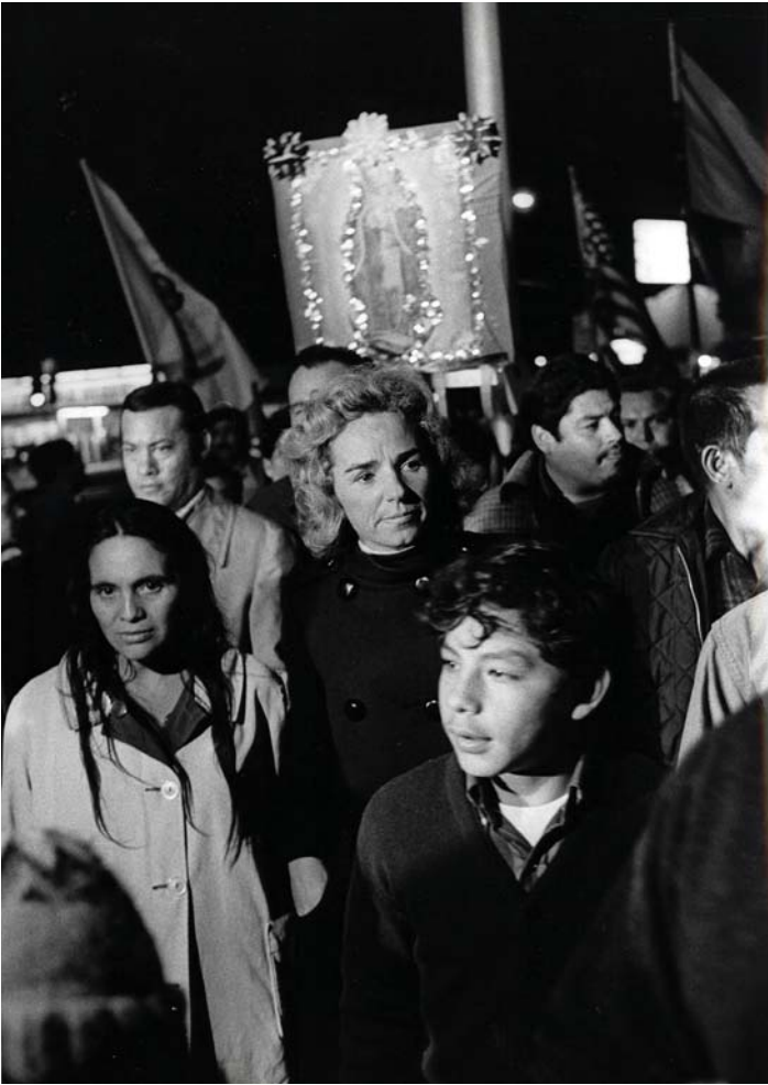
Ethel Kennedy (center), widow of Senator Robert Kennedy, arrives at the Monterey County jail to visit Cesar Chavez amidst the jeers of an anti-UFW mob, December 6, 1970. To her left is Dolores Huerta.