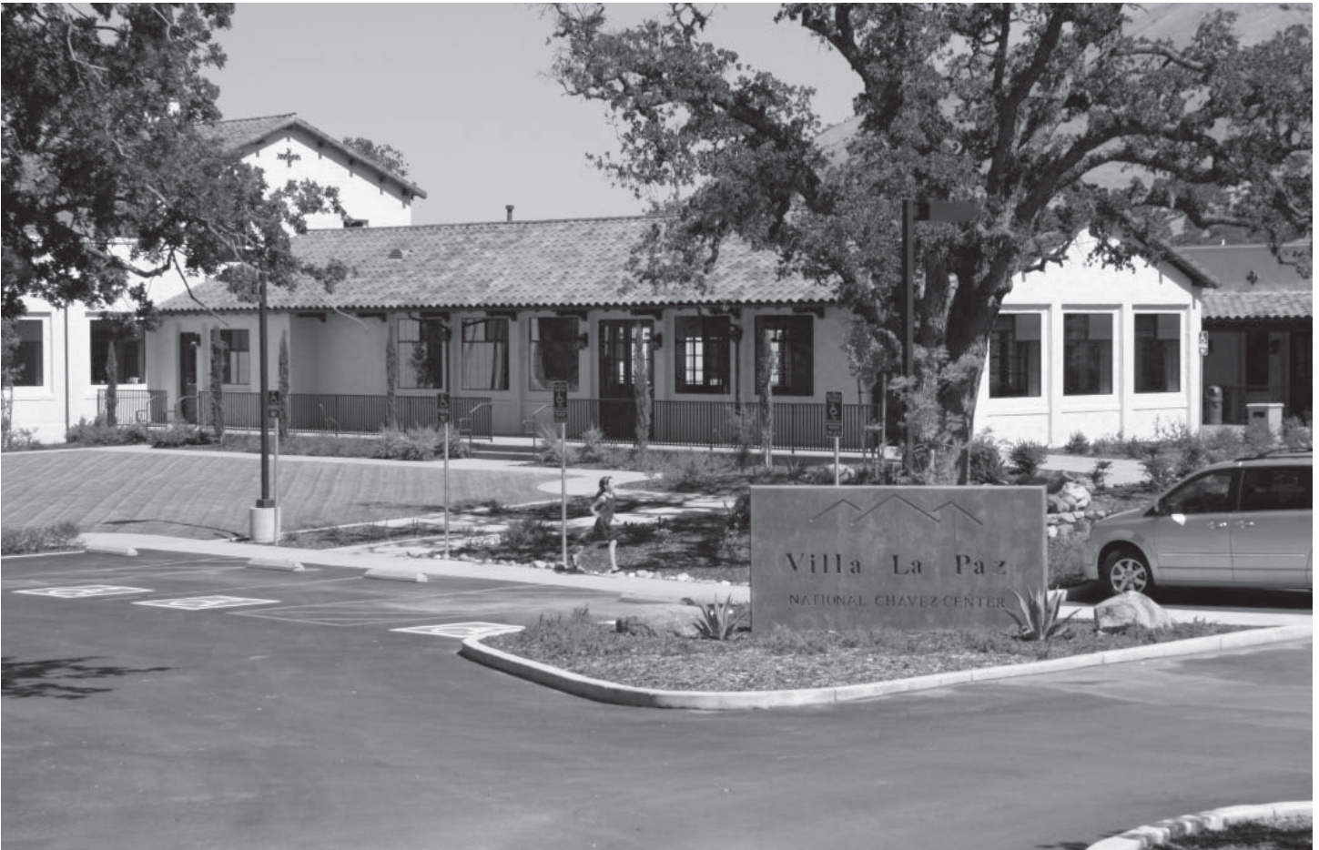
Today, the building at La Paz that housed the Fred W. Ross Farmworker Educational Center has been renovated and named “Villa La Paz” as part of the National Chavez Center. The facility is still used for training, education, meetings and capacity building.