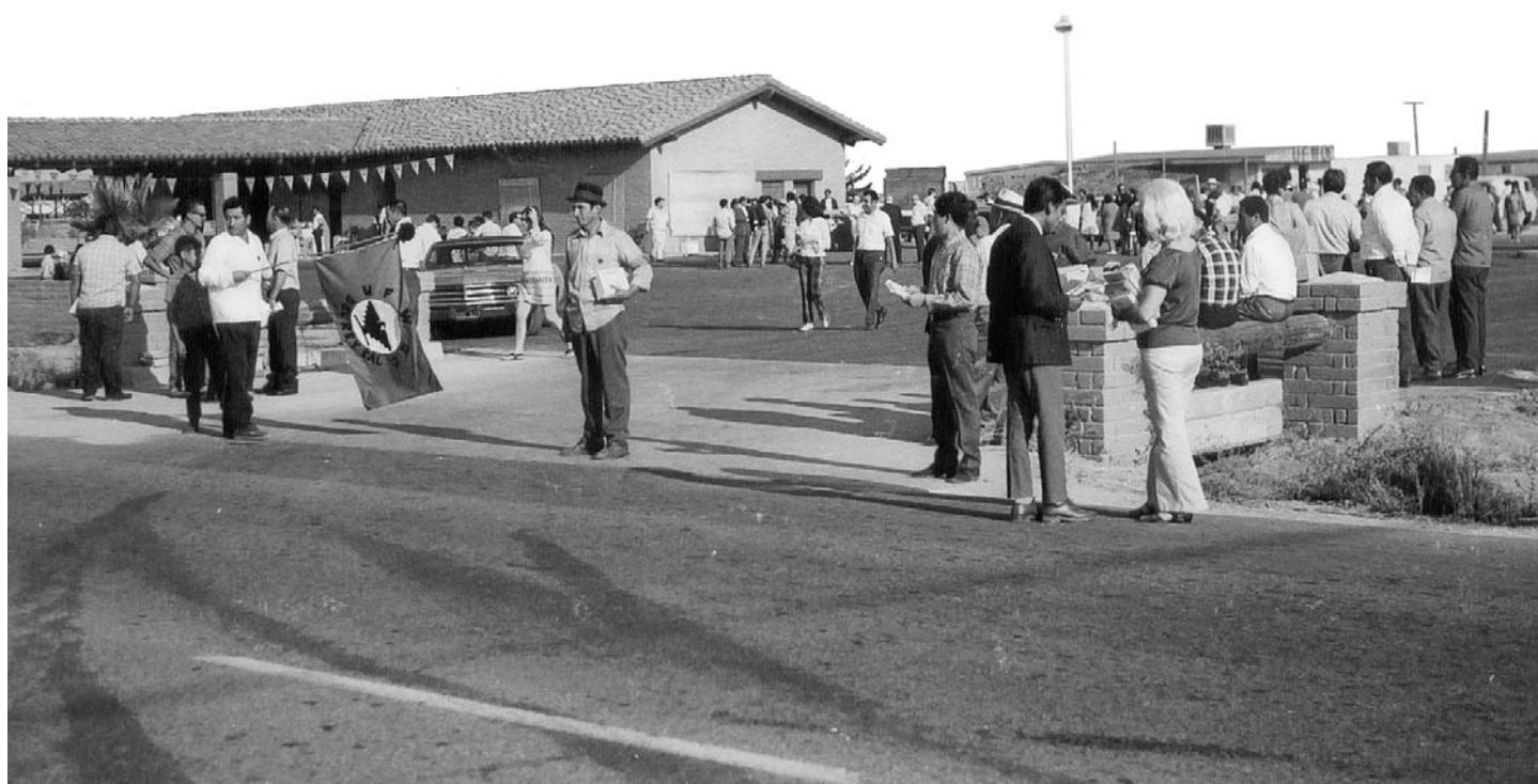
The Forty Acres in Delano, California served as the UFWOC and UFW headquarters. The service station building shown in the photo was constructed in 1968 and provided services such as gasoline and auto repair to farm workers. Eventually, the facility would grow to include a health clinic and retirement village. The Forty Acres was designated a National Historic Landmark in 2008 by the Department of the Interior. c. 1960s.