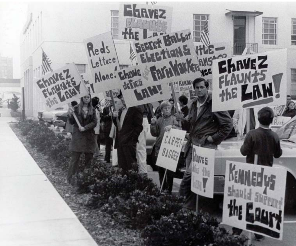
In addition to supporters of Cesar Chavez, anti-UFW protestors staged demonstrations outside of the Monterey County Jail. Photo courtesy of www.farmworkermovement.us . Photo by Hub Segur, 1970.