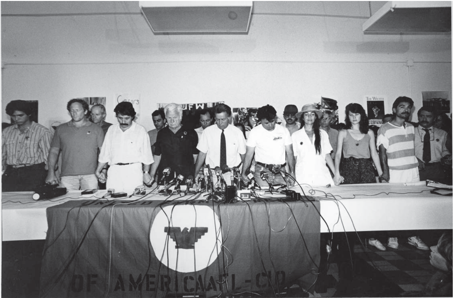
Celebrities speak at a press conference in support of Cesar Chavez's 1988 "Fast For Life"; a campaign to end the usage of pesticides and a boycott of grapes, August, 1988. Left to Right: Actors Lou Diamond Phillips, Charles Haid, Edward James Olmos, Edward Albert, Martin Sheen, Robert Blake, Julie Carmen, and an unidentified women.