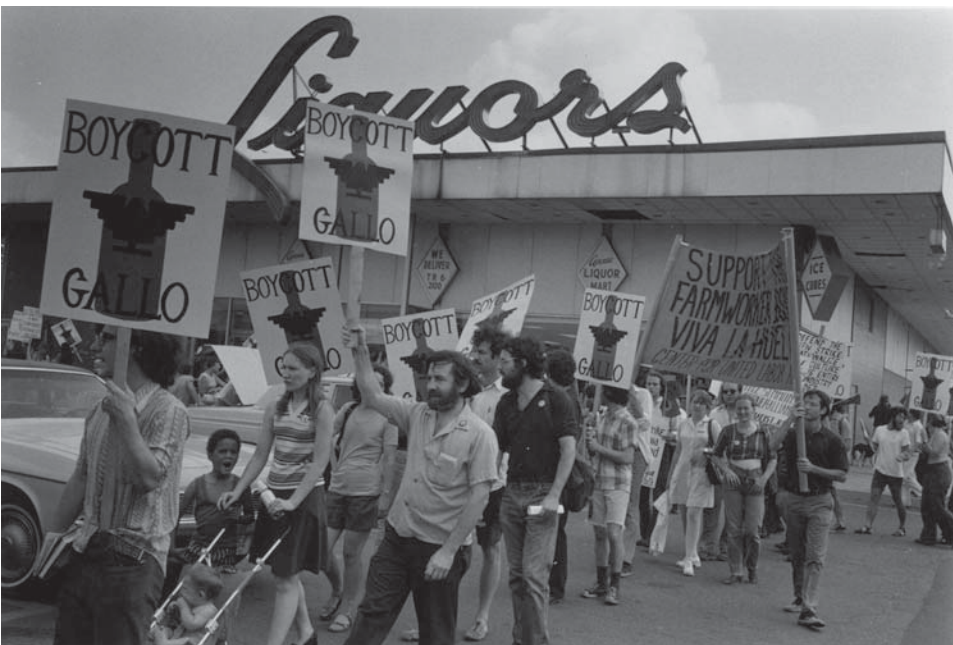
Supporters of the UFW Gallo Wine Boycott demonstrate in front of a liquor store, location unknown.