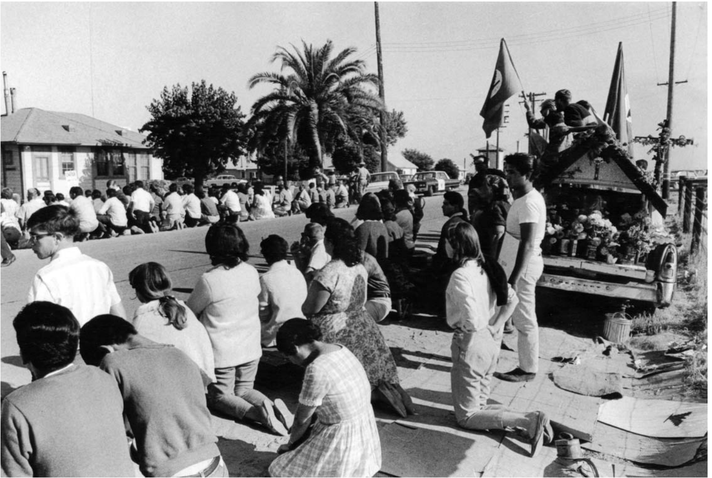
Farm workers protested outside the DiGiorgio headquarters during what were perceived as being unfair union elections during the Delano grape strike. In the face of an injunction limiting the number of picketers who could assemble, Chavez suggested that farm workers gather at the edges of Di Giorgio ranches and pray instead of picket. A shrine was added to a station wagon, seen in the photo, to support these efforts. Photo courtesy of www.farmworkermovement.us . Photo by Jon Lewis, c. 1966.