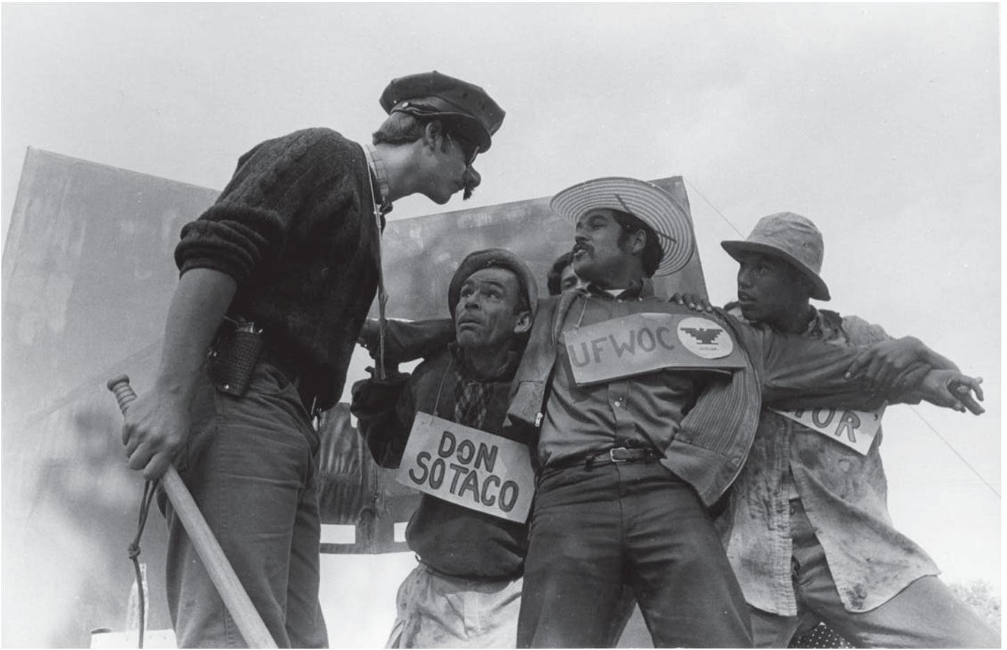
El Teatro Campesino, founded by Luis Valdez in 1965, performed skits at the Friday night meetings at the Filipino Hall, on the picket lines, and along march routes during the Delano grape strike. The skits, which featured humorous characters and dialogue, would entertain and educate audiences while dramatizing the plight and cause of the farm workers. In 1971, the company moved to San Juan Bautista, California, where they continue to present theater works to generate social change.