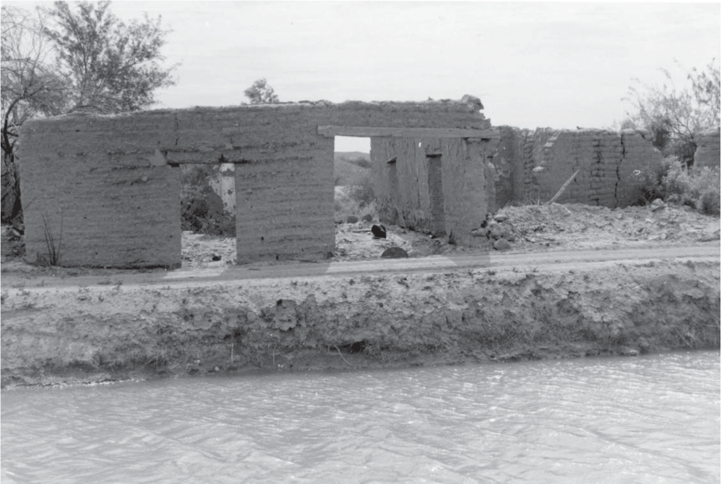
The Chavez Family Homestead site in the Gila River Valley northeast of Yuma was Cesar Chavez's childhood home. The family acquired 100 acres of land in 1909, built an adobe farmhouse and cultivated the land. Today, only remnants of the adobe walls remain.