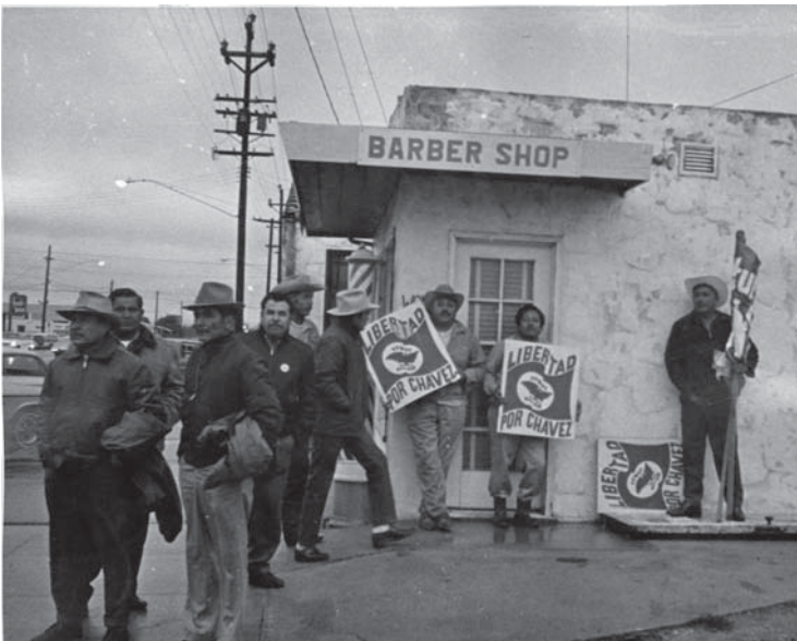
A demonstration outside of a barber shop against the arrest and imprisonment of Cesar Chavez, Salinas, California. Men hold signs that read "LIBERTAD POR CHAVEZ" (Freedom for Chavez).