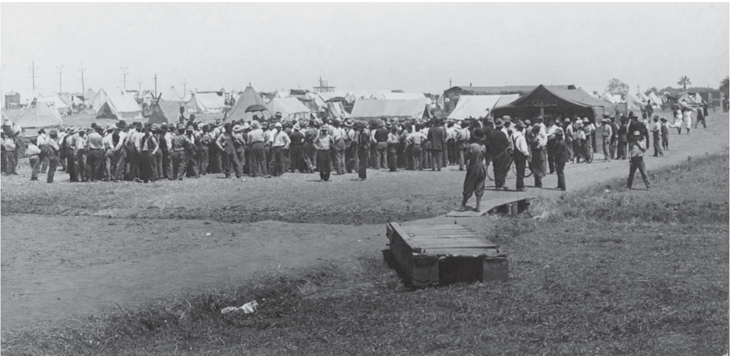
Durst Ranch hop pickers in their camp organize to strike near Wheatland, California. A bumper crop of hops at the Durst ranch and advertisements promising work to anyone who wanted it brought in close to 3000 men, women, and children to work as pickers in 1913. When the living conditions and poor wages led IWW activists to call for a strike, the ranch owners called on the sheriff to put it down. A confrontation took place on August 3, 1913 and two lawmen and two migrant workers were killed. The Wheatland Riot drew unprecedented levels of attention to the plight of agricultural laborers, led to the creation of the California Commission of Immigration and Housing, and gave the movement its first martyrs.