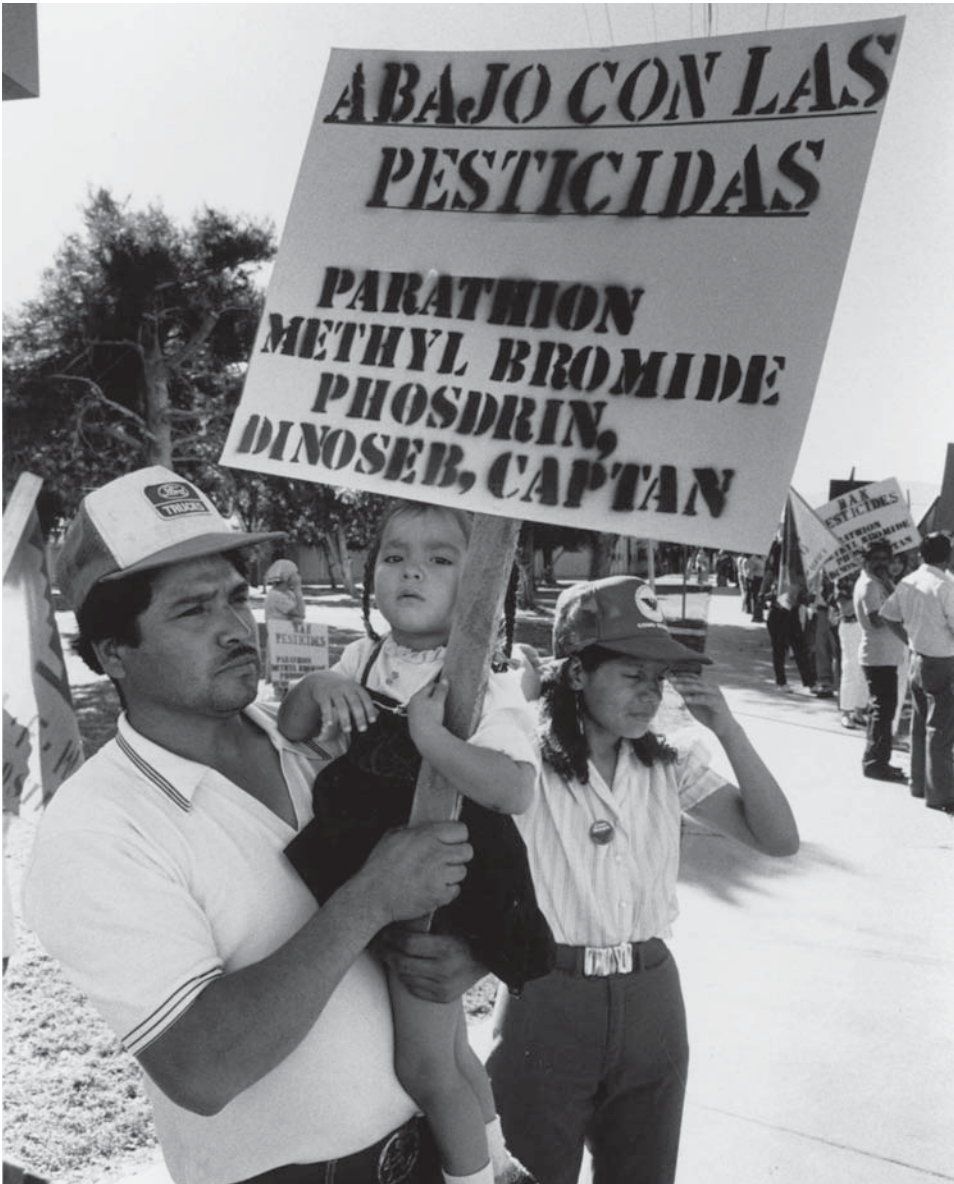
Farm workers in Indio, California demonstrate in support of a ban of five dangerous pesticides that threaten the health of themselves and their children: parathion, methyl bromide, phosdrin, dinoseb, and captan. Shows a man who holds his child and carries a sign that reads: "Abajo con las pesticidas" (Down with pesticides").