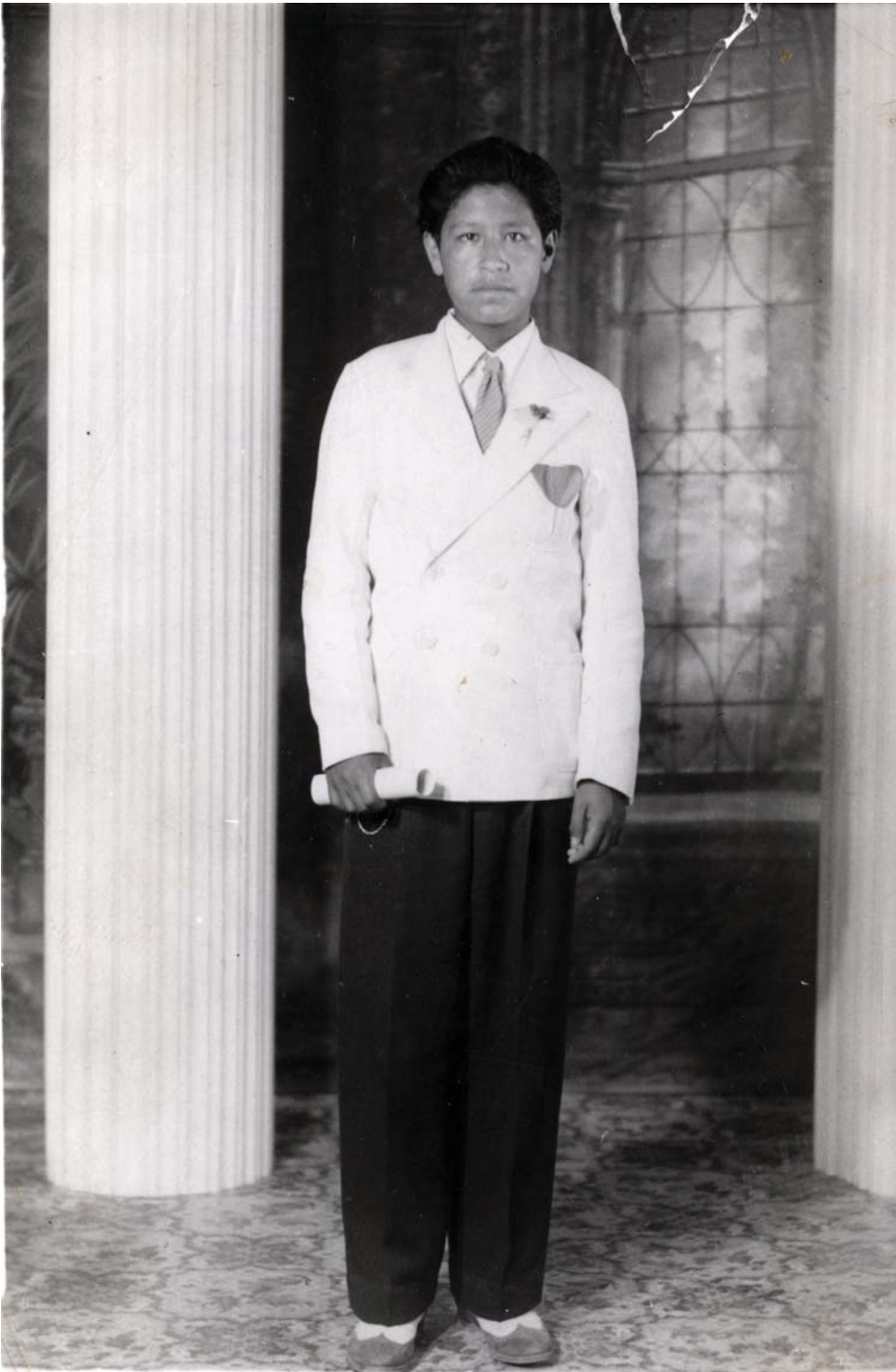
This portrait of Cesar Chavez was taken at his 8th grade graduation. This was his final year of formal schooling before he went to work in the fields full time.