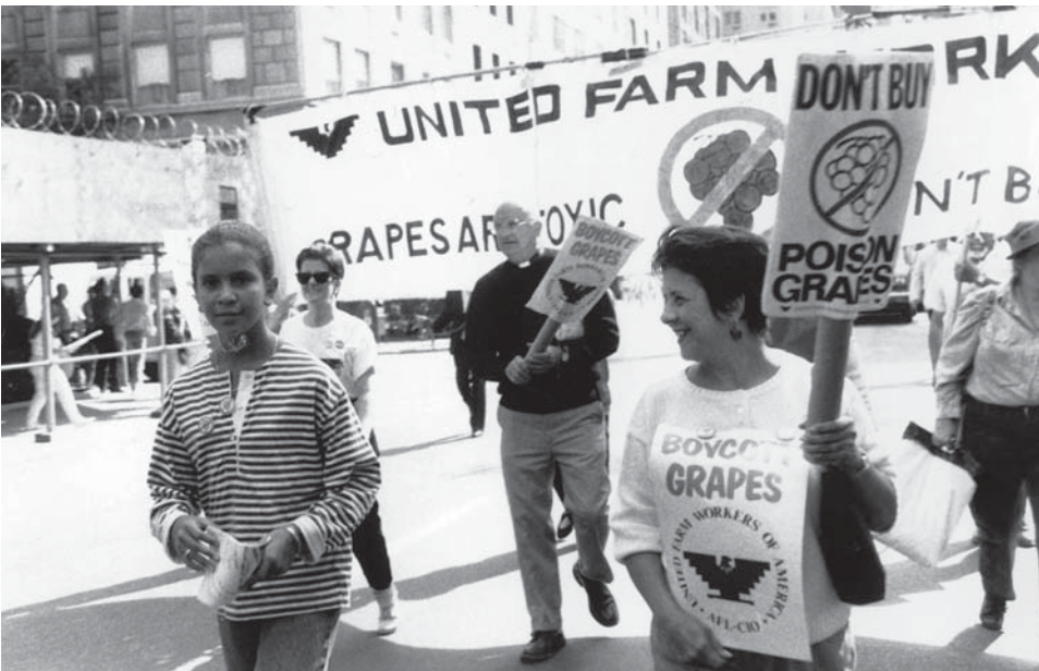
A demonstration for the United Farm Workers renewed grape boycott.