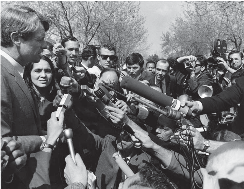
Senator Robert Kennedy and Dolores Huerta address the press at the end of Cesar Chavez's 25-day fast, Delano, California.