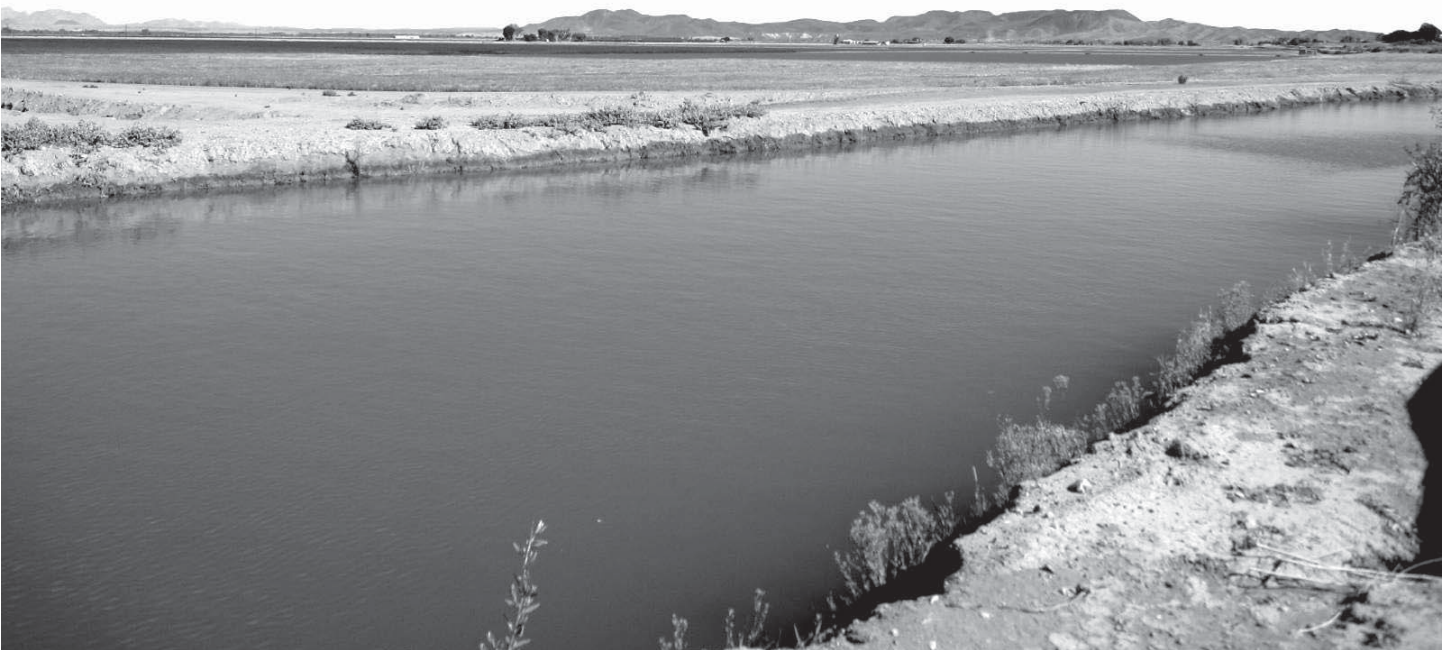
The adobe farmhouse faced this canal and the fields on the opposite side. Photo by: NPS, 2010