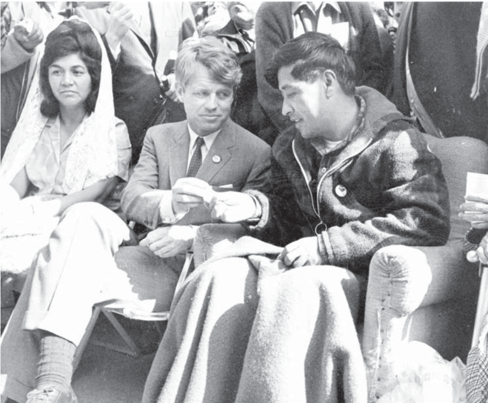
On March 10th, 1968, Cesar Chavez breaks his 25-day fast by accepting bread from Senator Robert Kennedy, Delano, California.