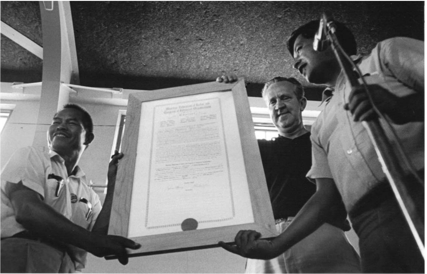
Larry Itliong and Cesar Chavez display the National Charter for the United Farm Workers Union. Photo courtesy of www.farmworker-movement.us . Photo by: Jon Lewis, 1972.