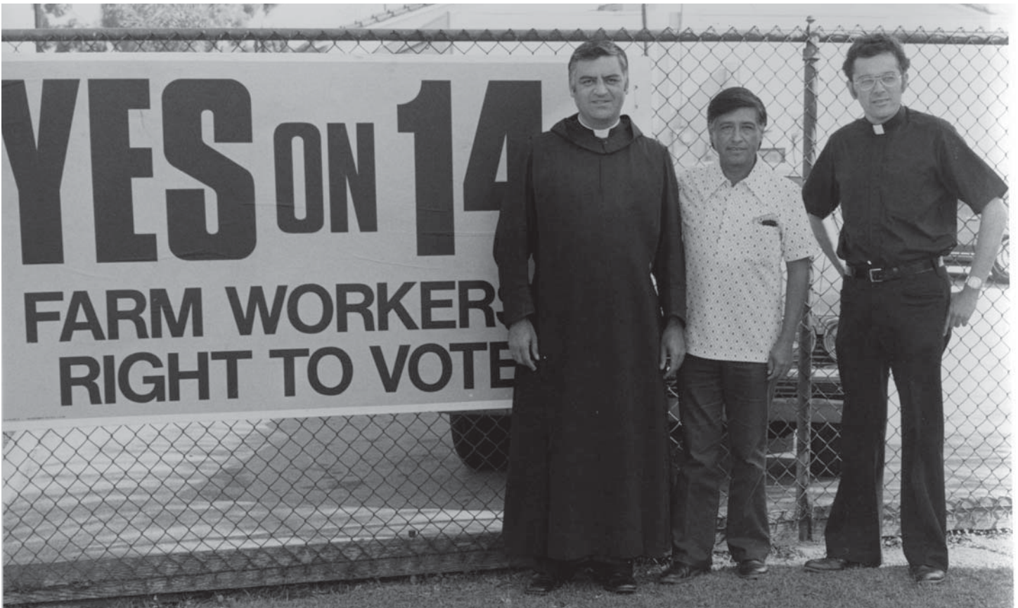
Cesar Chavez stands with two unidentified priests in front of sign in support of Proposition 14 that reads "YES ON 14 - FARM WORKERS RIGHT TO VOTE", location unknown. Photo courtesy of Walter P. Reuther Library, Wayne State University. Photographer unknown, 1976.