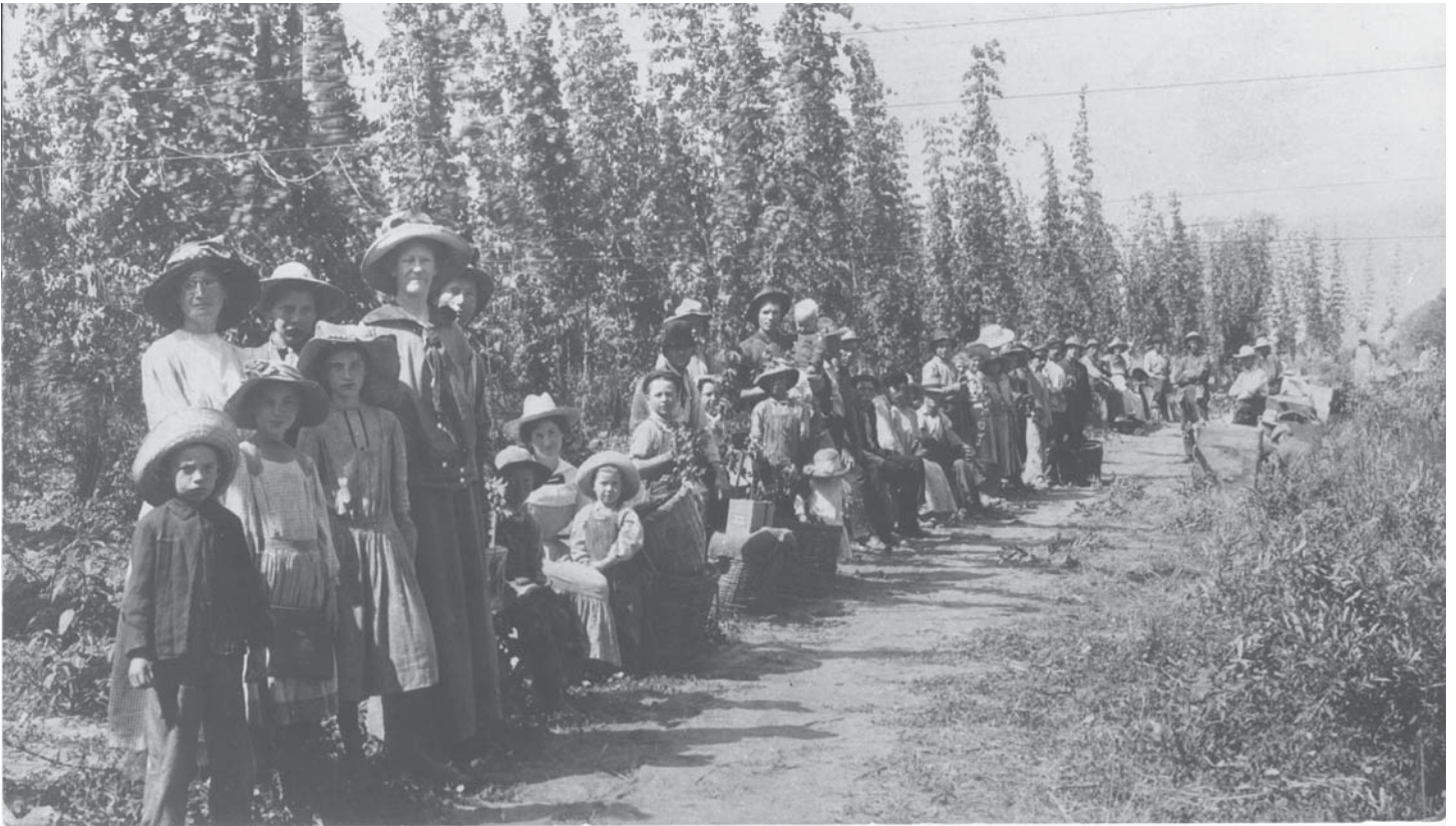
Hop pickers at the Durst Ranch near Wheatland in Yuba County, California included children.