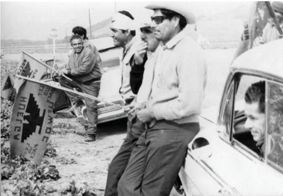
Members of the United Farm Workers (UFW) wave flags at the edge of a field during the lettuce boycott, Salinas, California.