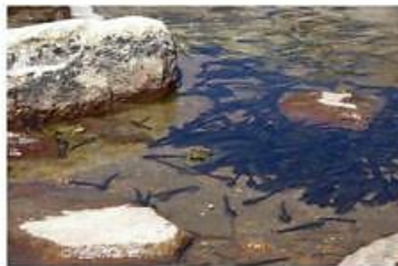
Figure 1. Adult and larval mountain yellow-legged frogs.

As part of the NEPA process, the NPS would like to hear from you. Do you have any comments, recommendations, issues, or concerns about the project? Your participation is important for our success and the future of the MYLF and high elevation lakes and streams.