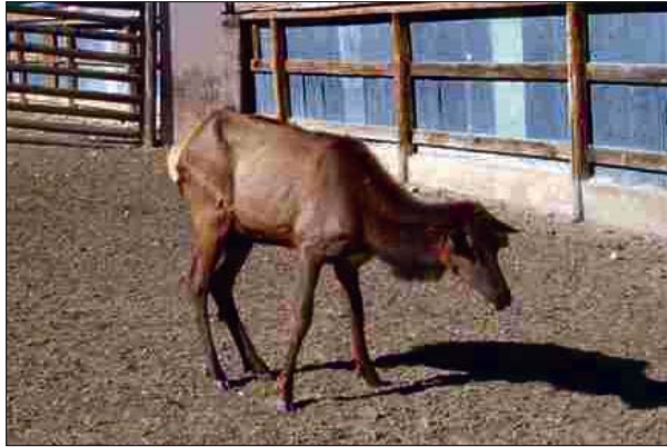
Elk with chronic wasting disease.