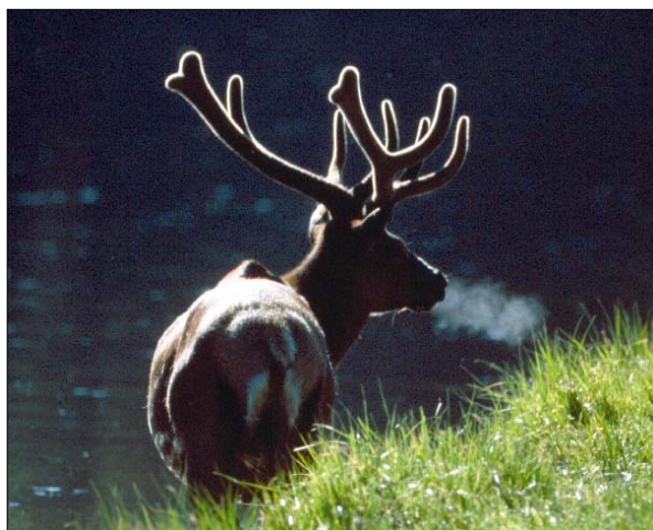
Elk in Grand Teton National Park.

elk annually wintering on the National Elk Refuge and around 2,500 elk summering in the park. Large concentrations of elk in winter would continue to focus on supplemental feedgrounds on the refuge. This alternative would have the highest risk for a non-endemic infectious disease to quickly spread through the elk population, with the potential for a major, adverse impact on survival, population size, and sustainability of the herd. The prevalence of brucellosis in the herd would remain similar to baseline levels and could increase with a larger bison population and more interactions between elk and bison.