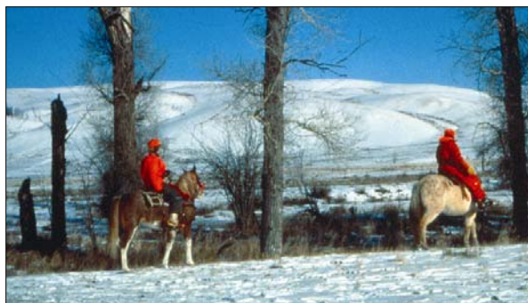
Hunters on the National Elk Refuge.

Bison Hunting — No bison hunting in Grand Teton National Park would be allowed under any alternative. No bison hunting would be allowed on