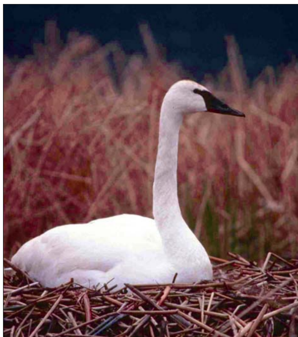
Trumpeter swan nesting on the National Elk Refuge.

woodland habitats and improved habitat conditions.