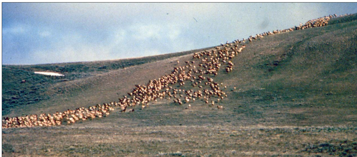
Elk migration on the National Elk Refuge.

— In 1996 a Jackson Bison Herd Long-term Management Plan and Environmental Assessment was completed by the National Park Service and the U.S. Fish and Wildlife Service, with the Wyoming Game and Fish Department and the U.S. Forest Service participating as cooperating agencies. The selected alternative called for public hunting on the refuge and in Bridger-Teton National Forest to control the rapidly growing bison population and the artificial concentration of bison during the