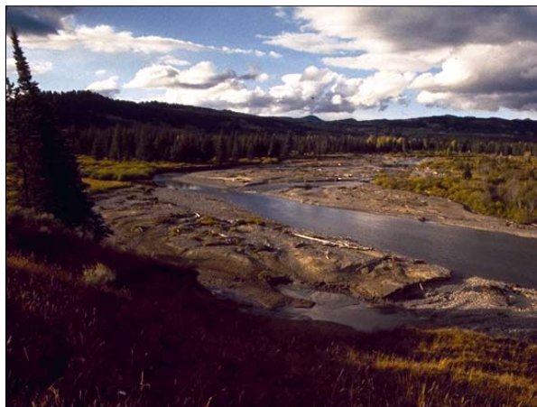
Riparian habitat along Pilgrim Creek in Grand Teton National Park.

Work cooperatively with the state of Wyoming and others to reduce the prevalence of brucellosis in the elk and bison populations in order to protect