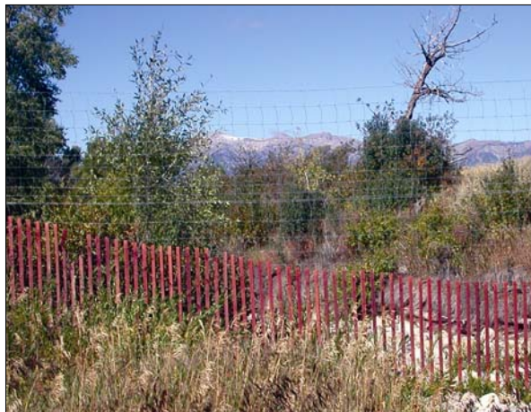
An enclosure on the refuge used to prevent browsing by elk and bison.

National Elk Refuge. Soils under all alternatives would be affected primarily by continued agricultural activities on the National Elk Refuge or the restoration of native vegetation on the refuge and in the park. Impacts on the refuge would be adverse and would range from negligible to minor over the short and long terms. Impacts in the