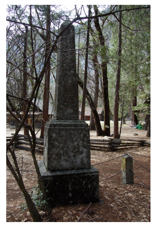
James Lamon Grave early 20^{\text{th}} century and 2013