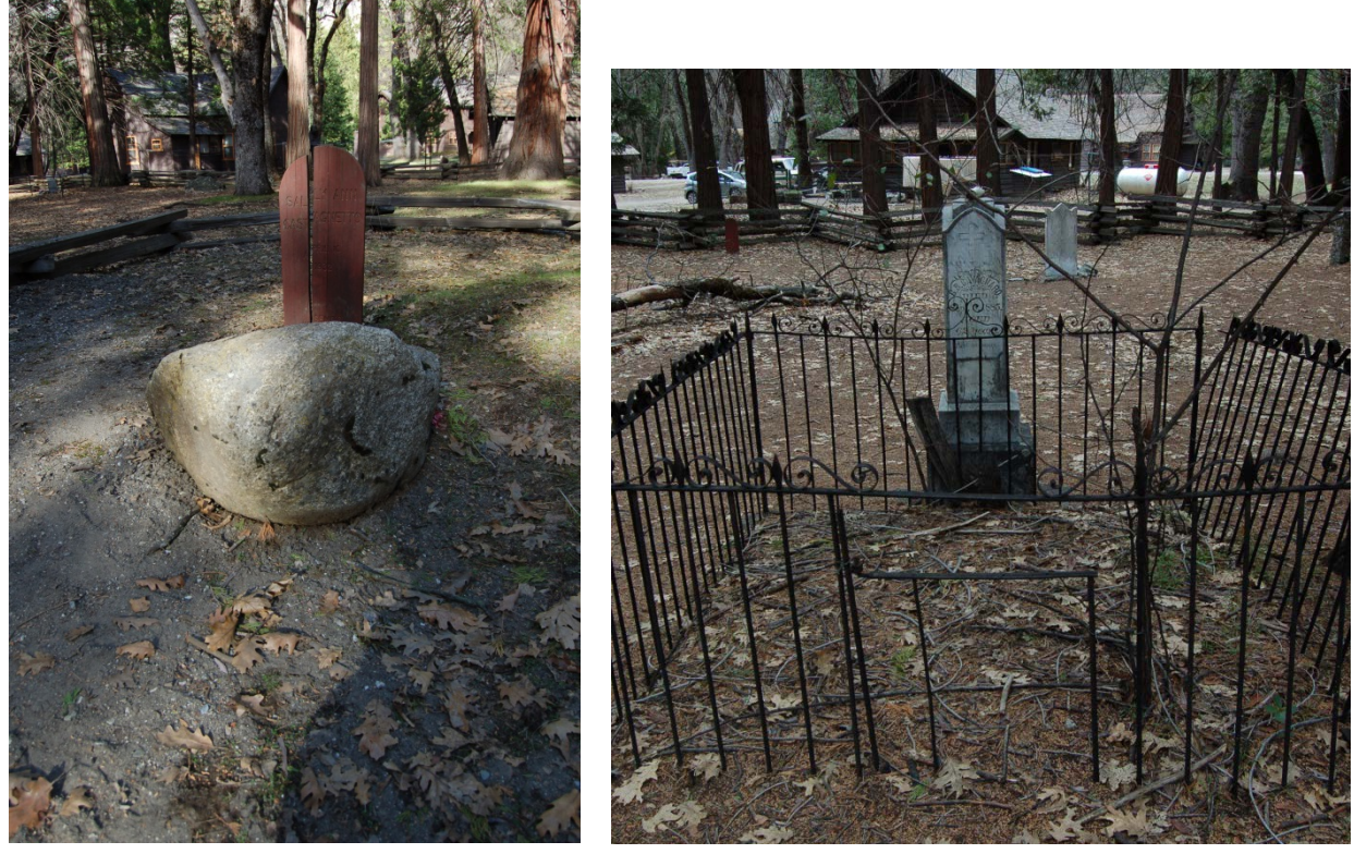
Replace and repair damaged monuments; clean stone monuments; repair fences; and remove saplings over graves