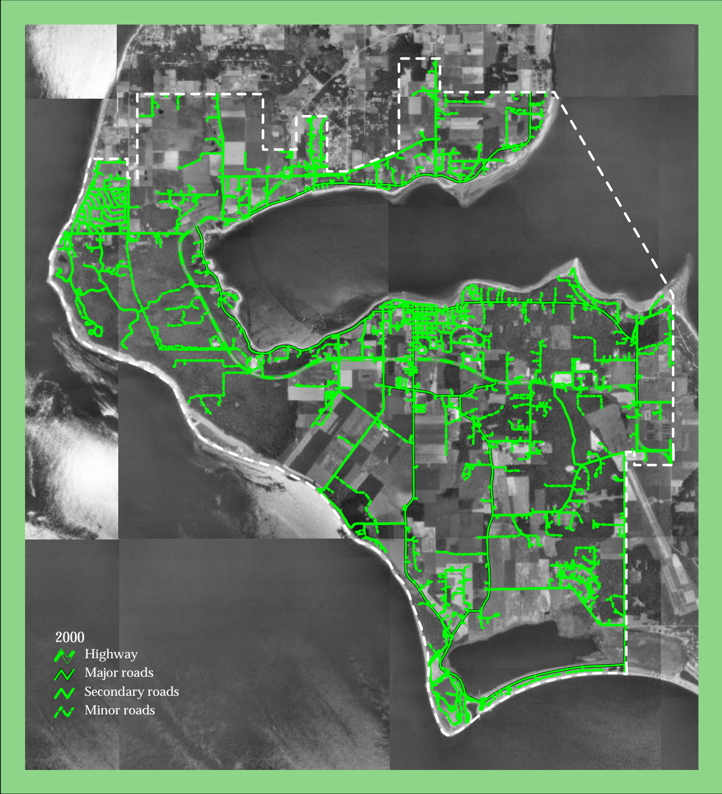
Cumulative Road Distance by Type