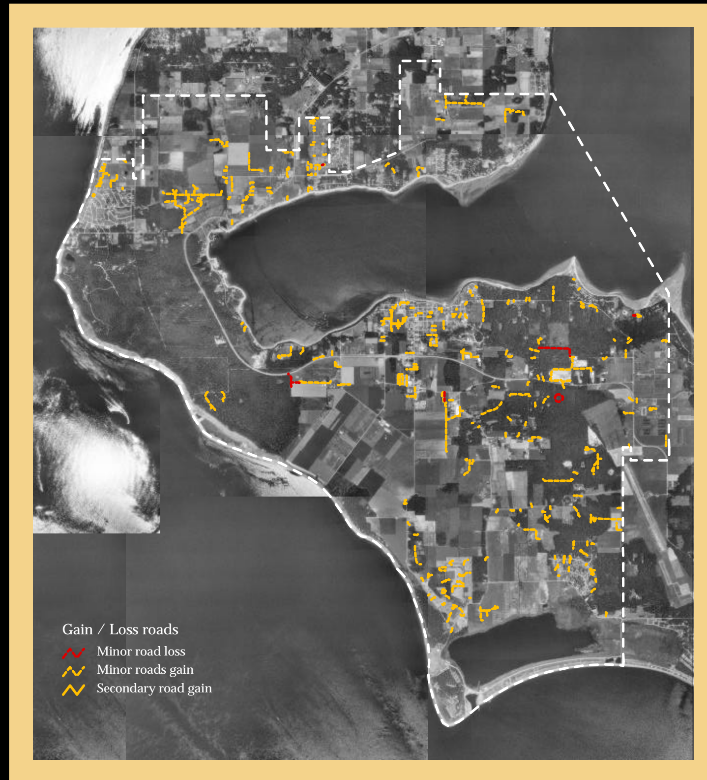
Net Change in Roads from 1983 to 2000