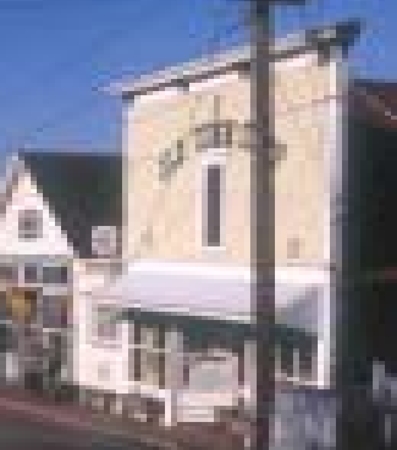
Front Street in Coupeville, Whidbey Island, ca. 1999.