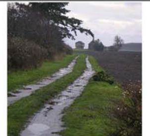
Image showing a simple two-track, rural road leading to the Jacob Ebey House. This road could be converted into an accessible trail and also serve as a vehicle access route for NPS maintenance and the Nature Conservancy. The rural character of the two-track road should be maintained.

Information presented in this plan is based on the draft GMP.