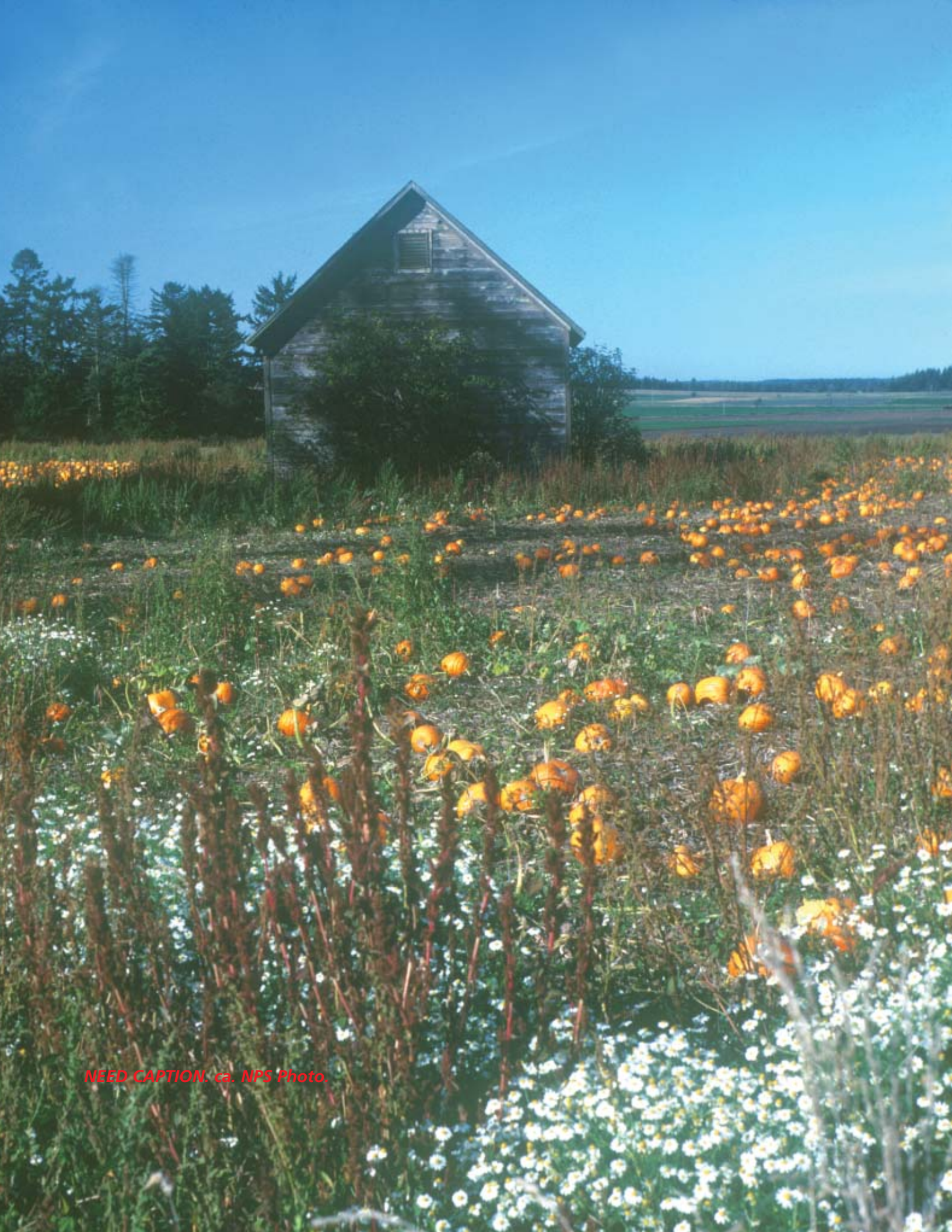
NEED CAPTION. ca.