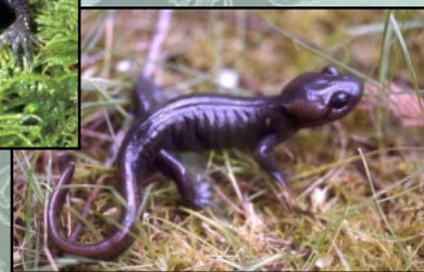
Adult northwestern salamander