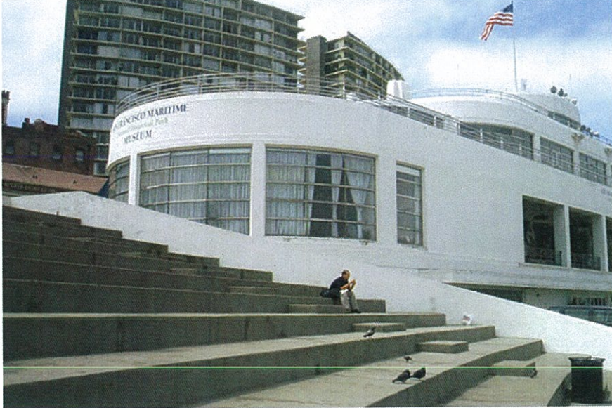
Facility ID painted on East side