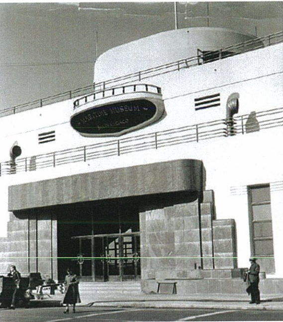
Vessel Transom attached to the facade.