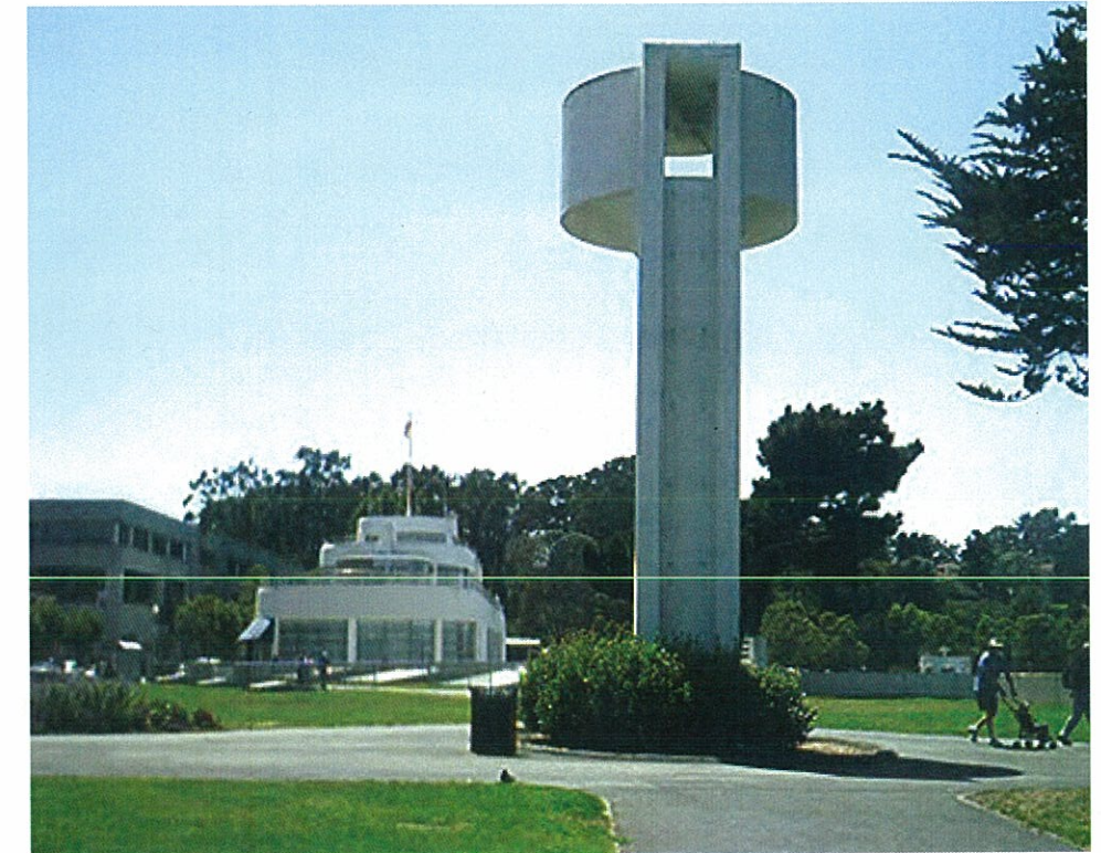
View across Aquatic Park