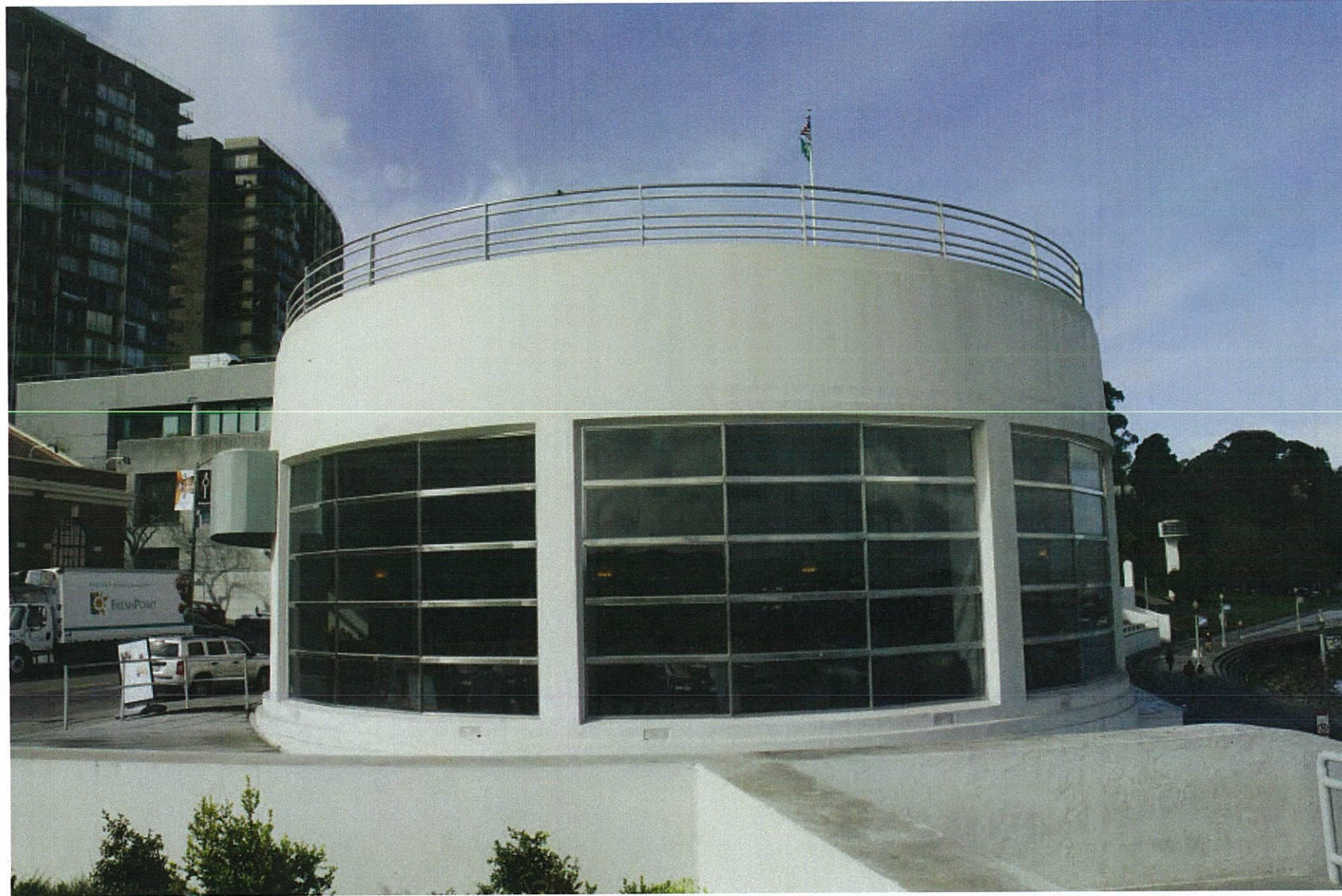
EAST SIDE - side view from across Aquatic Park