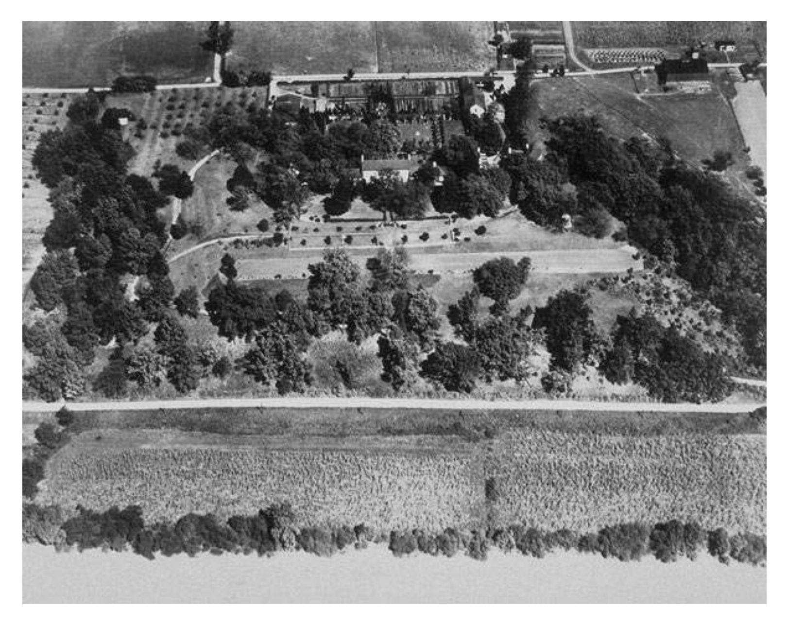
Aerial Photo of Chatham – 1939

Note the vegetation that has grown up on the terraces and along the river bank, but the river bottom lands were still relatively devoid of vegetation