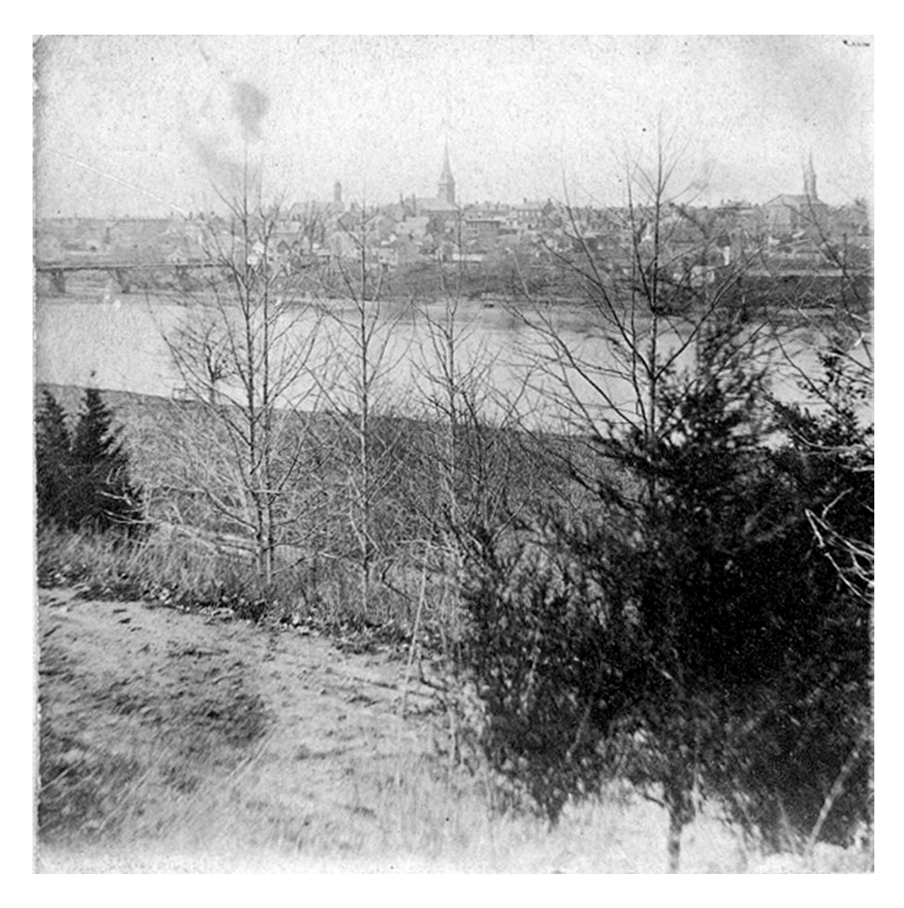
View of Fredericksburg from Chatham – 1880s

This view was taken from the Chatham carriage road, looking south across the Rappahannock River toward Fredericksburg.