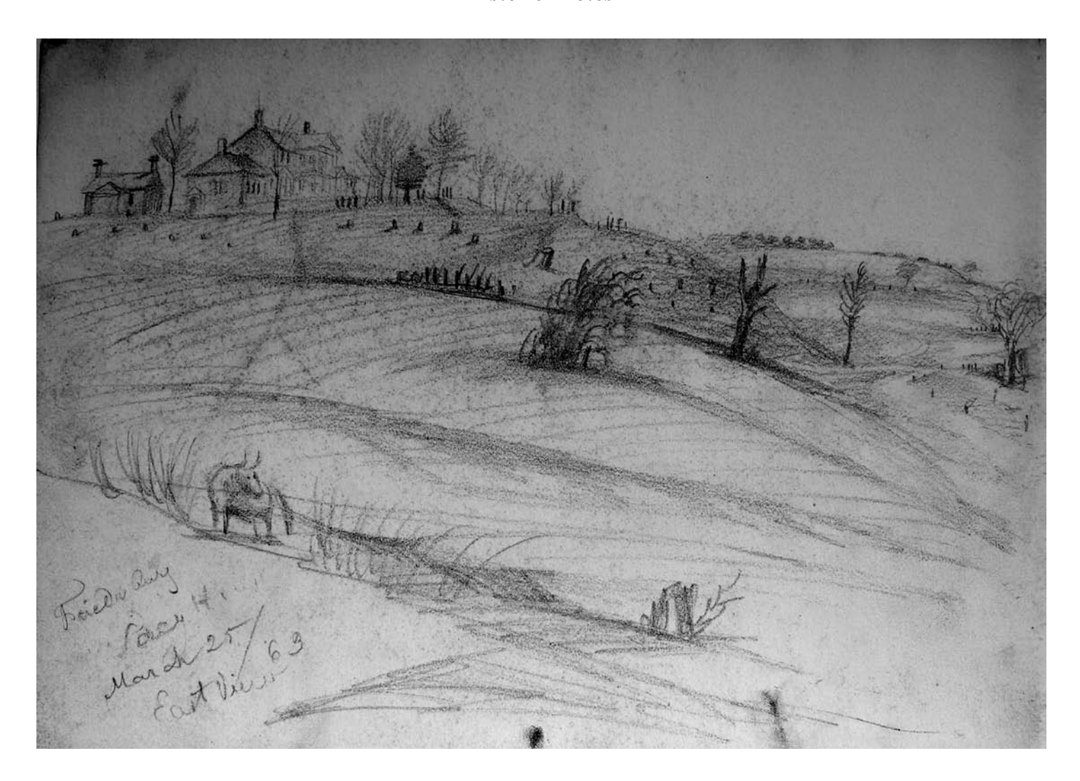
US Soldier's Sketch of Chatham – May 1863

This perspective is looking southeast across the front of Chatham. Note the lack of vegetation along the front slopes of Chatham