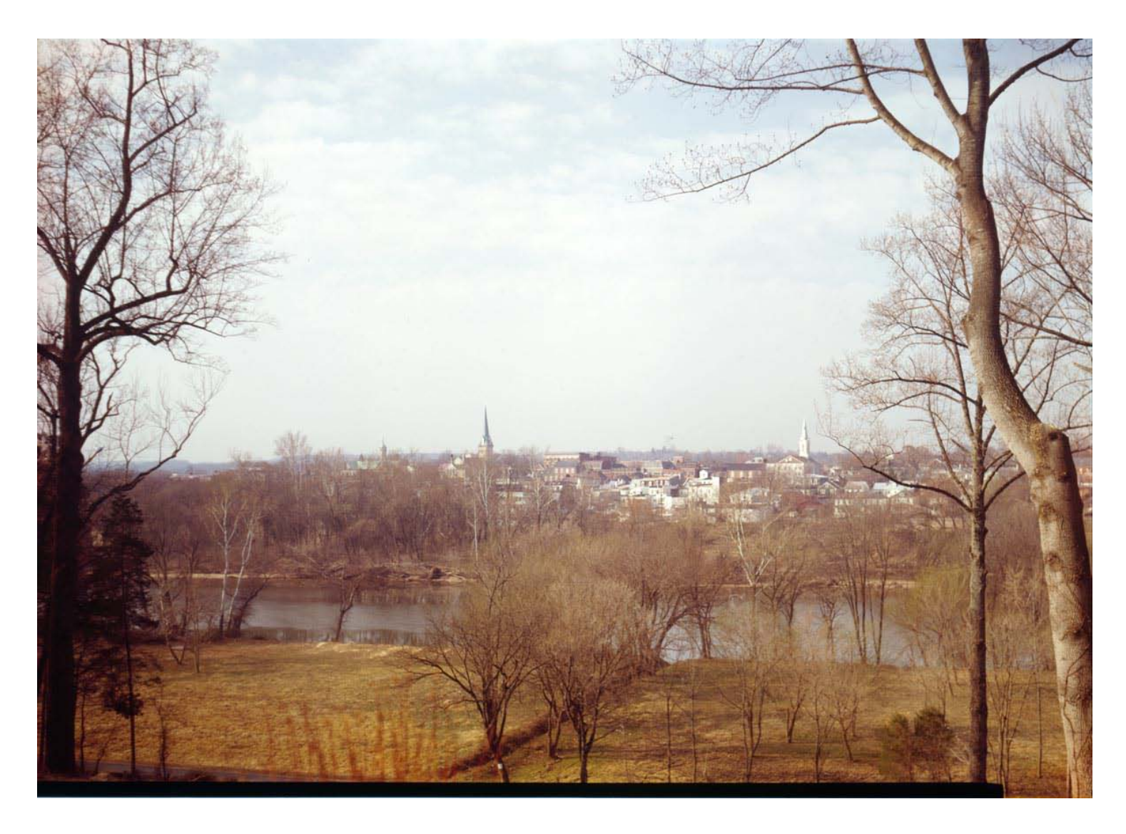
View of Fredericksburg from Chatham – 1970s

This view was taken from the Chatham carriage road looking southwest toward Fredericksburg.