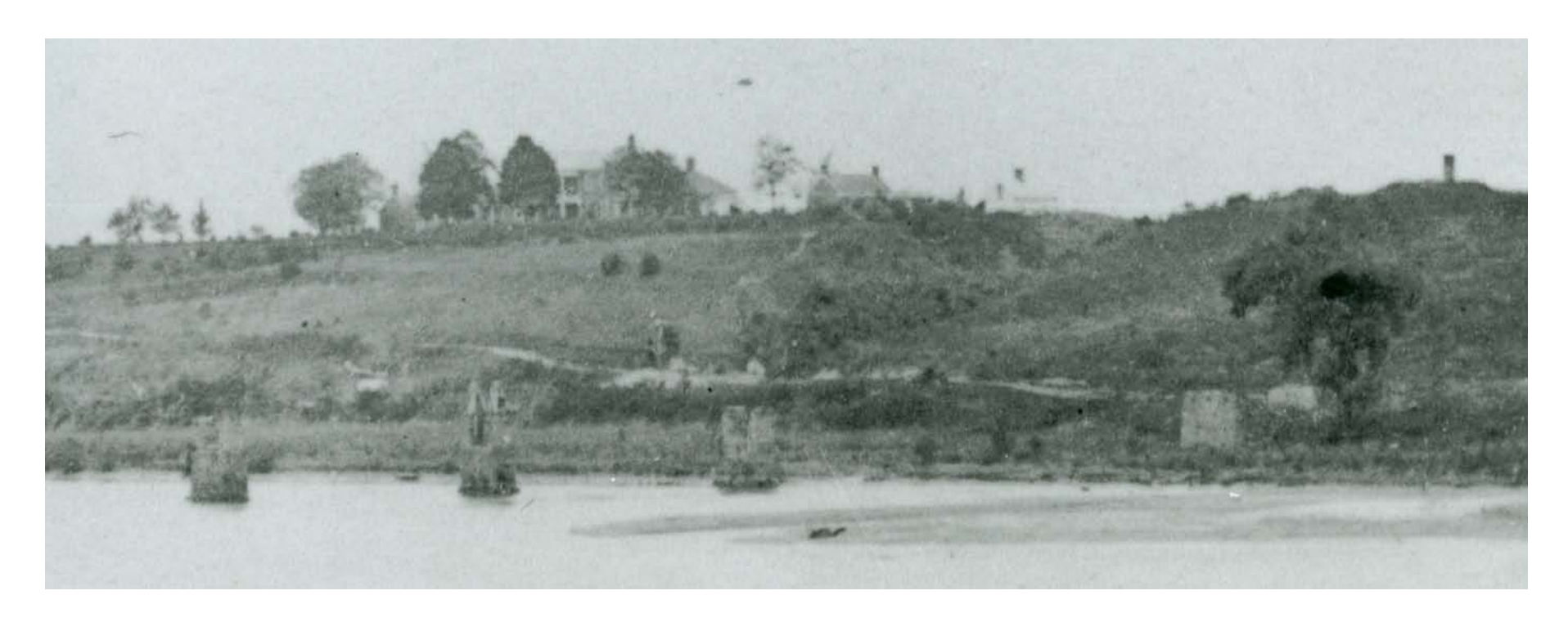
View of Chatham - May 1864

This view was taken looking north, across the Rappahannock River toward the front of Chatham.