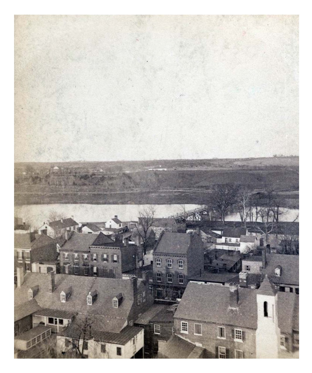
View of Chatham – 1880s

This view was taken looking north, across the Rappahannock River toward the front of Chatham Note the lack of vegetation along the river bank and the slopes leading up to Chatham.