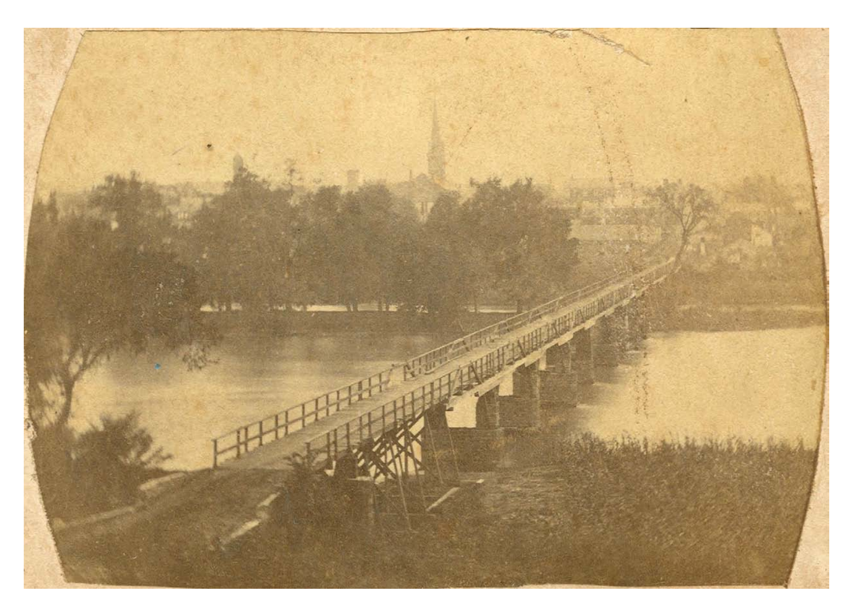
View of the Chatham Bridge – 1870s

This view was taken looking southwest across the Rappahannock River toward Fredericksburg.