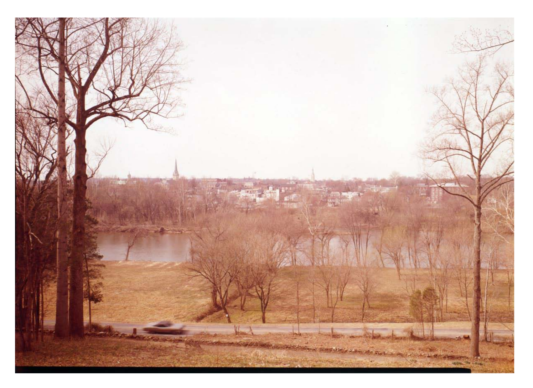
View of Fredericksburg from Chatham – 1970s

This view was taken from the Chatham lower terrace looking southwest toward Fredericksburg.