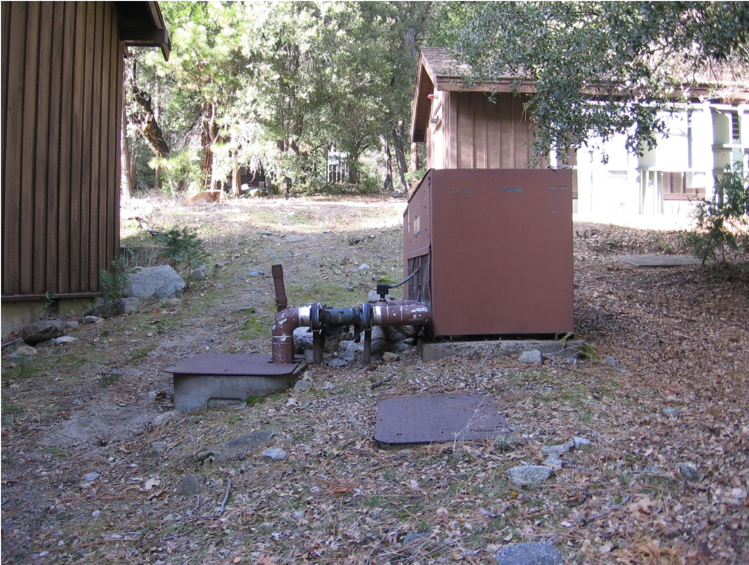
Proposed Propane Tank Location