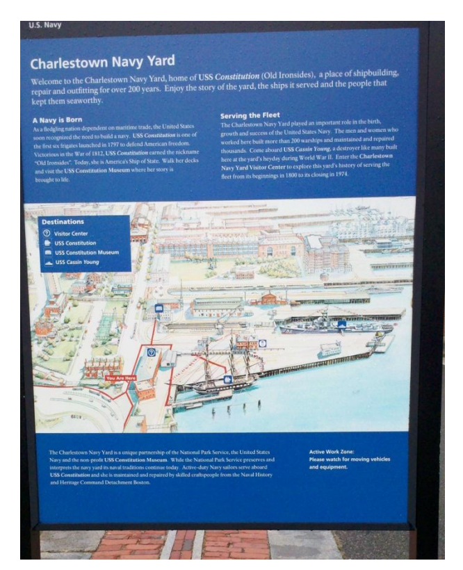
1. Sign at Entrance to Charlestown Navy Yard

of the Navy and service to the fleet. Yet the visitor's attention is directed to just four selected "destinations" in an expansive landscape—the Visitor Center, the USS Constitution, the USS Constitution Museum, and the USS Cassin Young—suggesting that the spaces between and beyond these highlighted points are detached or less worthy. The red lines on the map delimit and chart a route through a space that is a parking lot, not only in appearance but in function. It is a parking lot for historic ships and tourist services, and it requires a high degree of self-motivation and interest on the