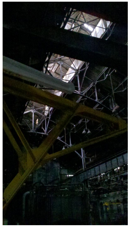
2. Chain Forge interior

scale industry. Industrialization and deindustrialization were the dominant forces shaping lives and American history in the nineteenth and twentieth centuries, especially in northeastern cities. Does the National Park Service have a better opportunity to preserve and provide access to this history? If preserving buildings and machinery is beyond the realm of possibility, how might the experience be documented—not only through measurements and reports that will serve institutional purposes but through artistic expression to capture the essence and scale of light, sound, and feeling? Would it be impossible to light the interiors and allow visitors to glimpse this world of the recent pass through glass?