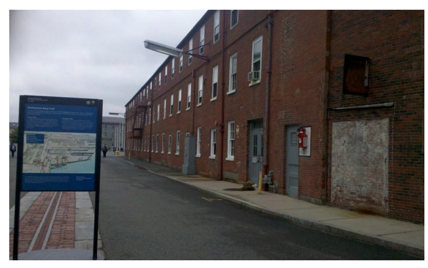
4. Approach to Charlestown Navy Yard

How to make the connections and transitions from other sites that focus on the American Revolution? As discussed during the scholars' visit in 2011, the pivot points between the units of Boston National Historical Park could be used to