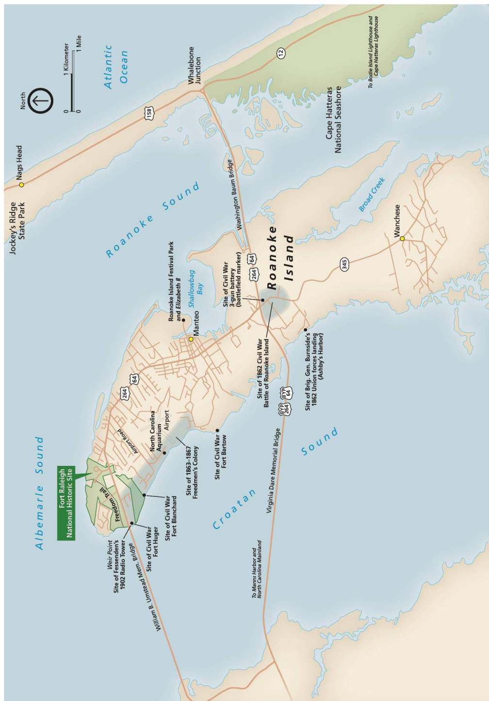
Map of Fort Raleigh National Historic Site Fort Raleigh National Historic Site U.S. Department of the Interior - National Park Service