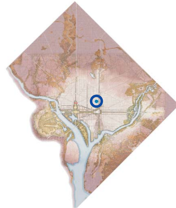
Figure 2-2: Proposed Memorial site - NCPC Memorials and Museums Master Plan Site 98 - Reservation 77B

Site 98’s size and configuration at the intersection of Massachusetts Avenue, New Jersey Avenue and G Street, NW, make it an appropriate location for placement of a small memorial such as the Victims of Communism Memorial. Its proximity to the Georgetown University Law Center “begins a dialogue between the memorial and the school as the rule of law is an essential component of freedom and democracy and the antithesis of communism.” Site 98 will also provide for a direct line of site and connection between the planned Democracy Statue and Freedom Statue atop the U.S. Capitol. Unanimous endorsement of Site 98 as the location for the Memorial was provided by the Zoning and Planning Committee of ANC6 at its March 2, 2005 meeting and by the full ANC on March 9, 2005. Approval of Site 98 was also granted by the NCMC on March 15, 2005, the CFA on March 17, 2005, NCPC on April 7, 2005 and the SHPO on April 11, 2005.