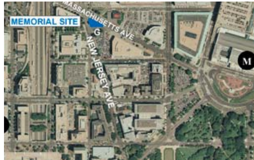
Figure 1-2: Proposed Memorial study area

The selected site for the Memorial is defined by the intersection of Massachusetts Avenue, New Jersey Avenue and G Street, NW. The chosen location of the Memorial permits an unimpeded view of the U.S. Capitol, topped by the symbolic Statue of Freedom. For the purpose of identifying environmental impacts potentially associated with the proposed Memorial, the study area can be defined as the area within two to three blocks of the site. The defined study area is intended to serve as a guide within which short-term, long-term, and cumulative impacts of the proposed Memorial are analyzed. The study area may expand or contract for each resource discipline, depending upon the potential for a specific impact to affect a given geographical area.