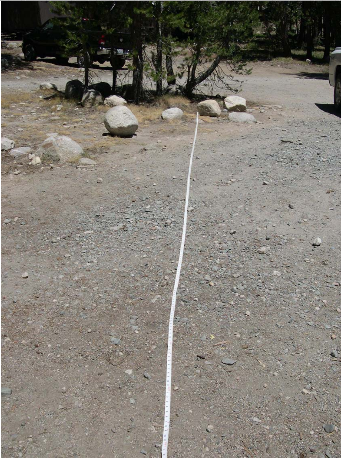
Approximate location of proposed trench