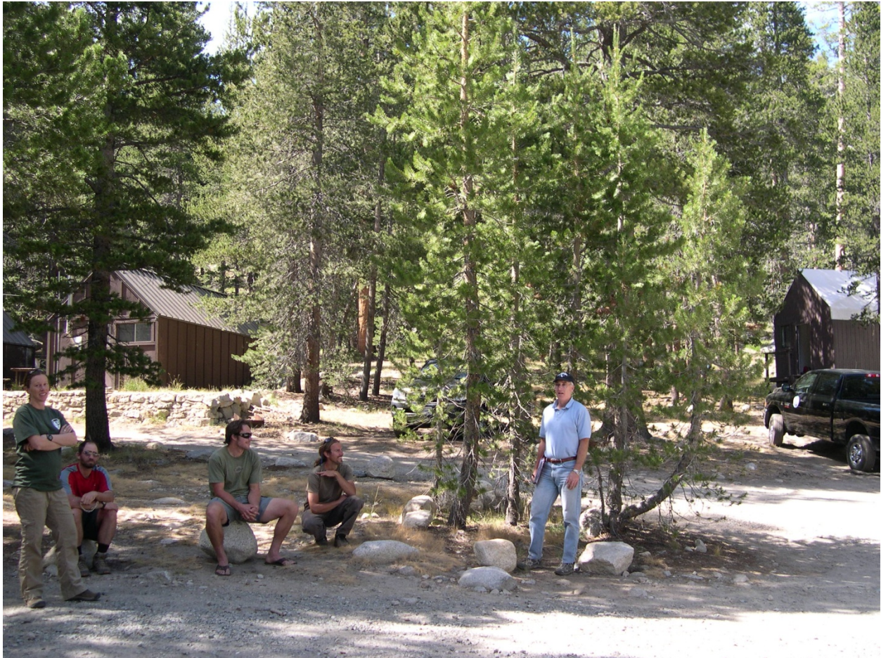
Proposed location of dish (Where Chuck is standing - in front of trees)