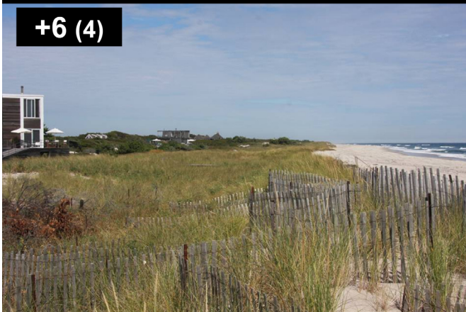
Beach with development behind the dunes.