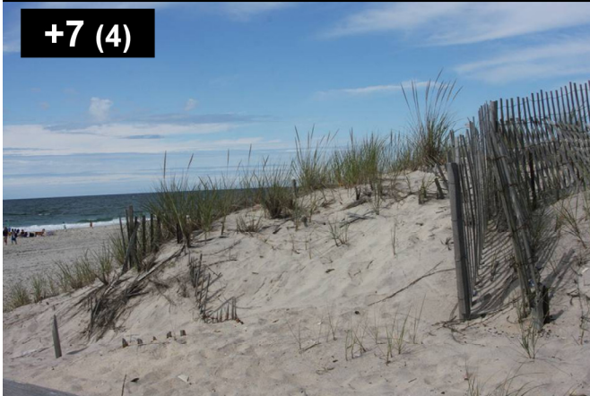
A view of sand dunes with vegetation and fencing.