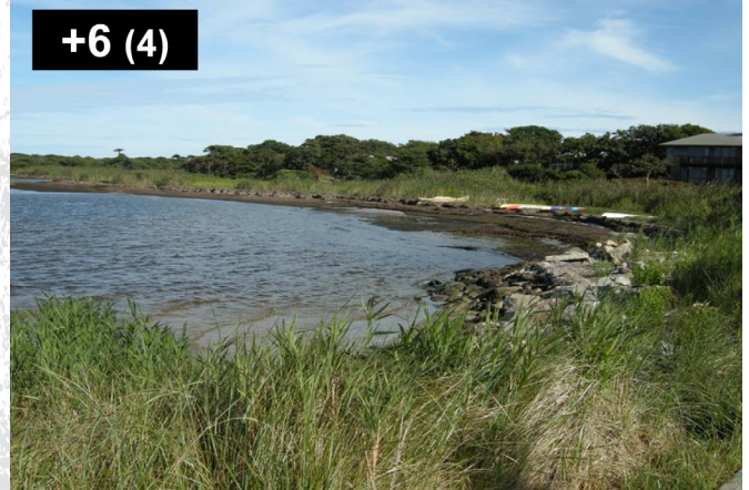
This is the second image of the bay side.