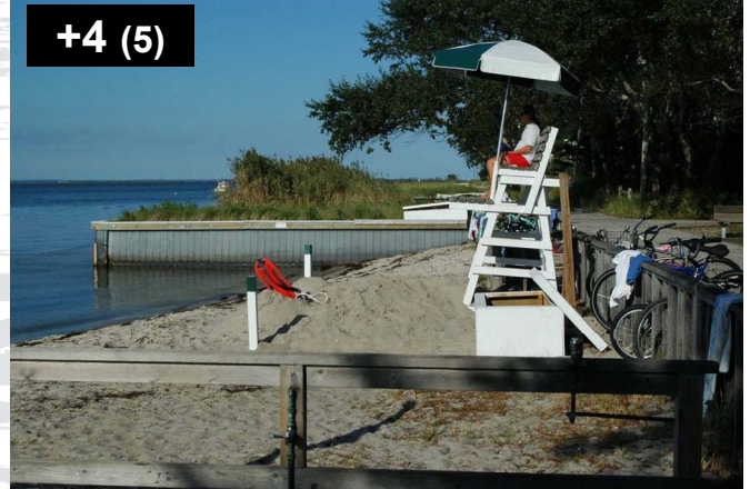
Bayside public beach.