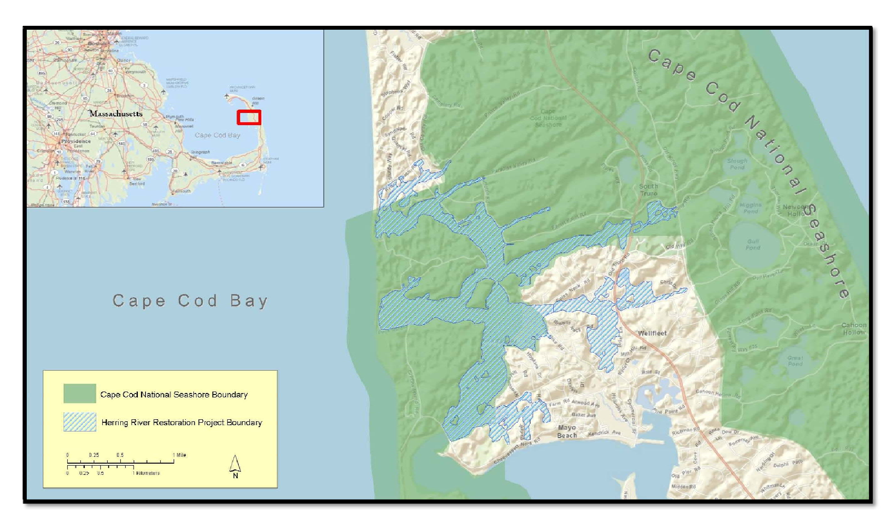
FIGURE 1. HERRING RIVER RESTORATION PROJECT AREA

Appendix F: Essential Fish Habitat Assessment for the Herring River Restoration Project