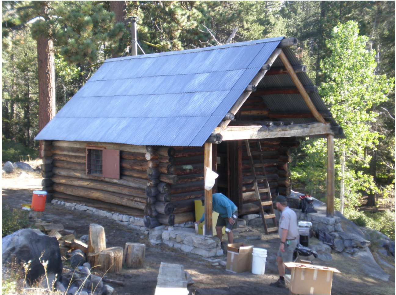
Lake Vernon Patrol Cabin