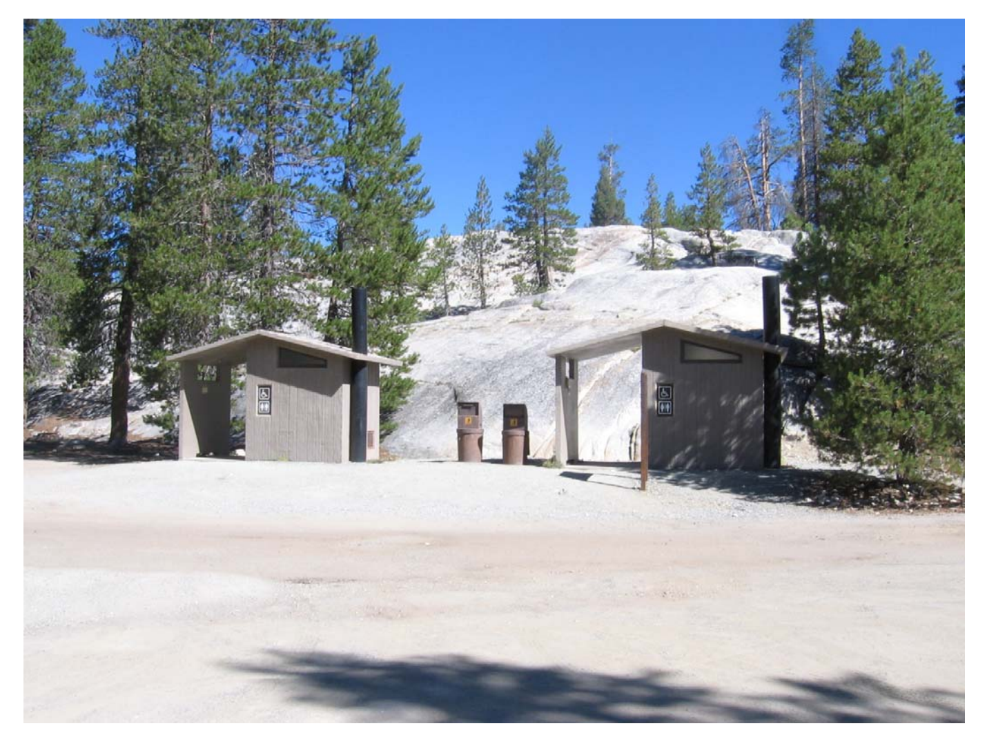
Existing Yosemite Creek Campground Toilet Facilities (west of creek)