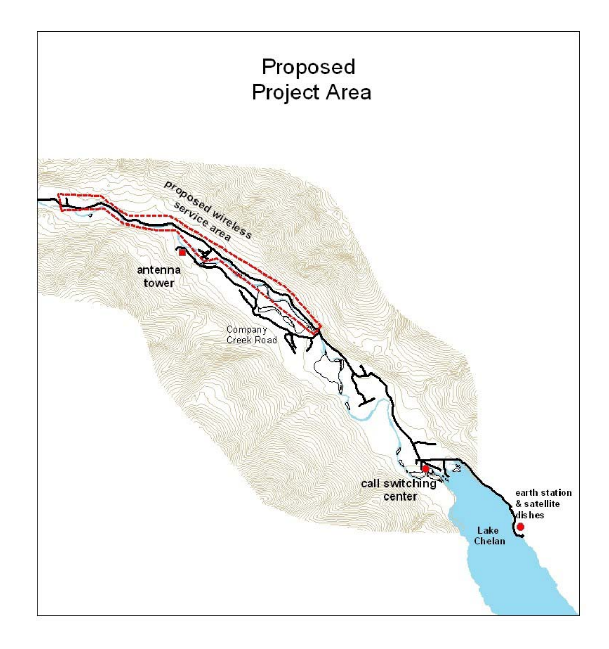
Figure 1. The proposed project area in the Stehekin Valley including location of underground lines and wireless areas.