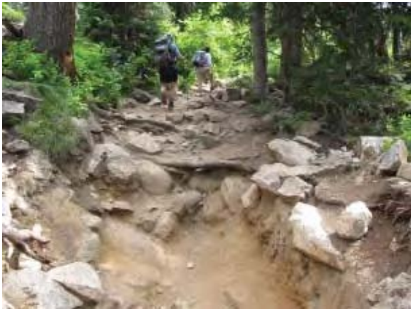
Rugged trail conditions on the way to Hidden Falls/ Inspiration Point caused by erosion