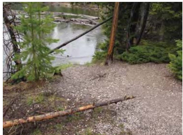
Social trails and compacted and eroded shoreline along the String Lake Outlet