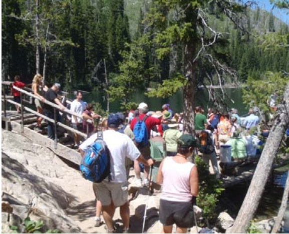
West boat launch staging