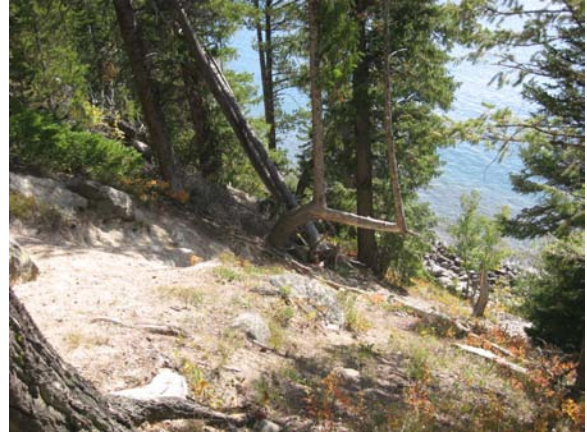
User created trail at South Jenny Lake