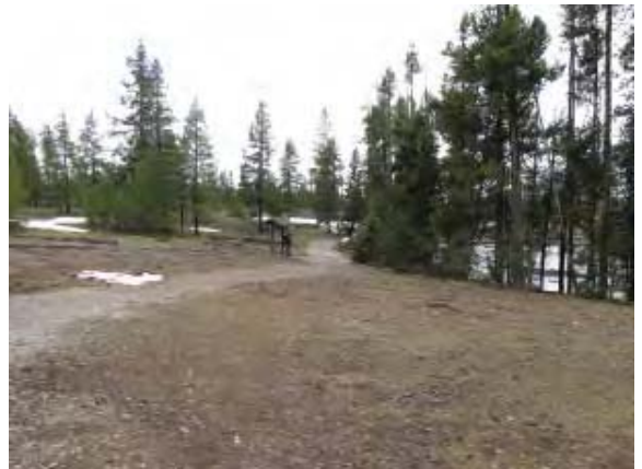
Bare ground along the String Lake Outlet area