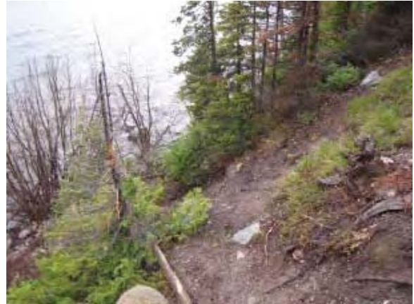
Social trails leading in both directions from the base of the lake access trail at Jenny Lake Overlook