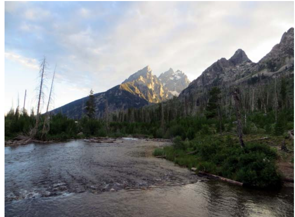
String Lake Outlet