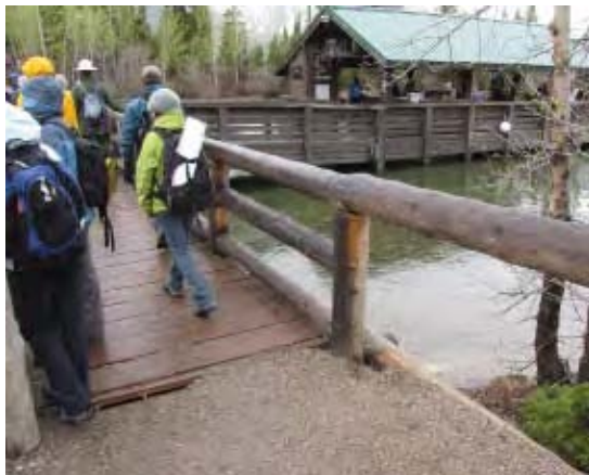
Bridge to east boat dock