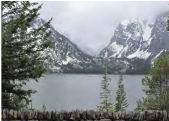
View from Jenny Lake Overlook