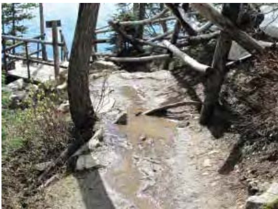
Trail conditions near the west boat launch