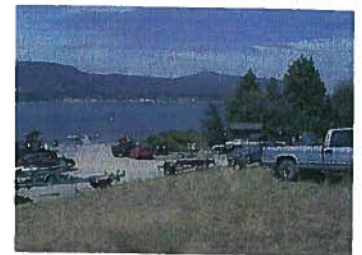
Overcrowding at Bradbury Beach

tion months, it failed to anticipate the continued lowering of the reservoir during the months of August and September. This fact, in combination with the continual increase in annual visitation has brought into question the ability of LRNRA to physically accom-