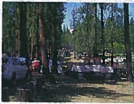
Summer Weekend at Porcupine Bay