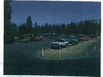
Fort Spokane boat launch in the Summer

alone is nearly 190,000. The proposed project would potentially add: parking, capable of accommodating an additional 60 vehicles with trailers; and an additional lane to the existing boat ramp. This project is designed to reduce boat launching/retrieval congestion, accommodate increased visitation and enhance the visitor experience at this location.