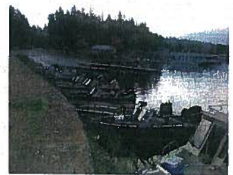
Kettle Falls Marina

Kettle Falls and rehabilitate or move the currently unusable Kettle Falls Swim Beach. This project would not only service marina visitors, it would increase recreational opportunities for visitors and the local community.