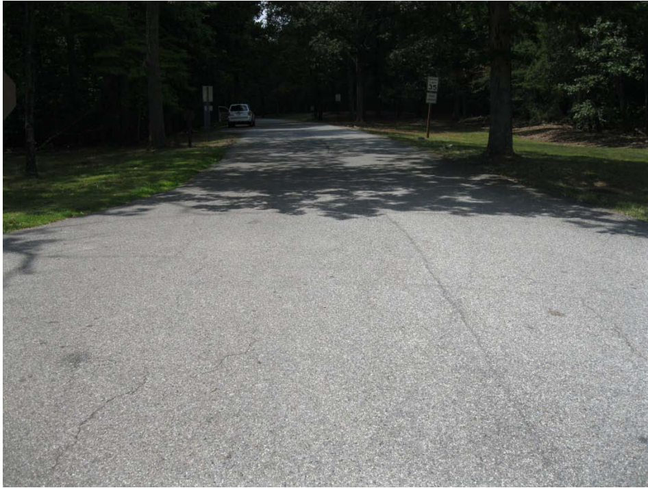
View of Hill-Ewell Drive from its terminus with County Route 621. Note the cracks in the asphalt surface.