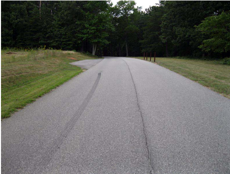
View of Hill-Ewell Drive near the Widow Tapp Field pull-off. Note the crack running down the center of the road.