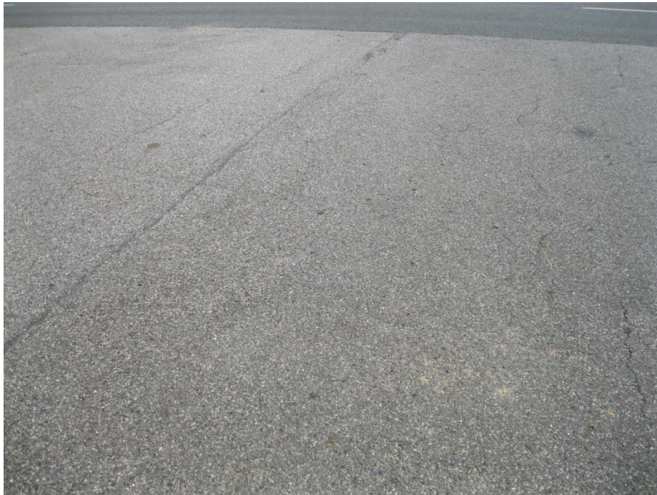
View of asphalt pavement surface on Hill-Ewell Drive. Note the cracks