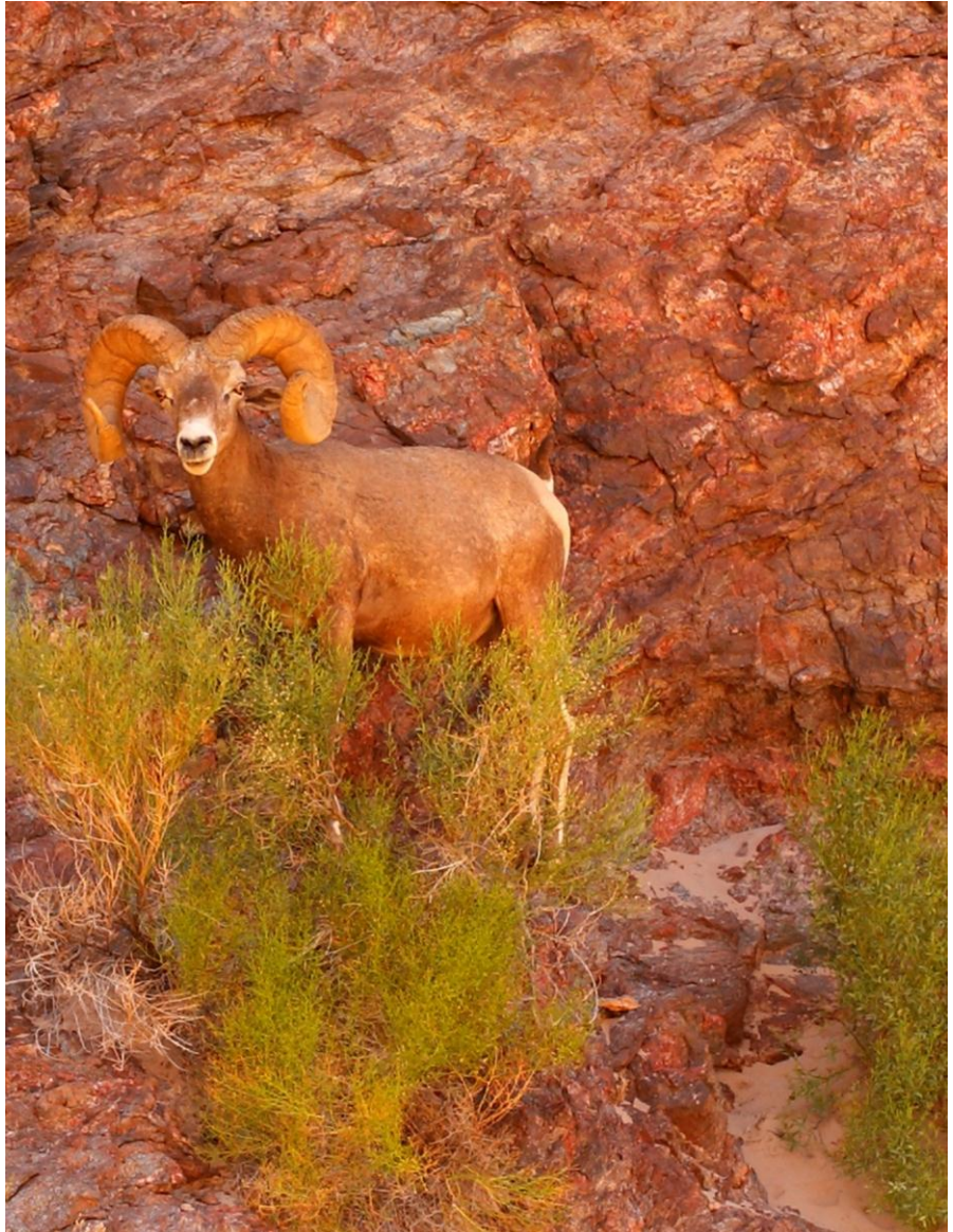
Bighorn in Grand Canyon, NPS Photo by Brian Healy

Numerous comments related to wilderness designation were received from the public. To clarify, the updated plan will not change the current wilderness status. However, potential impacts to wilderness character and values will be identified for each alternative and included in the EIS. Find more information about Grand Canyon wilderness on page 2.